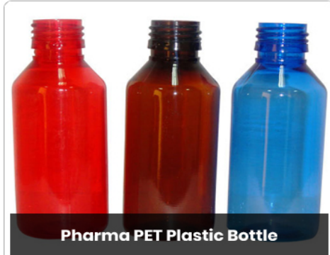
Pharma PET Plastic Bottle