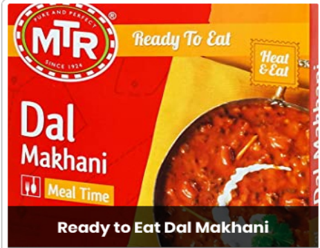
Ready to Eat Dal Makhani