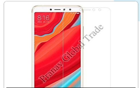
Redmi Phone Tempered Glass