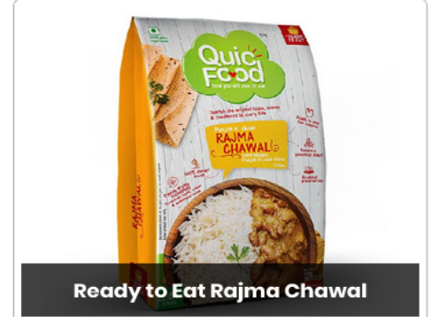
Ready to Eat Rajma Chawal