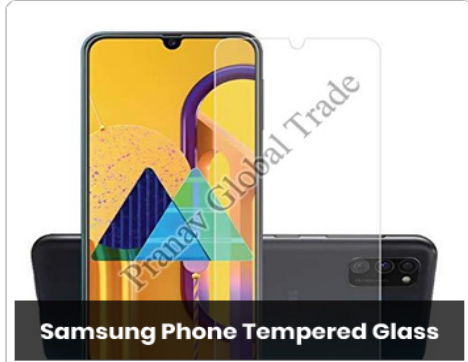
Samsung Phone Tempered Glass