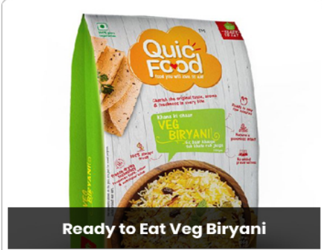
Ready to Eat Veg Biryani