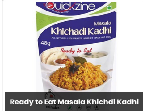
Ready to Eat Masala Khichdi Kadhi