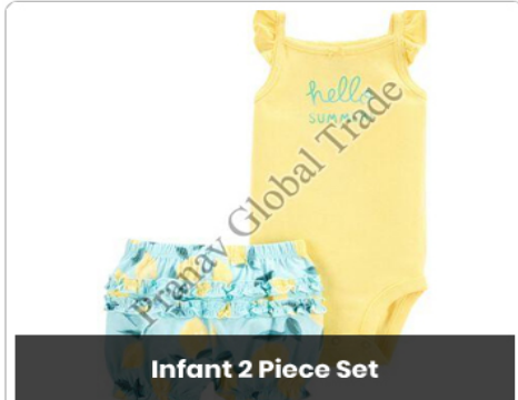
Infant 2 Piece Set