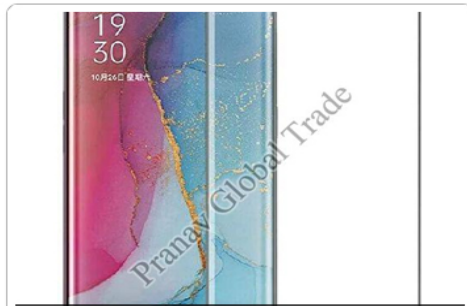
OPPO Phone Tempered Glass