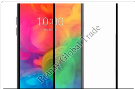
LG Phone Tempered Glass