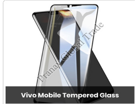
Vivo Mobile Tempered Glass