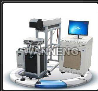
CNC Galvohead Router Machine