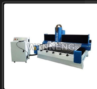
CNC Stone Engraving Machine