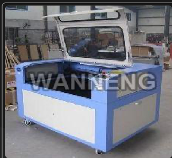
Mild Steel Laser Engraving Machine