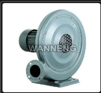
Laser Exhaust Fan