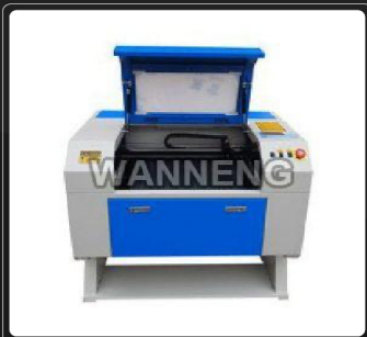
WTC6040 Laser Cutting & Engraving Machine