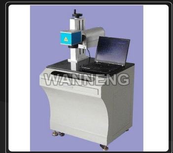
Fiber Marker Machine