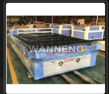
WTC1325 Laser Cutting & Engraving Machine