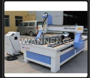
CNC Axis Router Machine