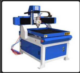
CNC Die Router Machine