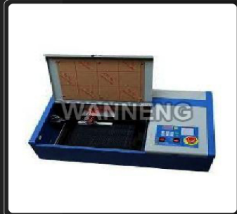
Mini Laser Cutting & Engraving Machine