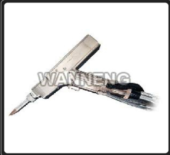
Fiber Laser Welding Machine