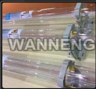
Glass Laser Tube