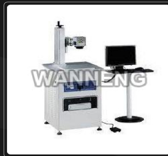
Laser Marker Machine