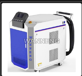
Laser Rust Removing Machine