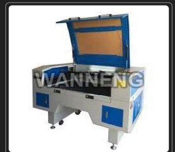
Stone Laser Engraving Machine