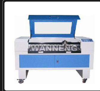
WTC1610 Laser Cutting & Engraving Machine