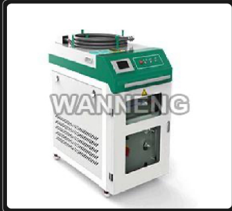
Hand Held Laser Welding Machine