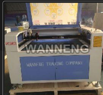
XR1390CL Laser Cutting & Engraving Machine