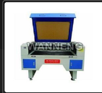
Mild Steel Laser Cutting Machine