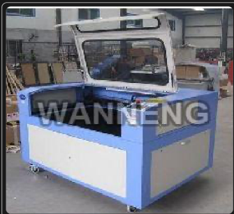
Automatic Laser Engraving Machine