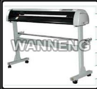
4 Feet Cutting Plotter