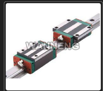
CNC Servo Voltage Stabilizer