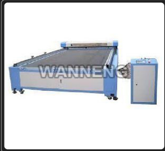
Acrylic Laser Cutting Machine