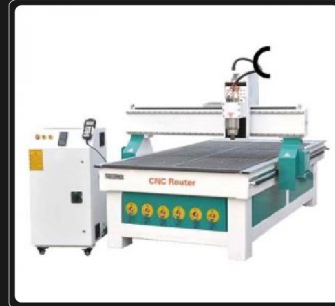
CNC Wood Router Machine