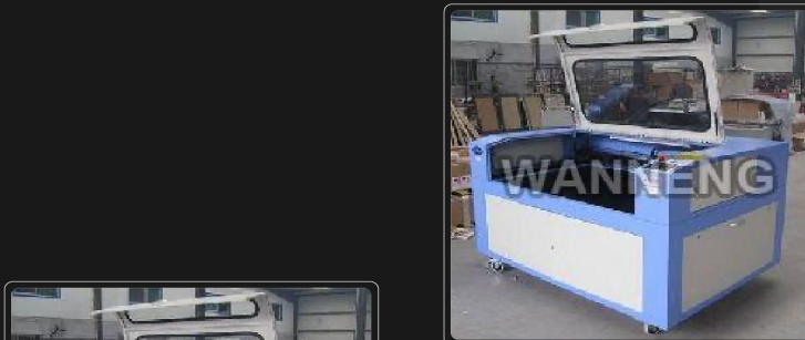
Industrial Laser Engraving Machine