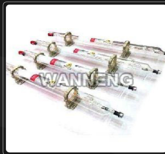
Industrial Laser Tube