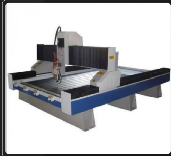
CNC Stone Router Machine