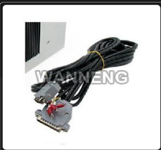
Laser Galvo Wire