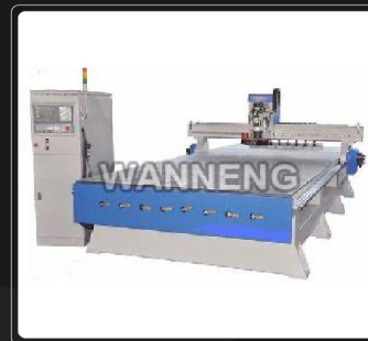
CNC Tool Changer Router Machine