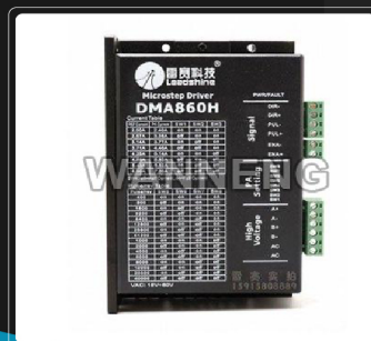
Leadshine Stepper Motor