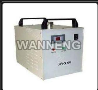
CW3000 Laser Water Chiller