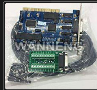
CNC Studio Card