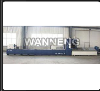
Angle & Pipe Laser Cutting Machine