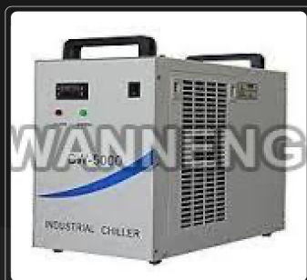
CW5000 Laser Water Chiller