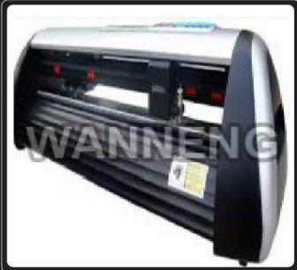
2 Feet Cutting Plotter