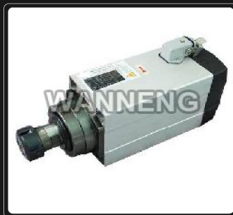
CNC Router Air Cool Spindle