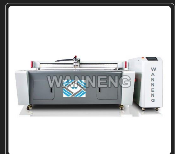
Oscillating Knife Cutting Machine