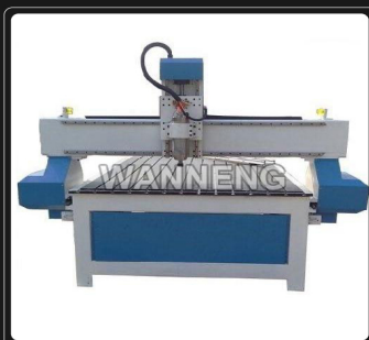
3D Wood Carving Machine