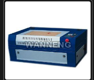
WTC5030 Laser Cutting & Engraving Machine