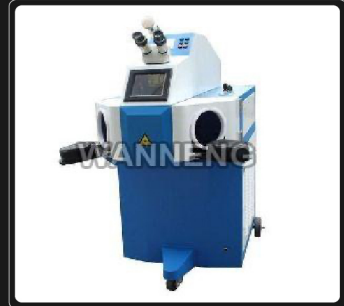
Jewellery Laser Welding Machine