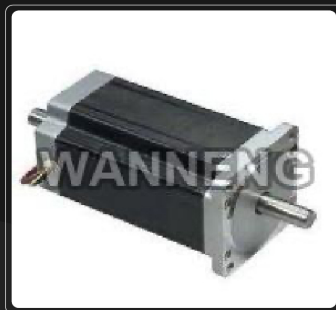
CNC Stepper Motor