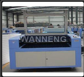
Fabric Laser Cutting Machine