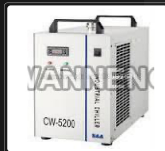
CW5200 Laser Water Chiller