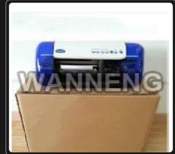
A4 Cutting Plotter