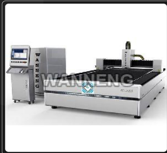
Fiber Laser Cutting Machine