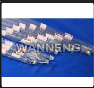
Co2 Laser Tube