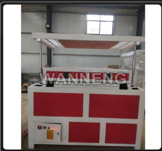
Industrial Vacuum Press Machine