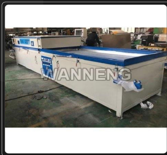
Membrane Vacuum Press Machine