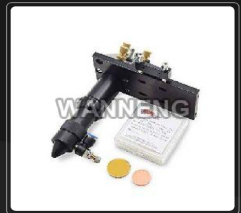
Laser Co2 Head