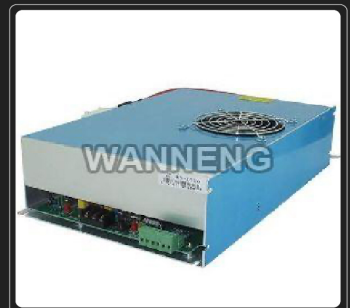
Laser Power Supply