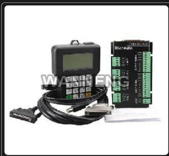
CNC DSP Controller