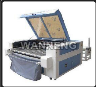
Autofeeding Laser Cutting & Engraving Machine