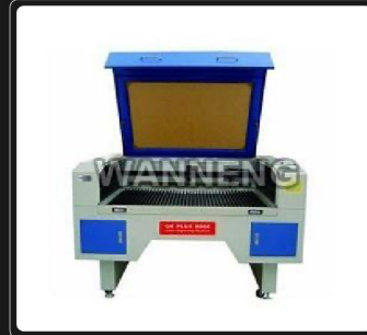
Automatic Laser Cutting Machine