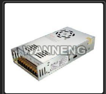
Laser Galvo SMPS