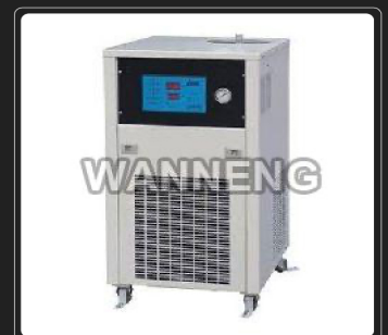
Industrial Laser Water Chiller