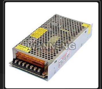
SMPS Laser Cutting Machine