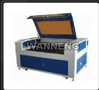
WTC9060 Laser Cutting & Engraving Machine