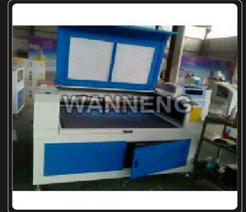
Dual Head Laser Cutting Machine