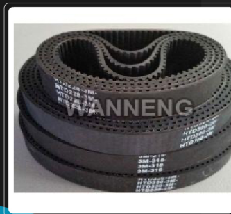
Laser Machine Belt