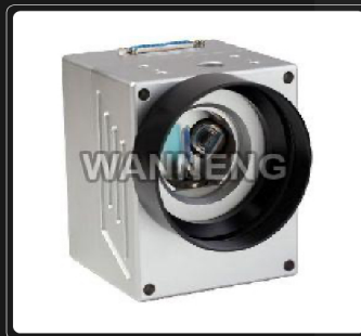
Laser Galvo Head