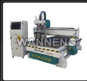
CNC Multi Spindle Router Machine