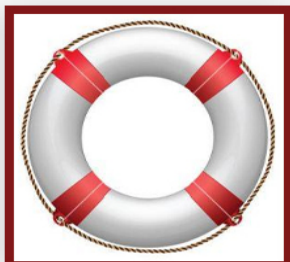
Life Buoy Ring