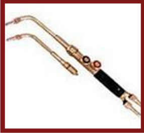
High Pressure Welding Torch