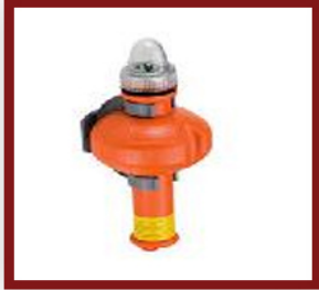
Man Overboard Light