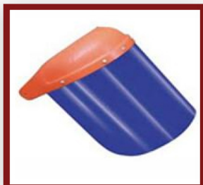
Face Protection Shield