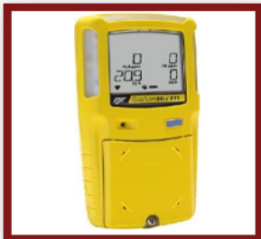
Multi Gas Detector