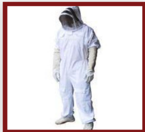
Honey Bee Suits