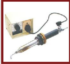
PVC Welding Torch