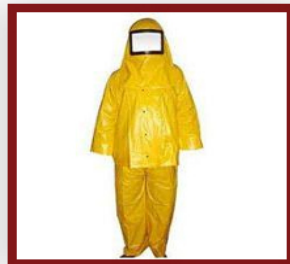
PVC Chemical Resistant Suits