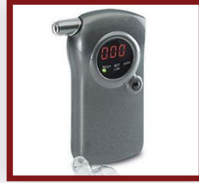
Alcohol Breath Detector