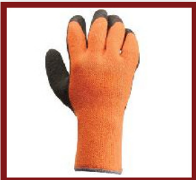
Cold Storage Gloves