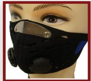
Half Face Mask