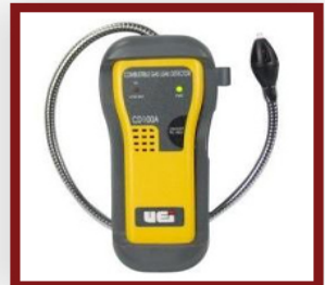
Gas Leak Detector