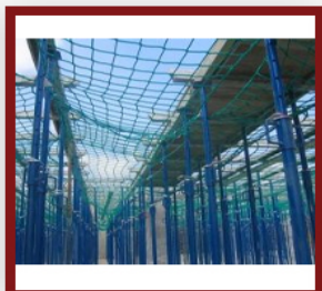
Construction Safety Net