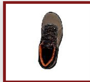
Electrical Safety Shoes