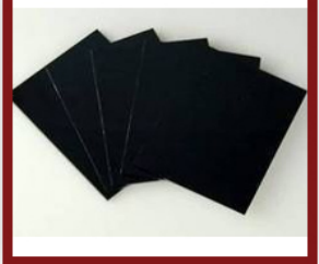
Welding Black Glass