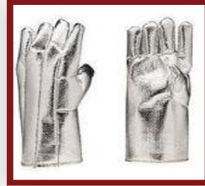
Aluminized Fire Fighting Gloves