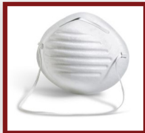
Dust Face Mask