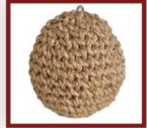
Round Coir Fender