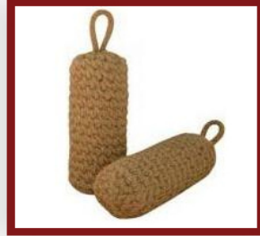
Long Coir Fender