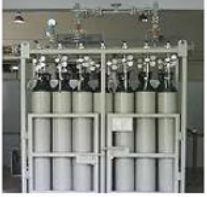
Nitrogen Gas Filling Manifold