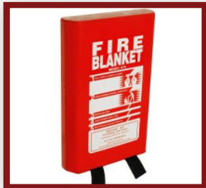
Fire Safety Blanket