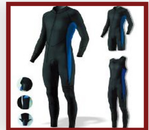
Scuba Diving Suits