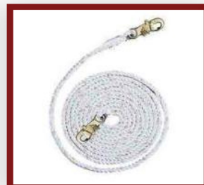
Life Line Rope