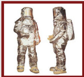
Fire Safety Suits