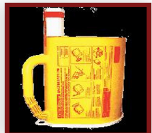
Line Throwing Apparatus