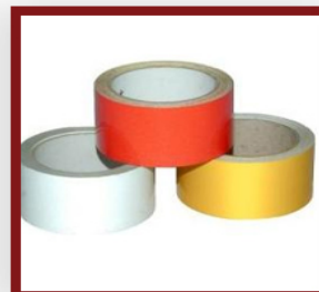
Floor Marking Reflective Tapes