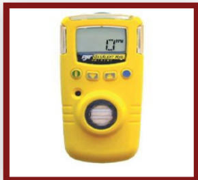
Single Gas Detector