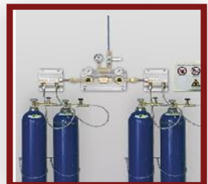
Oxygen Gas Filling Manifold