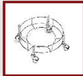
Stainless Steel Cylinder Trolley