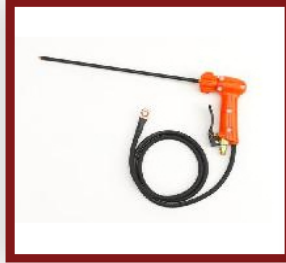
Underwater Cutting Torch