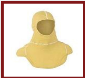
Fire Fighting Hood