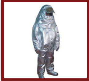
Aluminised Fire Fighting Suits