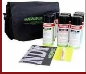
Dye Penetrant Testing Set