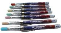
Temperature Indicating Sticks