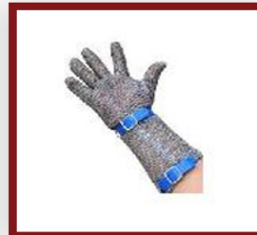
Metal Mesh Gloves