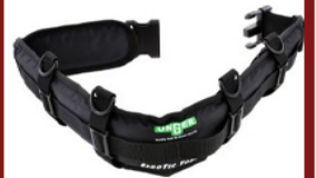
Window Cleaning Belt