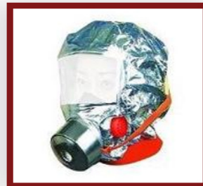
Fire Escape Mask