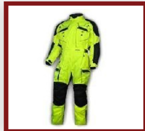
Cold Storage Suits