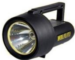
LED Rechargeable Hand Lamp