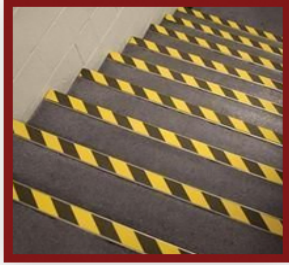
Anti Skid Tapes