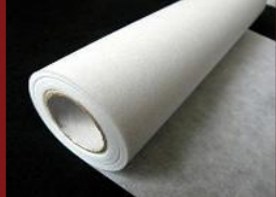
Water Soluble Paper