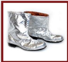
Aluminized Fire Fighting Shoes