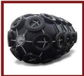
Rubber Pneumatic Fender