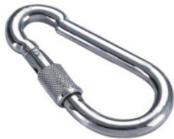
Safety Belt Hook