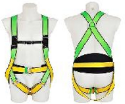
Half Body Safety Harness