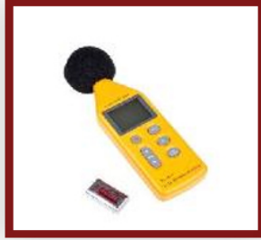
Digital Noise Level Meter