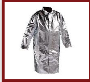
Aluminized Fire Fighting Coat