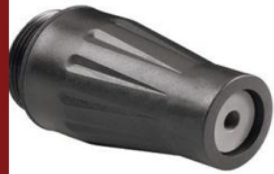
Sand Blasting Nozzle