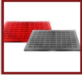
Electrical Rubber Mats