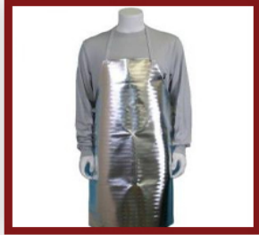
Aluminized Fire Fighting Apron