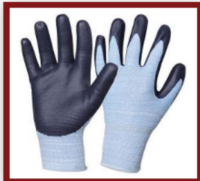
Cut Resistant Gloves