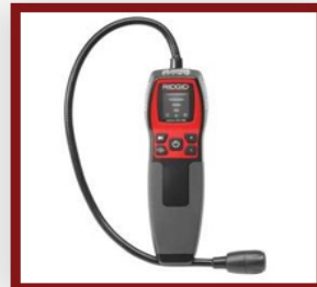
Combustible Gas Detector