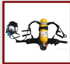
Self Contained Breathing Apparatus