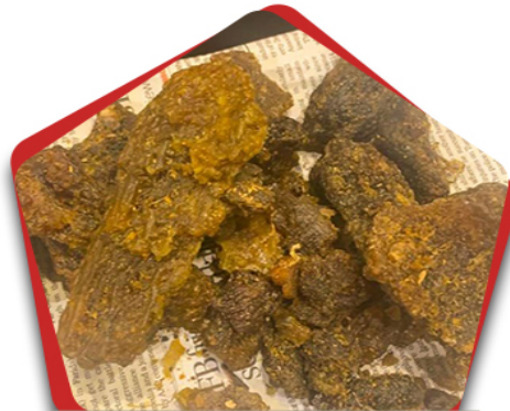
GUGGAL COMMIPHORA WIGHTII