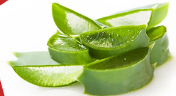
ALOE VERA EXTRACT