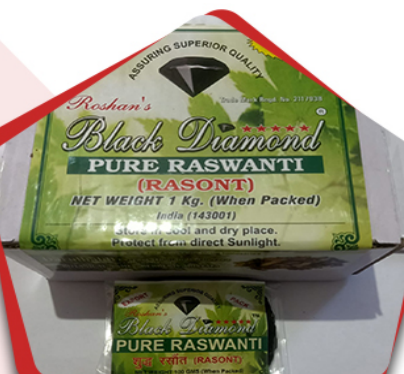
ROSHAN'S BLACK DIAMOND SHUDH RASONT