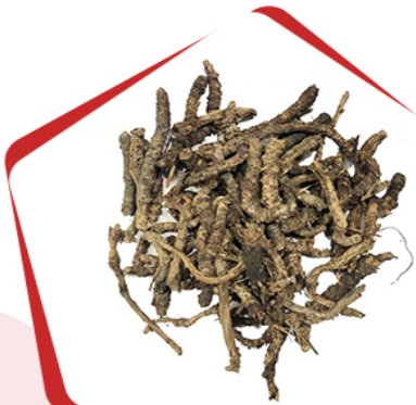
KUTKI PICRORHIZA KURROA