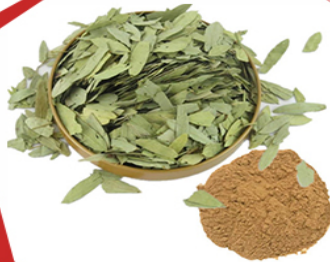
SENNAL LEAF EXTRACT