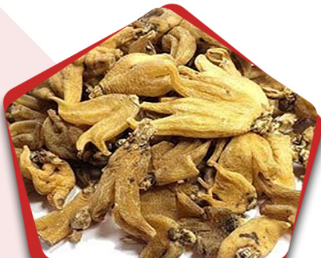
SALAM PANJA-DACTYLORHIZA HATAGIREA