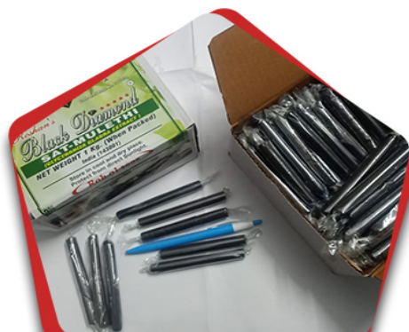
MULETHI SHEERA RAB-AL-SOOS