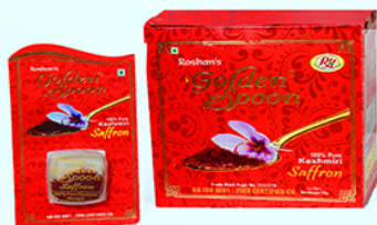
GOLDEN SPOON KASHMIRI SAFFRON(CROCUS SATIVUS)