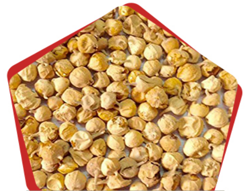
WITHANIA COAGULANS PANEER DODI SEED