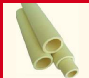
Nomex Seamless Belts, Roller Sleeves, Pads - Heat Resistance 280°C.