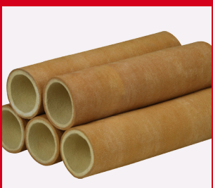
PBO Kevlar Seamless Belts, Roller Sleeves, Pads - Heat Resistance 600°C.