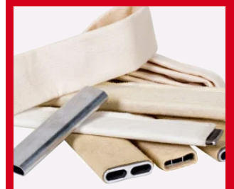
Spacer Sleeves Nomex - Heat Resistance 280°C.