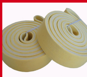
Kevlar Seamless Belts, Roller Sleeves, Pads - Heat Resistance 500°C.