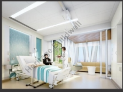
HOSPITAL INTERIOR DESIGNING SERVICE