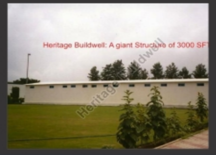
SANDWICH PANEL CABIN