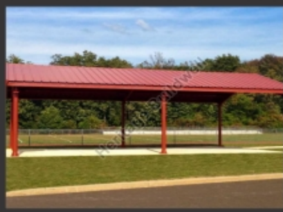
MS STRUCTURE FABRICATION SERVICE