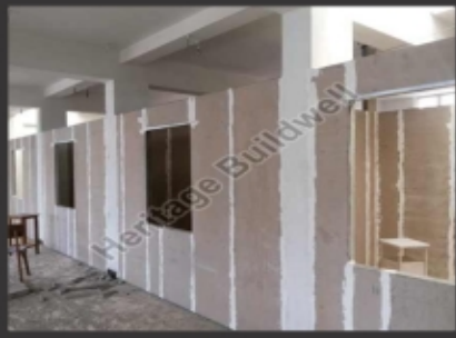
EVEREST SOLID WALL PANELS