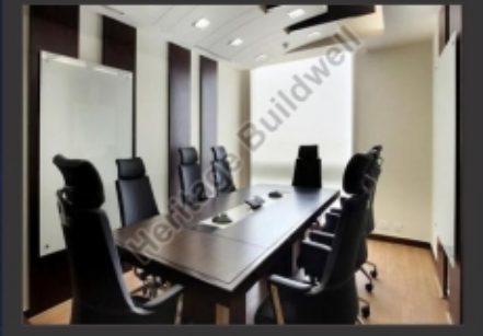
OFFICE INTERIOR DESIGNING SERVICE