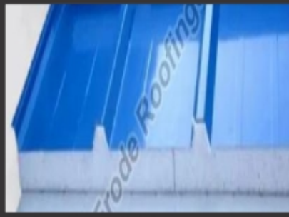
PLAIN PUF ROOFING SHEETS