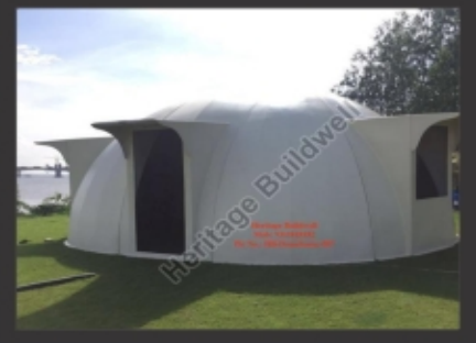
FRP DOME HOUSE