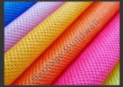
NON WOVEN FABRIC