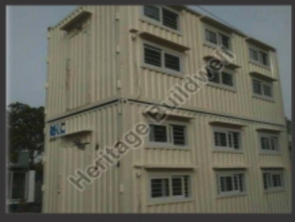
PORTABLE CONTAINER HOUSE