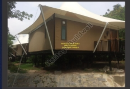
TENSILE FABRIC ROOF RESORT HUT