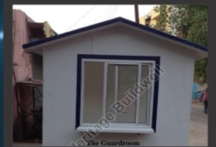
PORTABLE GUARD ROOM