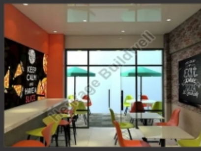
CAFE INTERIOR DESIGNING SERVICE