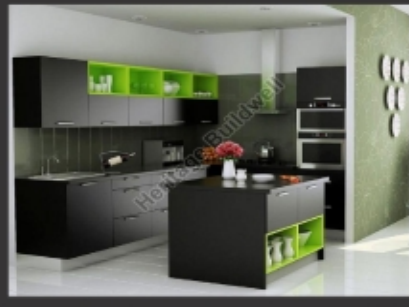
KITCHEN INTERIOR DESIGNING SERVICE