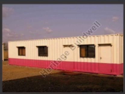
CONTAINER OFFICE CABIN