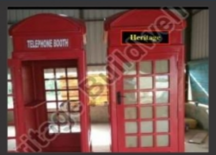
PORTABLE TELEPHONE BOOTH