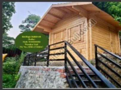
PORTABLE WOODEN COTTAGE