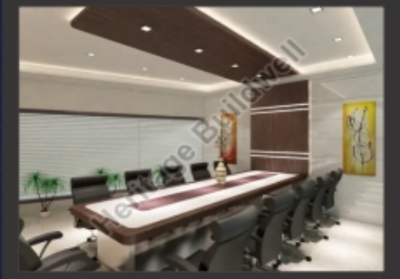
COMMERCIAL INTERIOR DESIGNING SERVICE