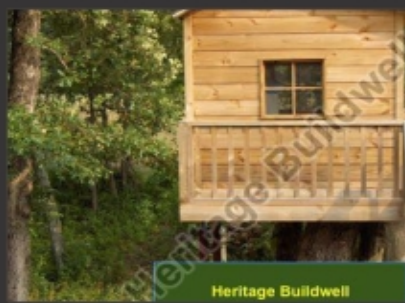
WOODEN TREE HOUSE