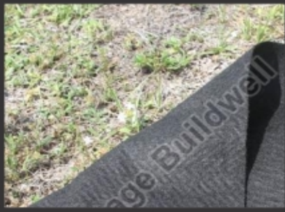
GEO FILTER FABRIC