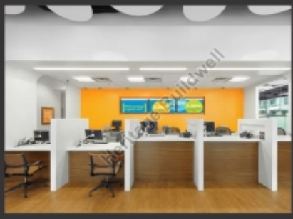
BANK INTERIOR DESIGNING SERVICE