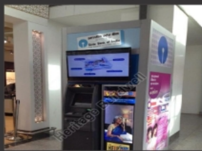
PORTABLE ATM CABIN