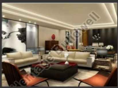
RESIDENTIAL INTERIOR DESIGNING SERVICE