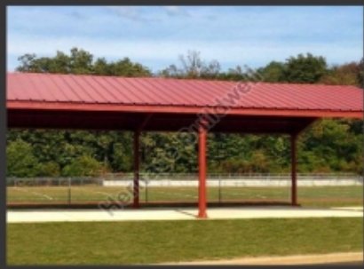
MILD STEEL STRUCTURE