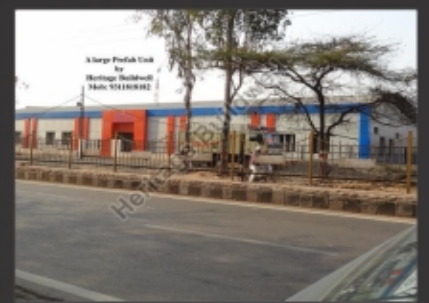
PRE ENGINEERED BUILDING