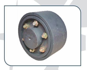
BRAKE DRUM COUPLING