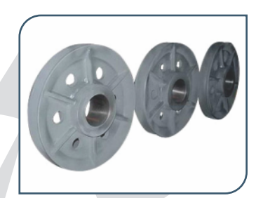
WIRE ROPE PULLEY