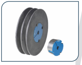
TAPPER LOCK PULLEY