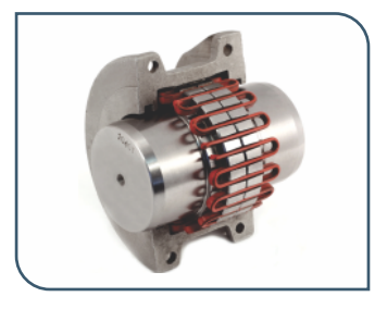
GRID SPRING COUPLING