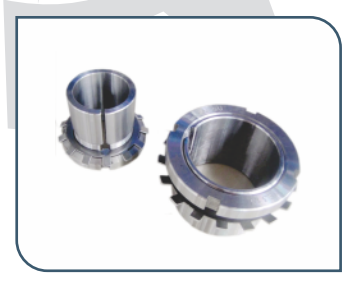
BEARING SLEEVES & LR