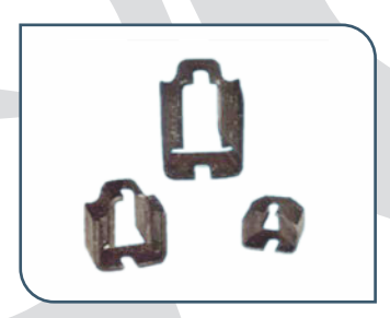
U SHEAR MOUNT