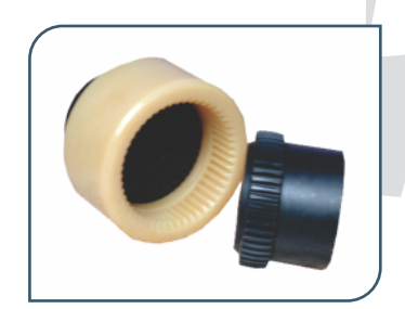
NYLON GEAR COUPLING