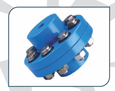
PIN BUSH COUPLING