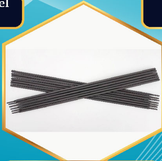
HF-100 Steel Welding Electrodes