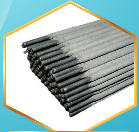
HF-104 Hardfacing Welding Electrodes