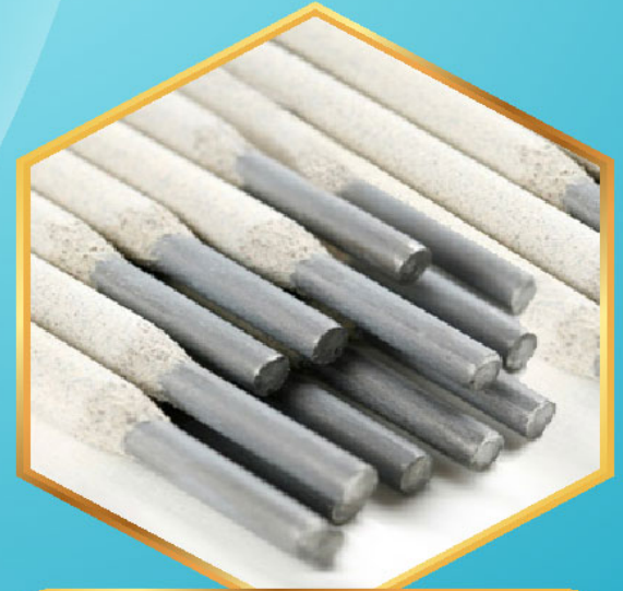
HF-110 Alloy Steel Welding Electrodes