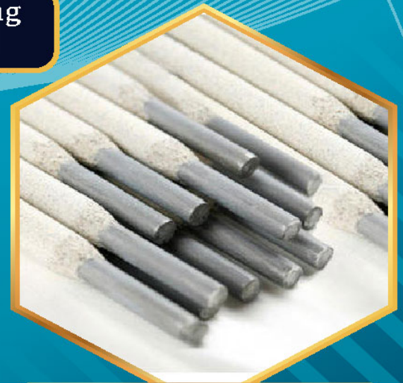
HF-105 Steel Welding Electrode