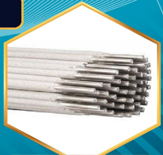
HF-108 Hardfacing Welding Electrodes