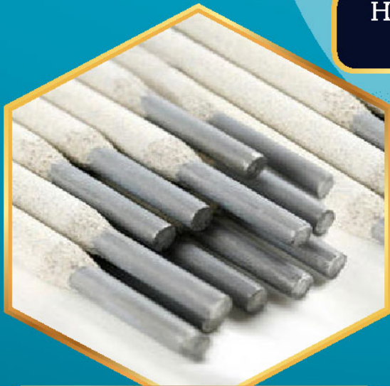
13SS Steel Welding Electrodes