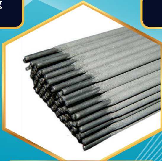
HF 550 Hardfacing Welding Electrodes