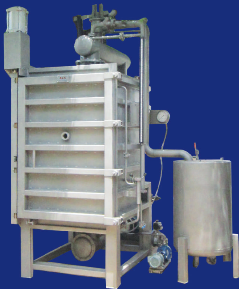
TUBRO TYPE - PRESSURE DYEING MACHINE FOR HANKS