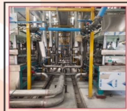
utility's pipe line