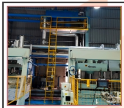
thimic food systems