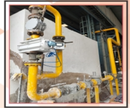
flow meter and gas train