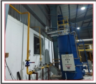
boiler and gas train