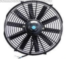
Engine Bay Ventilation Fan