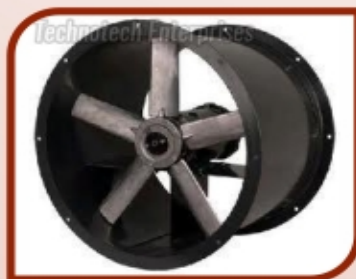
Ventilator Axial Fan