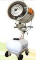
Industrial Mist Fan