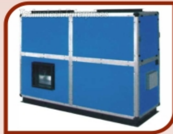
Commercial Energy Recovery Ventilation System