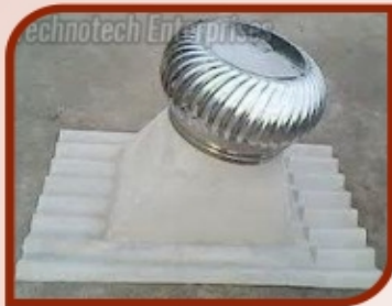
Energy Saver Ventilator