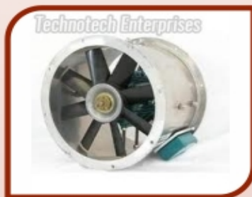
Wall Mounted Axial Fan