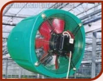
Industrial Jet Fans