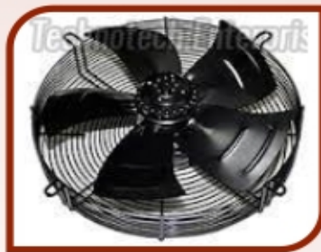
Condenser Cooling Fan