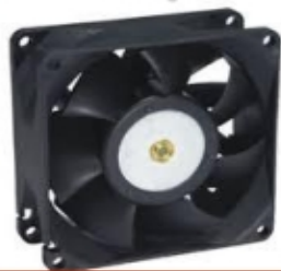
D.C Brushless Panel Cooling Fan