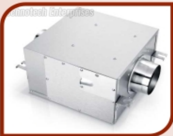
Acoustic Box Fan