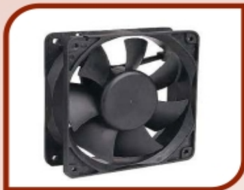
Telecommunication Cooling Fan