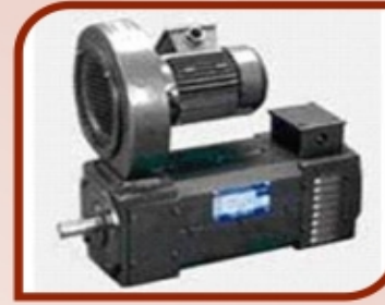
D.C Motor Cooling Blower