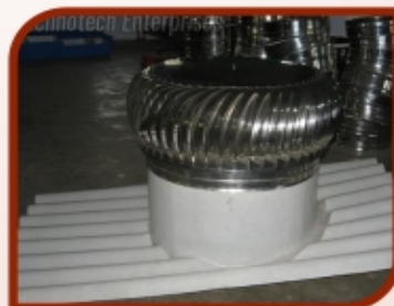
Wind Turbo Ventilator