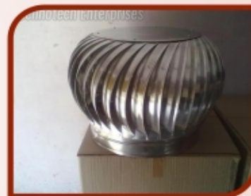
Turbo Air Ventilator