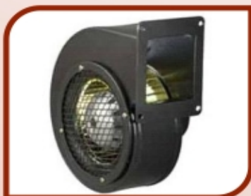
Single Inlet High Pressure Centrifugal Blower