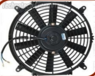
Engine Oil Cooling Fan