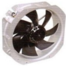
Plastic Panel Cooling Fan