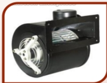
Double Inlet Ventilation Blower