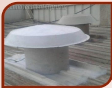
Mounted Roof Extractor