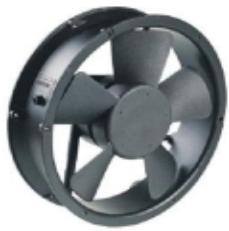
Compact Panel Cooling Fan