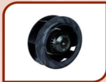
Backward Centrifugal Fan