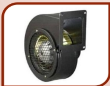
Single Inlet Exhaust Centrifugal Blower