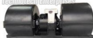
Auto Evaporator Blower