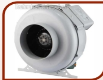
Circular Duct Fan