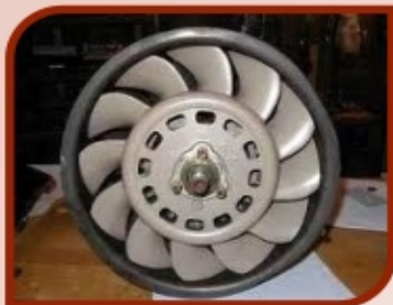
Telecommunication Axial Fan