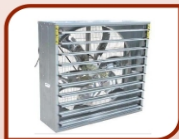
Poultry Ventilation Fan