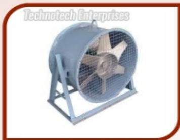
Axial Man Cooler Fan