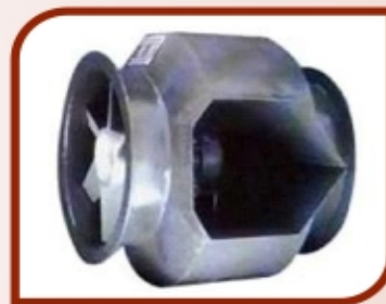
Bifurcated Axial Fan