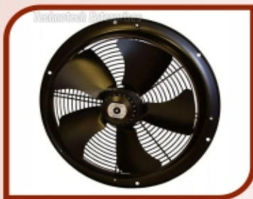
External Rotor Motor Cooling Fan