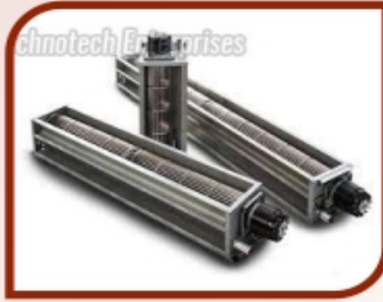
Tangential Flow Fan