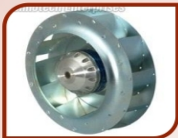
Radial Centrifugal Fan