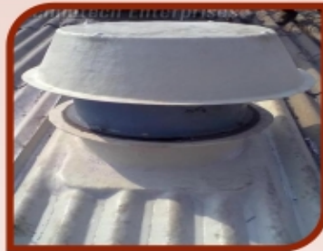
Electrical Roof Extractor