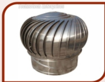
Wind Driven Ventilator