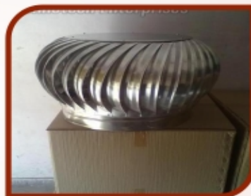
Turbine Air Ventilator