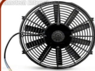
Auto Condenser Cooling Fan