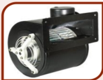
Double Inlet Low Pressure Blower