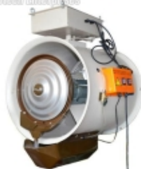
Wall Mist Fan