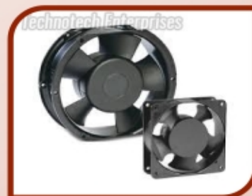
A.C Panel Cooling Fan