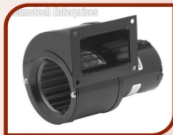
Double Inlet Exhaust Blower