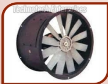
Tunnel Ventilation Axial Fan