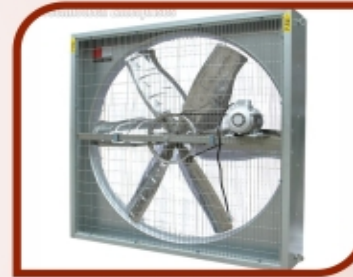
Cow House Fan