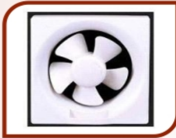
Compact Fresh Air Fan