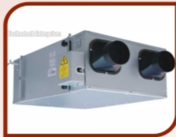
Home Energy Recovery Ventilation System