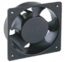
Metal Square Panel Cooling Fan