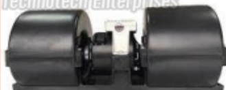
Twin Centrifugal Bus Blower