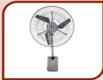
Wall Air Circulator