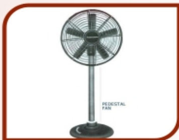
Wall Bracket Man Cooler Fan