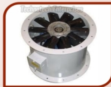
Roof Mounted Axial Fan