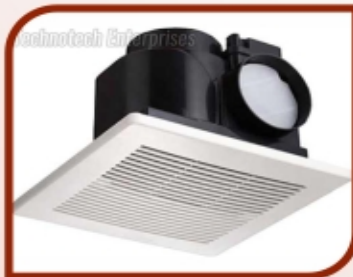
Ceiling Mounted Duct Fan