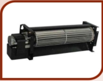
Cross Flow Fan