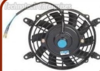
Auto Engine Cooling Fan