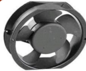
Instrument Panel Cooling Fan