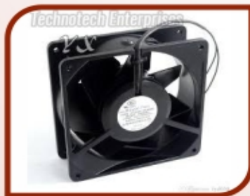
High Temperature Axial Fan