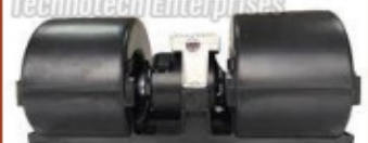
Auto HVAC Blower