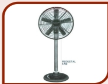
Pedestal Man Cooler Fan