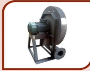
Industrial Centrifugal Blower