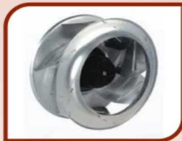
Telecommunication Curved Fan