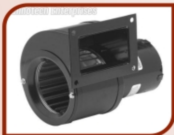
Double Inlet High Pressure Blower