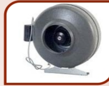
In line Duct Fan