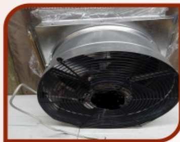
Heavy Duty Cooling Fan