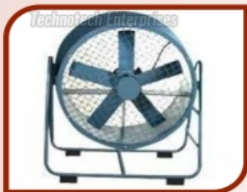
Ventilation Man Cooler Fan