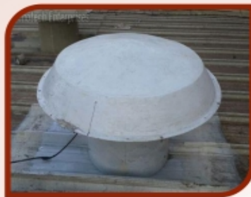
Ventilation Roof Extractor