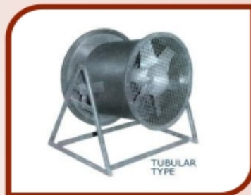
Tubular Type Man Cooler Fan