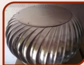
Wind Vent Ventilator