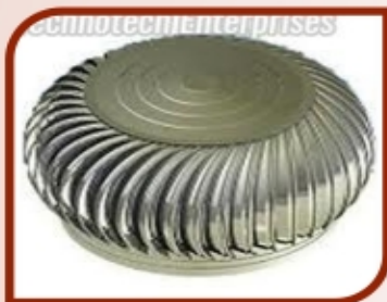
Powerless Turbine Ventilator