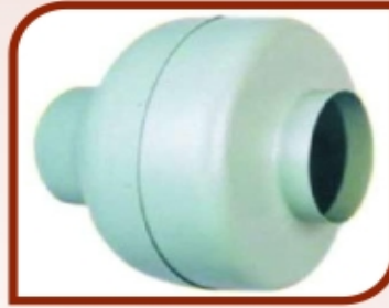
Air Duct Fan