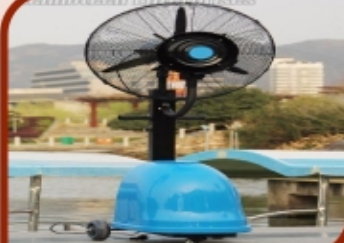
Pedestal Mist Fan