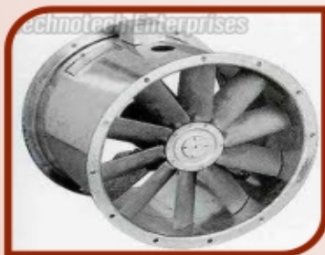
FRP Axial Fan