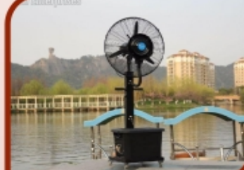
Outdoor Mist Fan