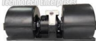
Auto Cooling Blower