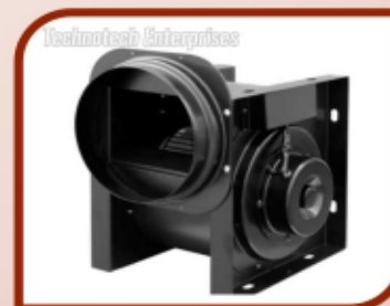
Kitchen Ventilation Fan