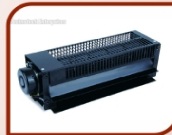
Elevator Blower Fan