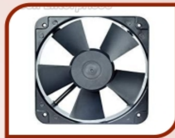
Exhaust Cooling Fan