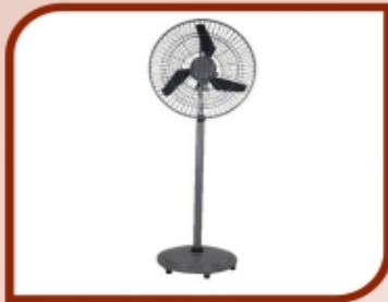
Pedestal Air Circulator