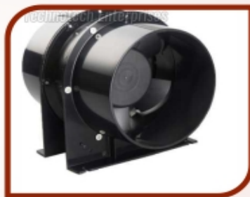
Axial Duct Fan