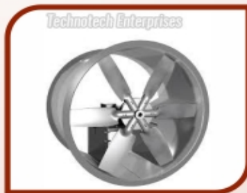
Propeller Axial Fan