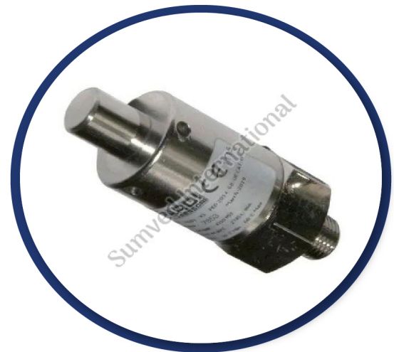
Nardi High Pressure Safety Valve