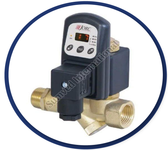
JORC COMBO-D-LUX Digital Timer Drain With Integrated Strainer