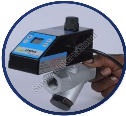
Lenora Digital Automatic Drain Valve