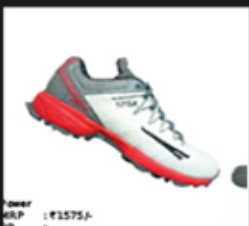
Power (Cricket) Sports Shoes