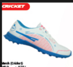
March (Cricket) Sports Shoes