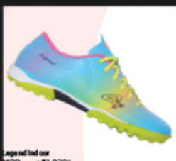
Legend Indoor (Cricket) Sports Shoes