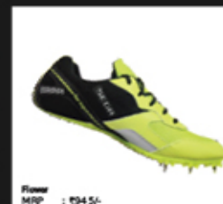
Flower Athletic Sports Shoes