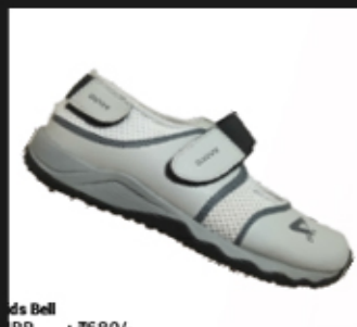
ed's Bell MRP : ₹680/-