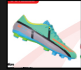
Micro Football Shoes