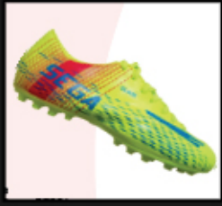
Glaze Football Shoes