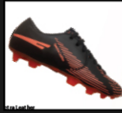
Spectra Leather Football Shoes