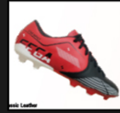
Classic Leather Football Shoes