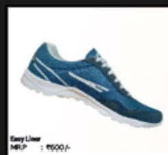
Easy Liner multipur- pose jogging Shoes