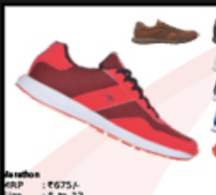
Marathon jogging Shoes