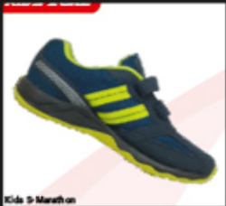
Kids S-Marathon jogging Shoes