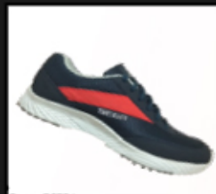
Eco jogging Shoes