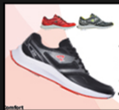
Comfort multipur- pose jogging Shoes