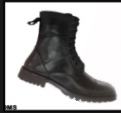
SEGA DMS Leather Shoes