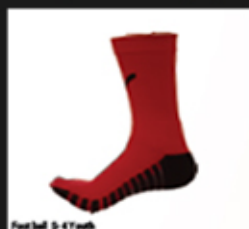
Football S-4 Youth Socks