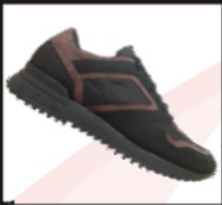
Concept jogging Shoes