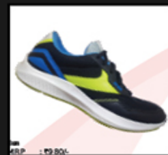
Run multipurpose jogging Shoes