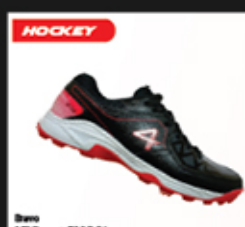
Bravo hockey Sports Shoes