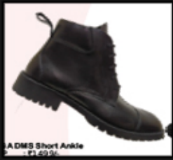
SEGA DMS Short Ankle Leather Shoes