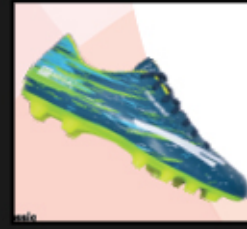
Classic Football Shoes