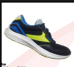
Run jogging Shoes