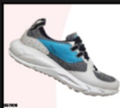
Bounce jogging Shoes