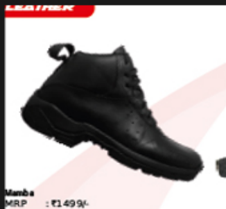
Mamba MRP : ₹1499/-