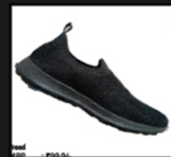
Freed multipurpose jogging Shoes