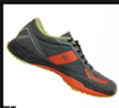
Oxygen jogging Shoes