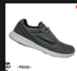
Edge multipurpose jogging Shoes