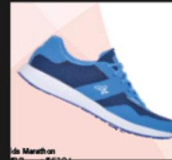
Kids Marathon jogging Shoes