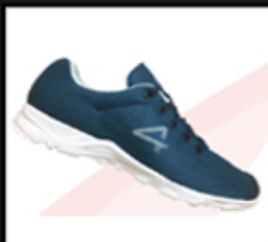
Mesh Liner jogging Shoes