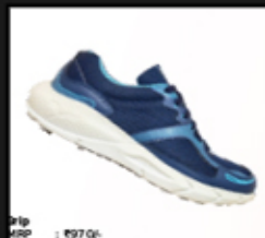
Grip jogging Shoes