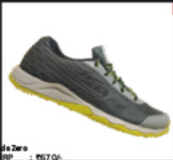
Kids Zero jogging Shoes