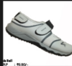
Kids Bell jogging Shoes