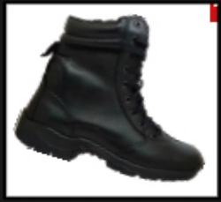
M-21 Liner Leather Shoes