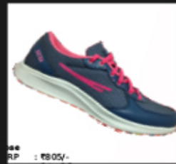
Rose jogging Shoes