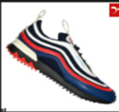
Segment jogging Shoes