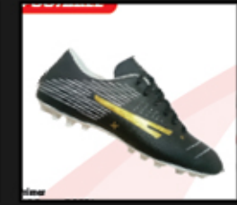
Primer Football Shoes