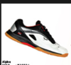
Alpine Athletic Sports Shoes