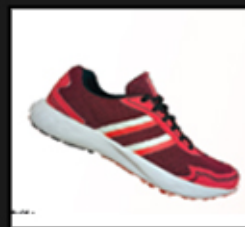
Guide multipurpose jogging Shoes