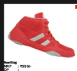
New Ring wrestling Shoes