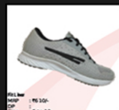
Fit Liner multipur- pose jogging Shoes