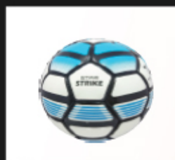
Star Strike footballs