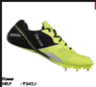
Flower MRP : ₹945/-