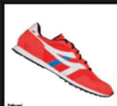
Takumi jogging Shoes