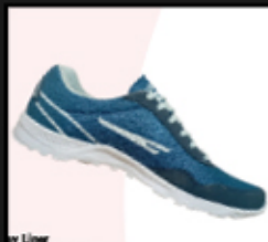
Easy Liner jogging Shoes