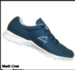
Kids Mesh Liner jogging Shoes