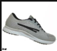
Fit Liner jogging Shoes