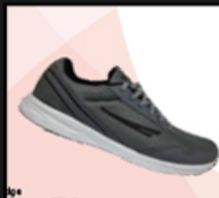
Edge jogging Shoes