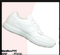
Marathon PVC multi- purpose jogging