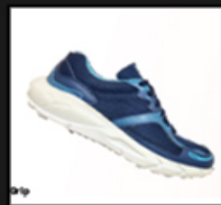
Grip multipurpose jog- ging Shoes