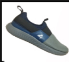
Rax jogging Shoes