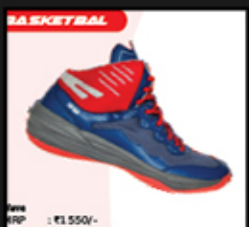
Wave basketball Shoes