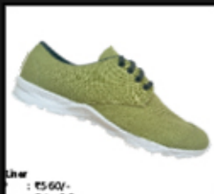
sh MRP : ₹560/-