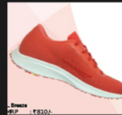
L. Breeze jogging Shoes