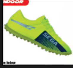
Glaze Indoor Football Shoes