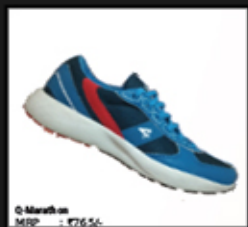
Q-Marathon multi- purpose jogging