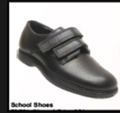
School Leather Shoes