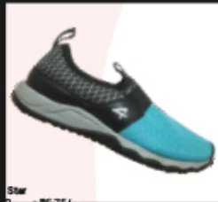
Kids Star jogging Shoes