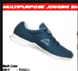
Mesh Liner multipur- pose jogging Shoes