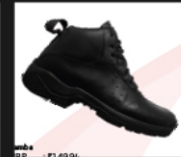
Mamba Leather Shoes