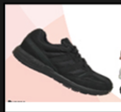
Runner multipurpose jogging Shoes