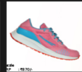
Puzzle jogging Shoes