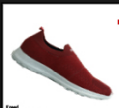
Freed jogging Shoes