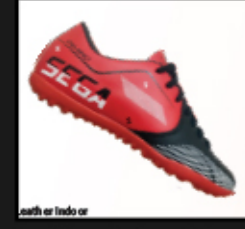
Classic Leather Indoor Football Shoes