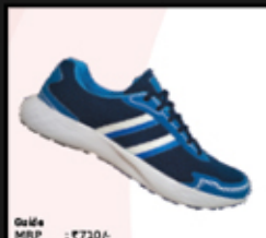
Guide MRP : ₹720/-