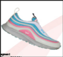
L. Segment jogging Shoes