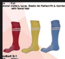
Football S-1 Socks