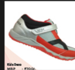
Kids Deco jogging Shoes