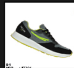
S-1 multipurpose jogging Shoes