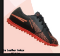
Spectra Leather Indoor Football Shoes