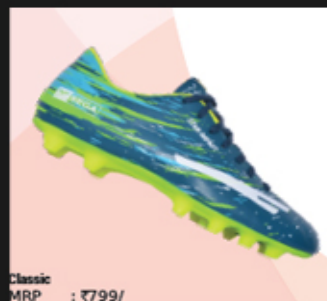
Classic MRP : ₹799/-