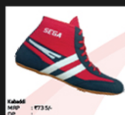
Kabaddi Sports Shoes