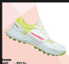
Booster (Cricket) Sports Shoes