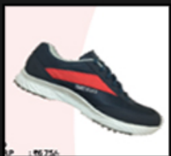
Eco multipurpose jogging Shoes