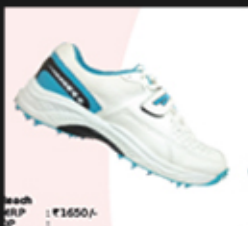
Reach (Cricket) Sports Shoes