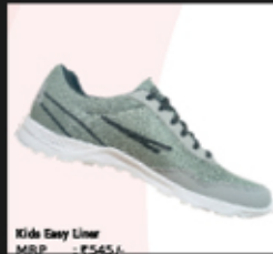
Kids Easy Liner jogging Shoes