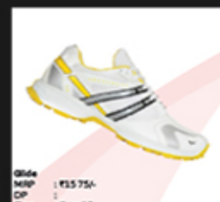
Glide (Cricket) Sports Shoes