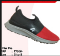
L. Flex Pro jogging Shoes