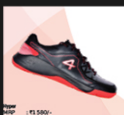
Hyper Athletic Sports Shoes