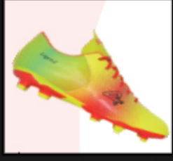
Legend Football Shoes