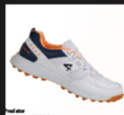
Predator (Cricket) Sports Shoes