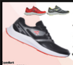
Comfort jogging Shoes