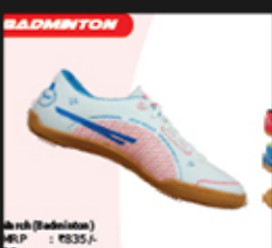
March (Badminton) Athletic Shoes