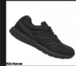
Kids Runner jogging Shoes