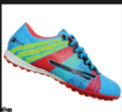
Pullup (Cricket) Sports Shoes