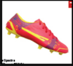
New Spectra Football Shoes