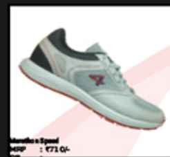
Marathon Speed multipurpose jogging