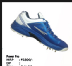
Power Pro (Cricket) Sports Shoes