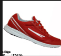
Kids Edge jogging Shoes