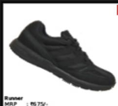
Runner MRP : ₹675/-