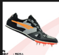
Fly Athletic Sports Shoes