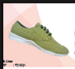
Club Liner multipur- pose jogging Shoes