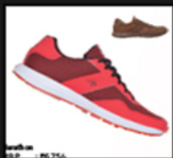
Marathon multipur- pose jogging Shoes