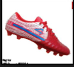
Raptor Football Shoes