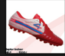
Raptor Indoor Football Shoes