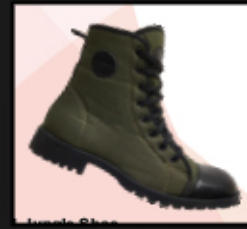
R-1 Jungle Shoe Leather Shoes