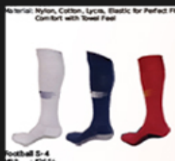
Football S-4 Socks