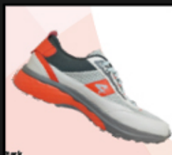
Stark jogging Shoes