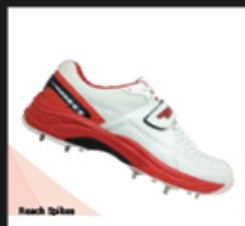
Reach Spikes (Cricket) Sports