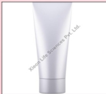
ADAPALENE CLINDAMYCIN CREAM