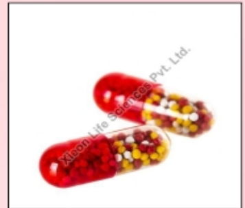
RABEPRAZOLE SODIUM 20MG