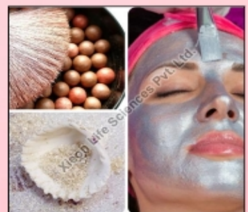
PEARL FACIAL KIT