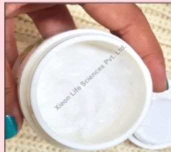
WHITENING & BRIGHTENING CREAM