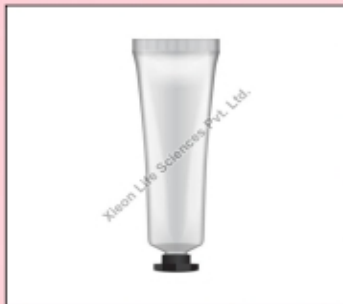
1% TERBINAFINE HCL CREAM