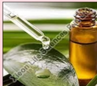
ANTI DANDRUFF HAIR OIL