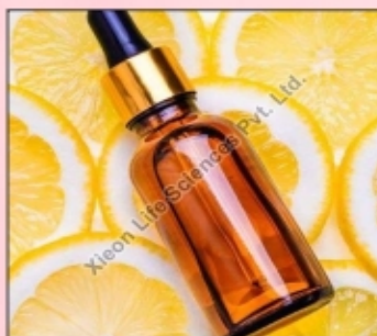
VITAMIN C SERUM