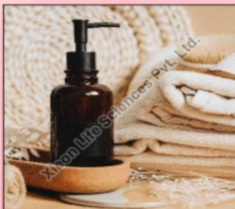
ANTI LICE SHAMPOO