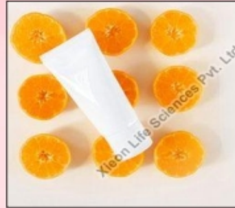
ORANGE FACE WASH