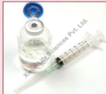
PIPERACILLIN & TAZOBACTAM INJECTION