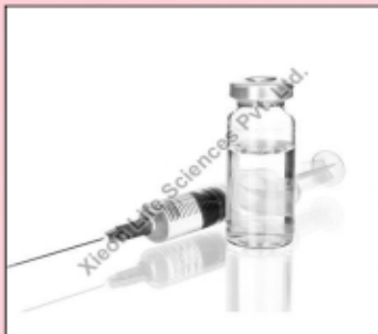
AMOXYCILLIN & SULBACTAM INJECTION