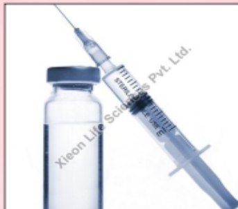
TAZOBACTAM SODIUM INJECTION