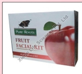
FRUIT FACIAL KIT