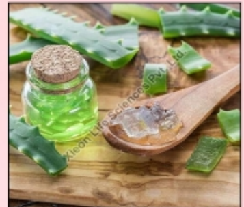
ALOE VERA FACE WASH