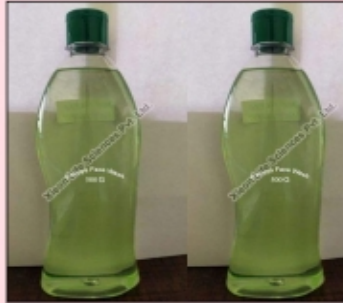
PAPAYA FACE WASH