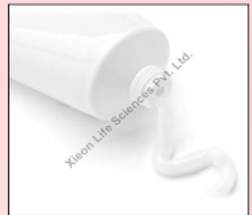
SERTAONAZOLE NITRATE 2% CREAM