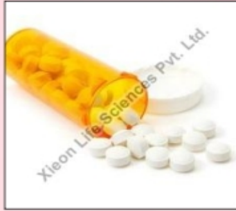
OFLOXACIN 200MG TABLETS