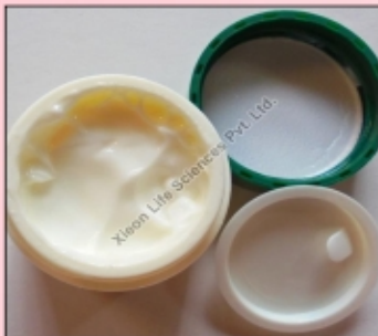
ANTI ACNE CREAM