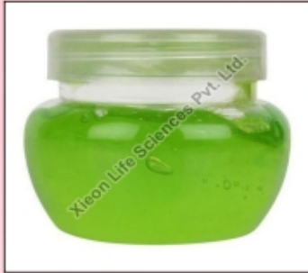
NEEM FACE WASH