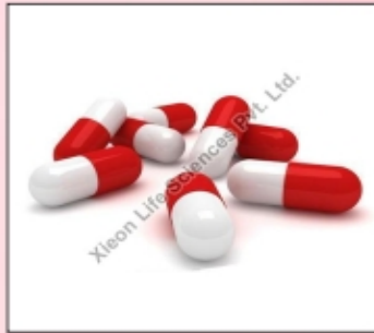
RABEPRAZOLE SODIUM 20MG