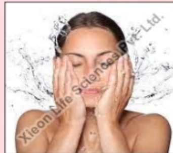
GLYCOLIC ACID & ALOE VERA FACE WASH