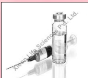
MEROPENEM & SULBACTAM 1.5GM INJECTION