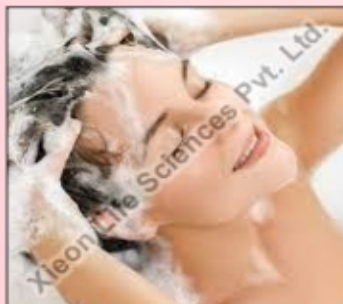
AMLA & ALOE VERA MOISTURIZING SHAMPOO