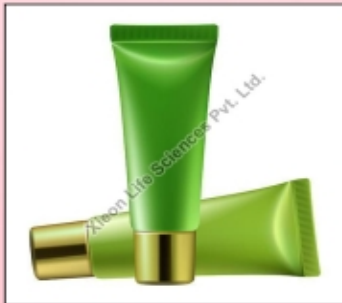
NEEM & HONEY FACE WASH