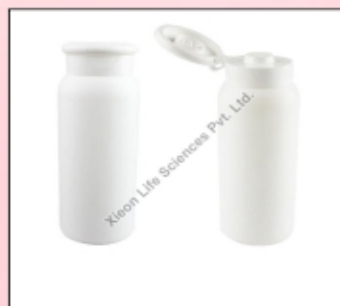
LULICONAZOLE 1% POWDER