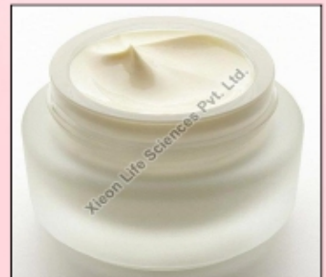
ANTI AGEING CREAM