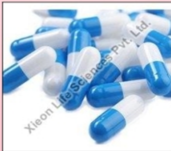
PANTOPRAZOLE SODIUM 40MG