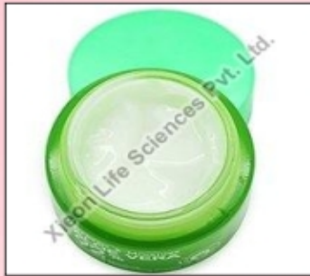
ALOE VERA CREAM