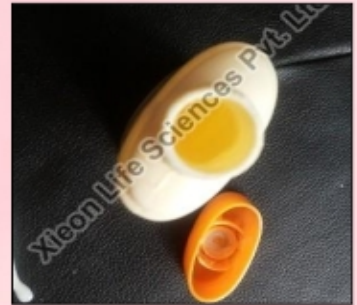
ALMOND NOURISHING BODY LOTION