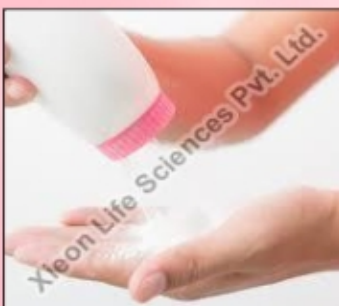
CLOTRIMAZOLE DUSTING POWDER