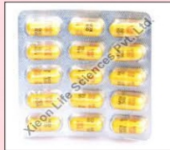
AMOXYCILLIN TRIHYDRATE CAPSULES