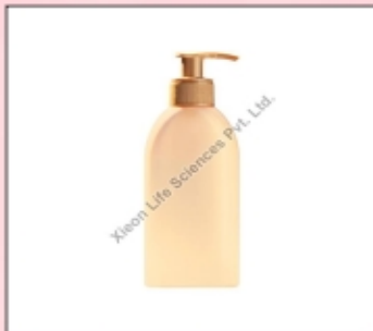
LULICONAZOLE 1% CREAM