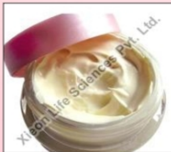
ULTRA WHITENING FAIRNESS LOTION WITH VITAMIN E