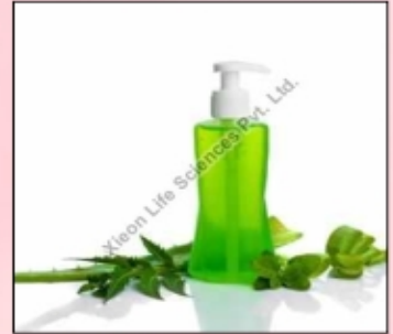
NEEM TULSI FACE WASH