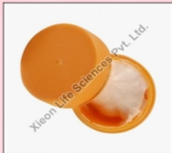
D PIGMENTATION CREAM