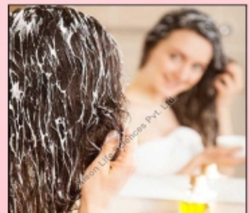
HAIR SPA CREAM