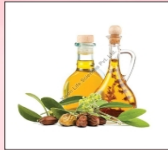
EXTRA SOFT SHOWER GEL