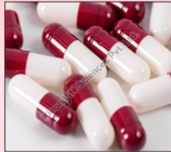
RABEPRAZOLE SODIUM 20MG