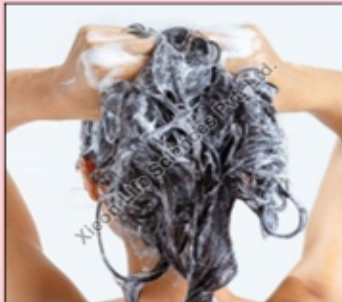
ANTI DANDRUFF SHAMPOO