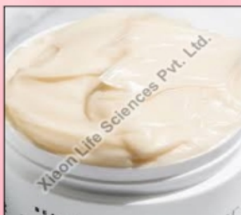
ANTI STRETCH MARKS CREAM