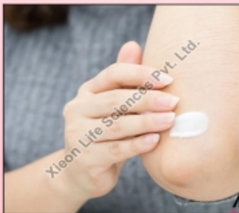
MIX FRUIT BODY LOTION