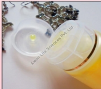
HALDI CHANDAN FACE WASH