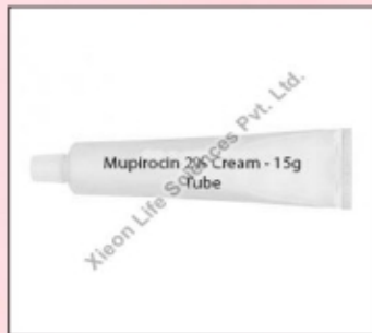
MUPIROCIN 2% W/W CREAM