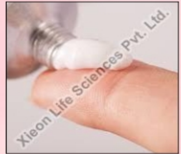
CLOTRIMAZOLE 1% BECLOMETHASONE CREAM