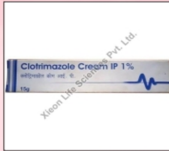
CLOTRIMAZOLE 1% CREAM