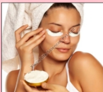
UNDER EYE CREAM