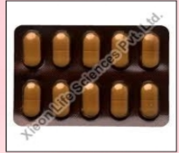
PRIMAQUINE PHOSPHATE TABLETS