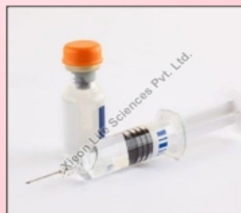
AMPICILLIN & CLOXACILLIN INJECTION