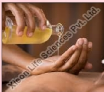
BODY MASSAGE OIL