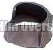
Casted Top Cup Scaffolding