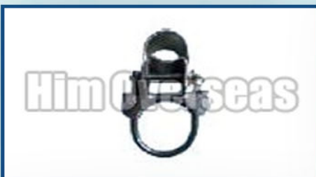
Chain Link Fence Hinges