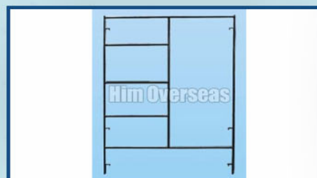
Scaffolding Frame System