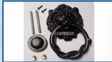
Black Iron Ring Latch