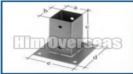
Square Ground Pole Plates