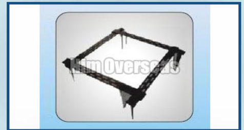
Scaffolding Column Clamps