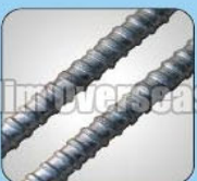
Steel Tie Rods