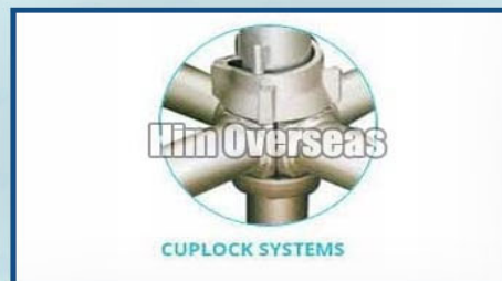
Cuplock Scaffolding System