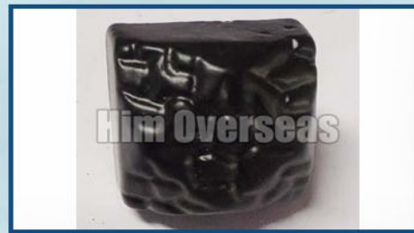
Black Iron Door Stud