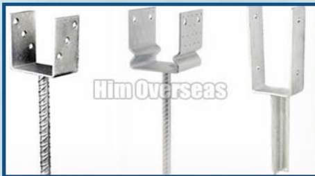
U Post Support With Rod