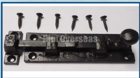
Black Iron Door Tower Bolt