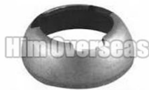
Bottom Cup (Pressed Steel)