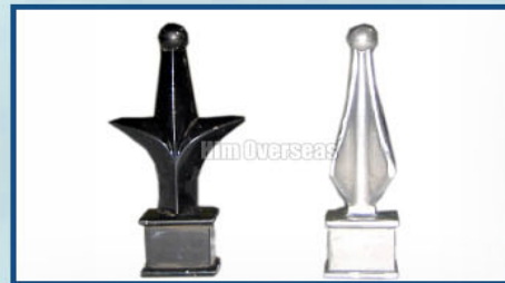
Fence Metal Ornamental Fittings