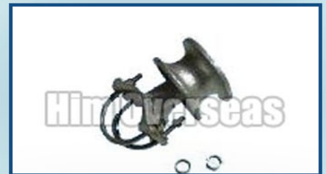
Fence Gate Rollers