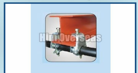
Scaffolding Drop Forged Girder Couple