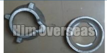
Forged Top Cup Scaffolding