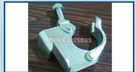
Scaffolding Drop Forged Board Retaining Coupler