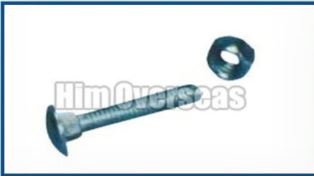
Fence Hardware Fittings