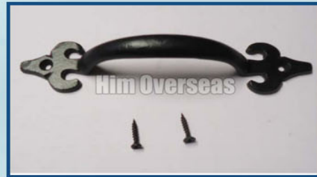
Black Iron FDL Door Handle