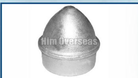
Fence Post Fittings