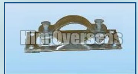
Wooden Post Adaptor