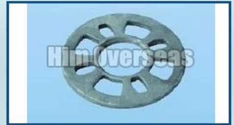
Scaffolding Ring Lock System