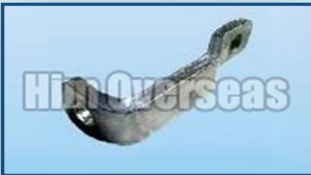
Truss Rod Tightener