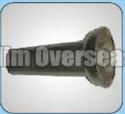
Steel Cone Nut