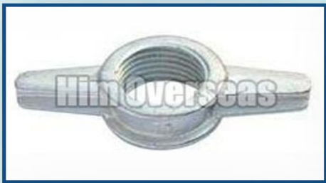
Forged Jack Nuts