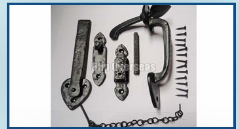
Black Iron Thumb Latch