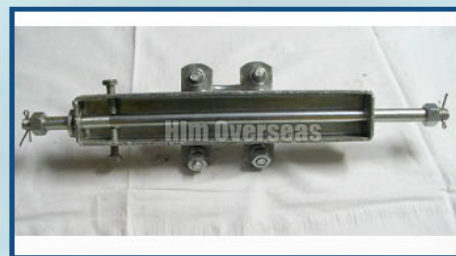
Fence Wheel Carriers