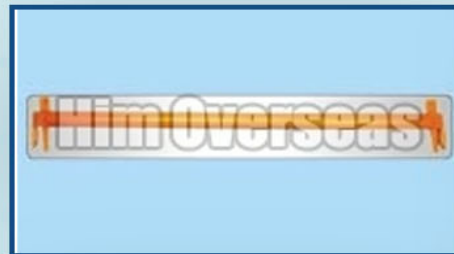
Quick Lock Scaffolding System