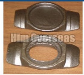
Drop Forged Ledger Blade