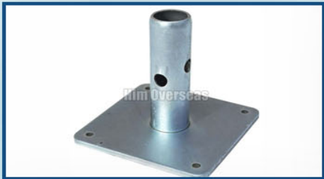
Casted Jack Nut