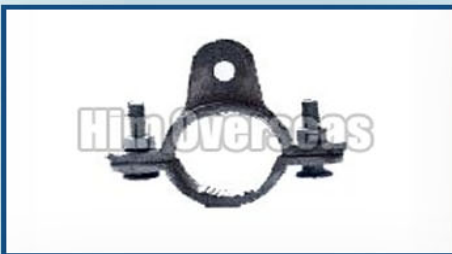
Chain Link Fence Latches