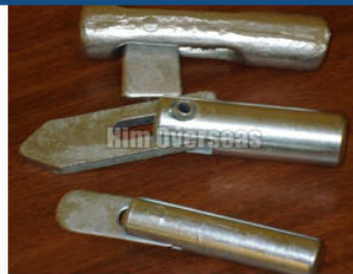
Brace Lock or Flip Lock Pin