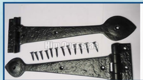
Black Iron Hinges