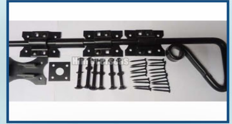
Black Iron Latch Bolt