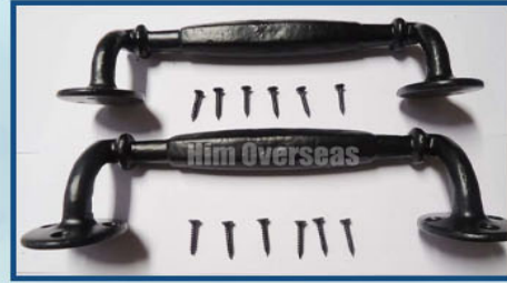
Black Iron Door Handle Set