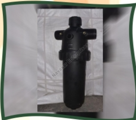
2.5 Inch Drip Irrigation Screen Filter