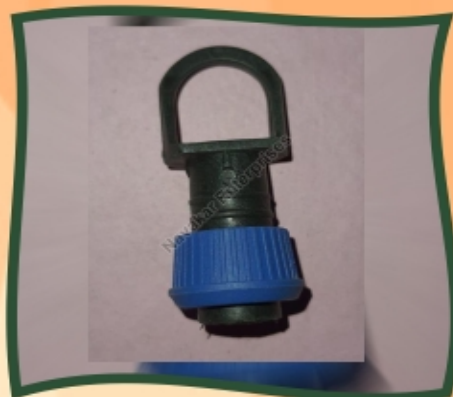
Drip Irrigation Pepsi End Cap