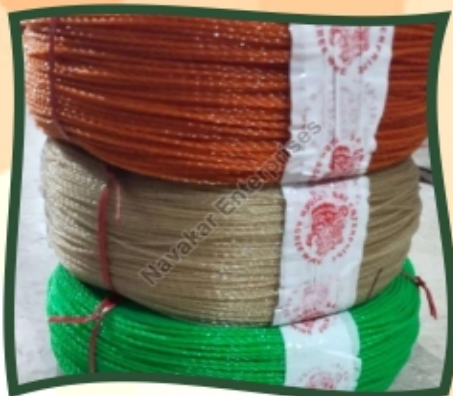
9 Tar Pet Wire