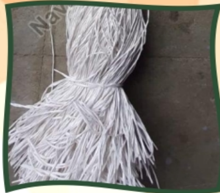
Virgin Plastic Sutli