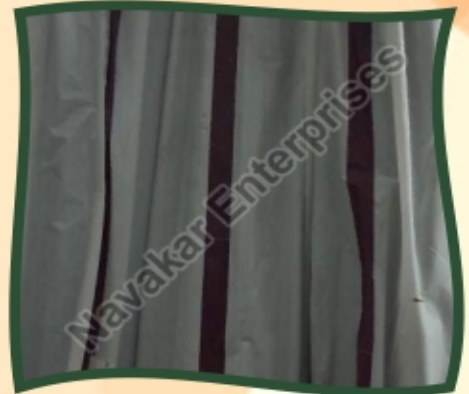
Economy Quality Mulching Film