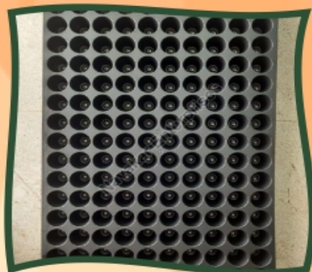
Round 150 Cavity Seedling Tray