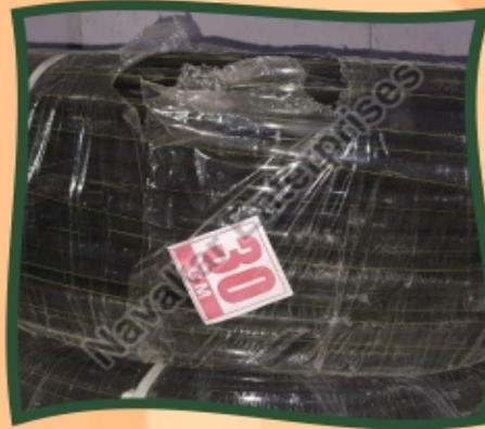
9 Kg Hydro Cool Drip Irrigation Pipe