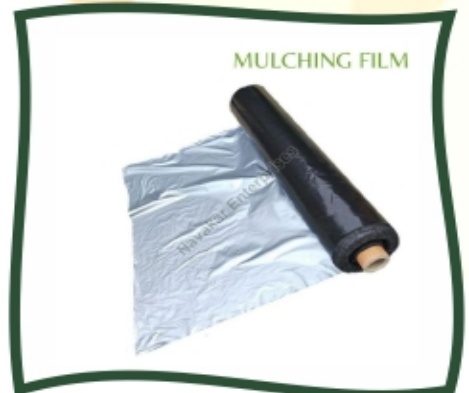
Silver Black Mulching Film