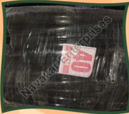
12 Kg Hydro Cool Drip Irrigation Pipe