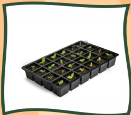
24 Cavity Seedling Tray