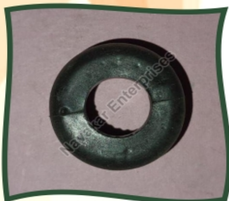
Jain Type Drip Irrigation Grommet