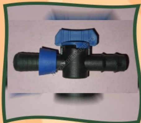
Drip Irrigation Pepsi Cock