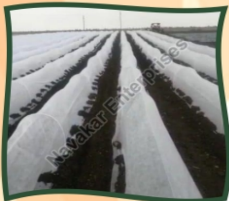
8 Feet Crop Cover