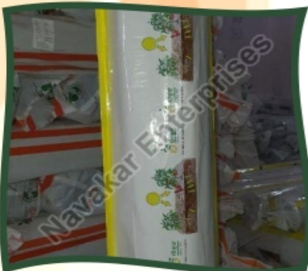
Gokul Mulching Film