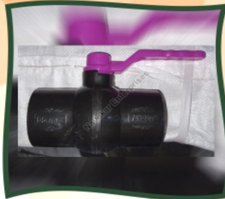
2.5 Inch PVC Long Handle Irrigation Ball Valve