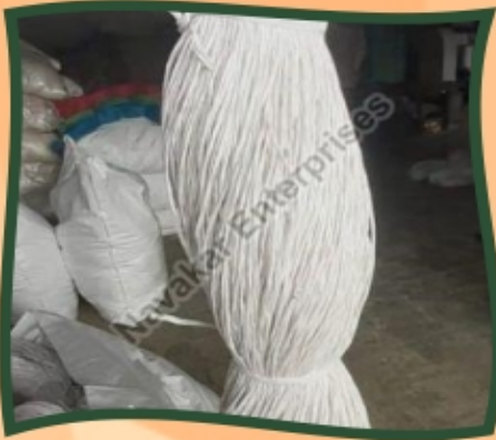
Milky Cutting Plastic Sutli