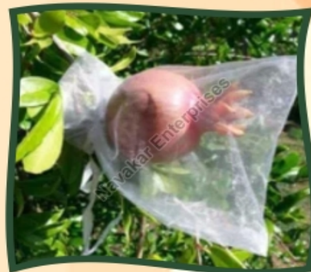
Pomegranate Fruit Cover