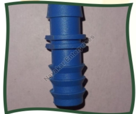
Neta Drip Line Take Off Fitting