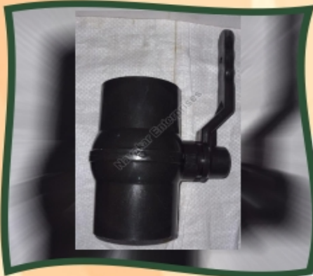
2 Inch PVC Long Handle Irrigation Ball Valve