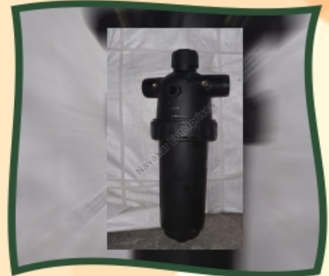
2 Inch Drip Irrigation Screen Filter