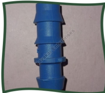
Jain Drip Line Take Off Fitting