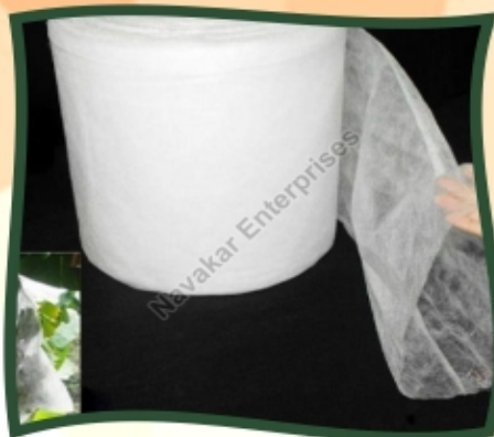
Banana Fruit Cover