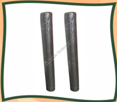
Watermelon and Muskmelon Mulching Film