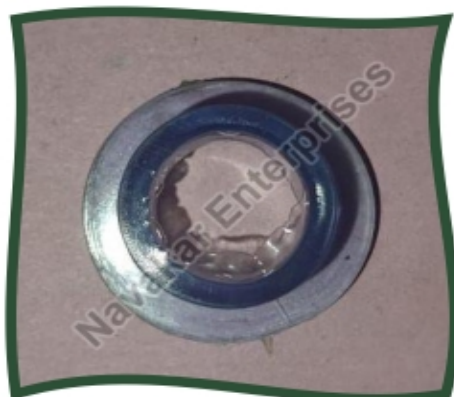
Neta Type Drip Irrigation Grommet