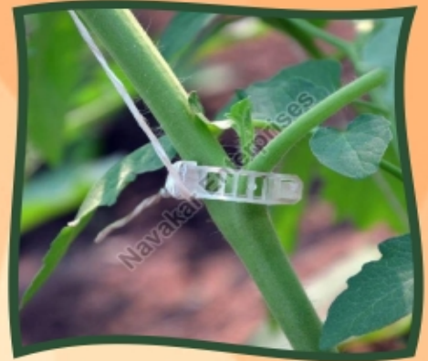
Plant Support Clips