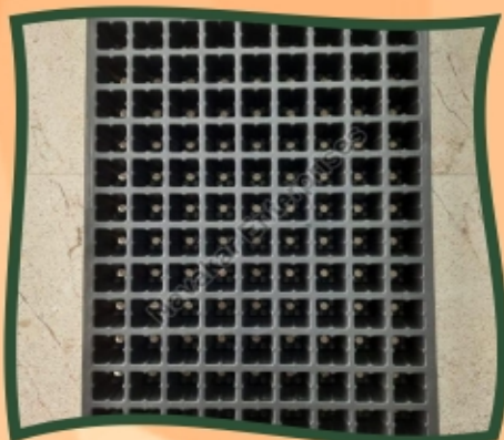
126 Cavity Seedling Tray