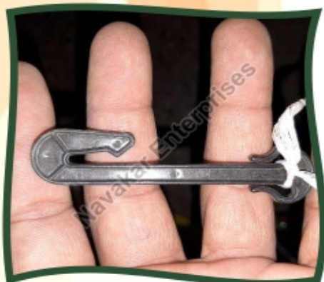
Crop Support J Hook