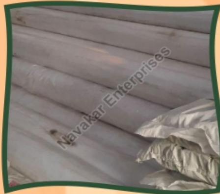
10.5 Feet Crop Cover