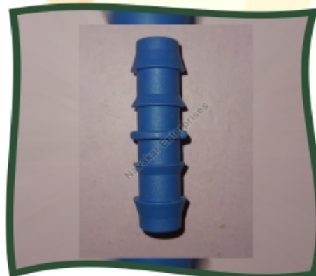
Drip Irrigation Joiner