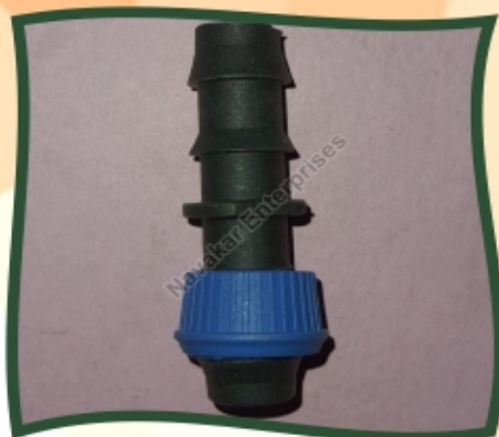
Drip Irrigation Pepsi Take Up Fitting