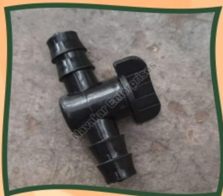
Drip Irrigation Lateral Cock