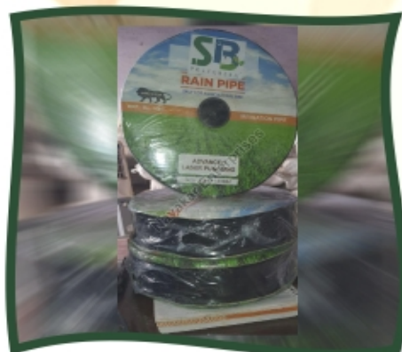
SB Polygreen Agriculture Rain Pipe