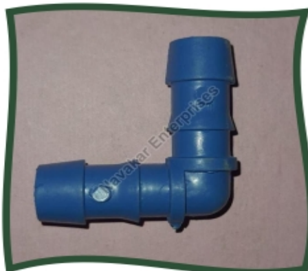
Drip Irrigation Elbow