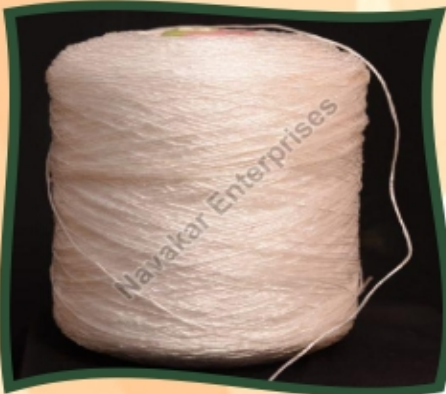
Plant Supporting Synthetic Twine