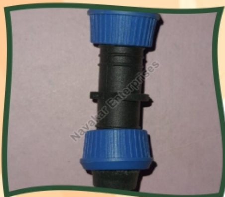
Drip Irrigation Pepsi Joiner