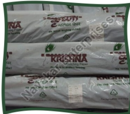
Krishna Mulching Film