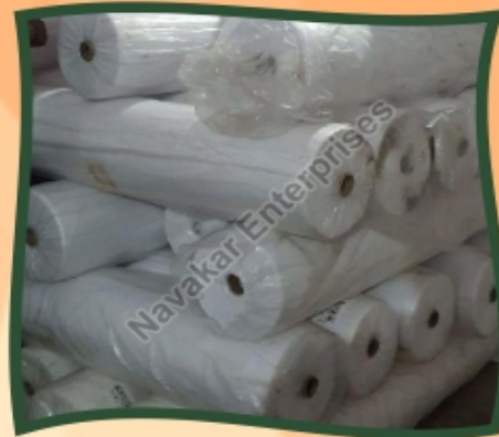
5.25 Feet Low Tunnel Crop Cover