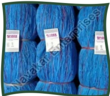
HDPE Crop Support Net