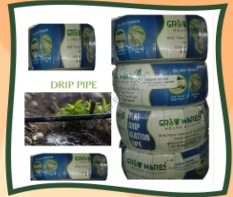
Grow More Flat Drip Irrigation Pipe