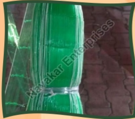
Nylon Crop Support Net