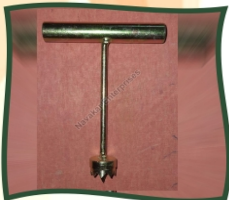
Drip Irrigation Drill Bit