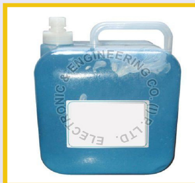
Ultrasonic Transducers & Accessories