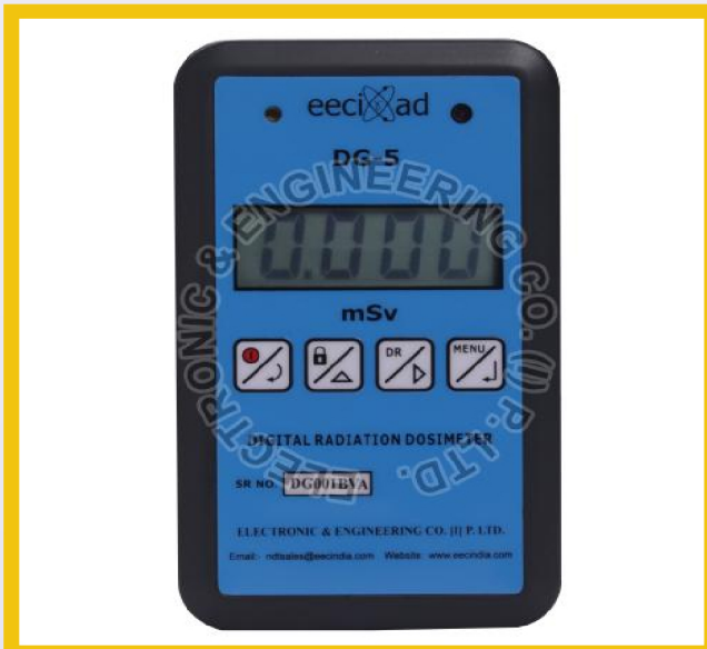
DG5 Digital Dosimeter