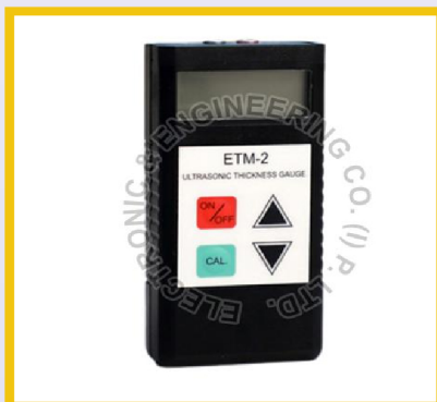
Ultrasonic Thickness Gauges