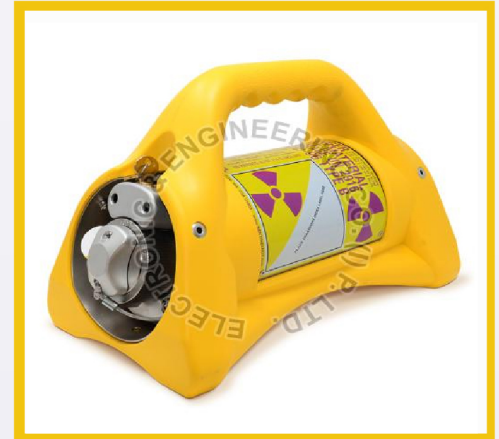
880 Delta Testing Machine