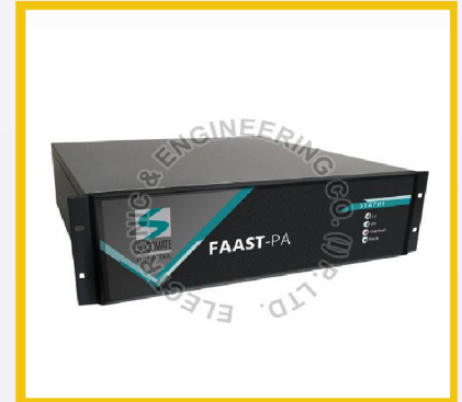
Phased Array Solutions