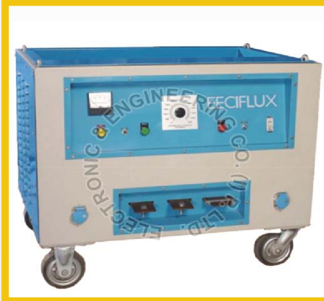
Mobile Power Unit