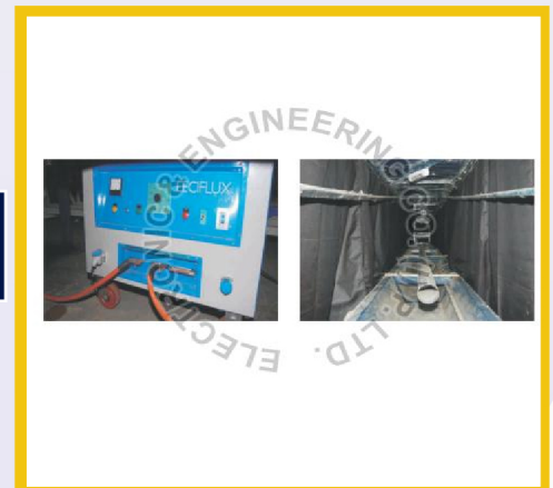
Bar Testing Machine