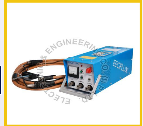
Portable Power Unit