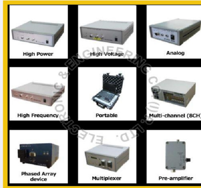
Ultrasonic Pulser & Receiver