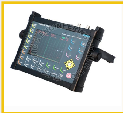
Ultrasonic Flaw Detectors