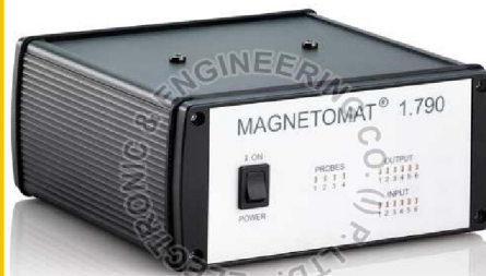
Portable Eddy Current Solutions