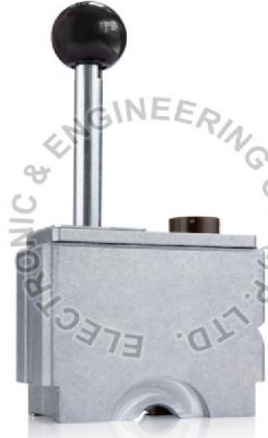
Semi Finished Material Testing Machine