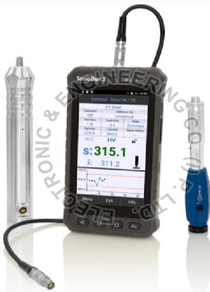
Sonodur 3 Portable Testing Machine