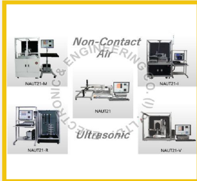
Non Contact Air Coupled Ultrasonic Testing Machine