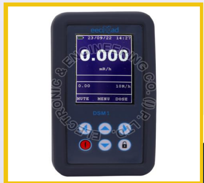
DSM-1 Survey Meter