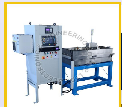
Ultrasonic Turnkey Solutions