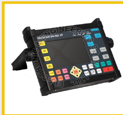
Ultrasonic Railway Solutions