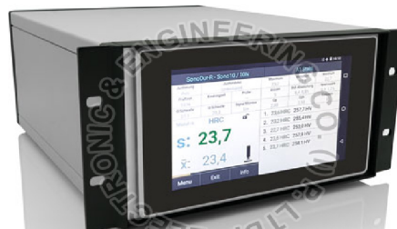
Sonodur R Automated Testing Machine