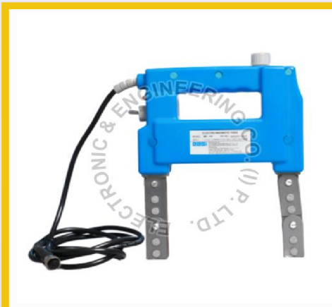
Yoke Magnetic Particle Testing Machine