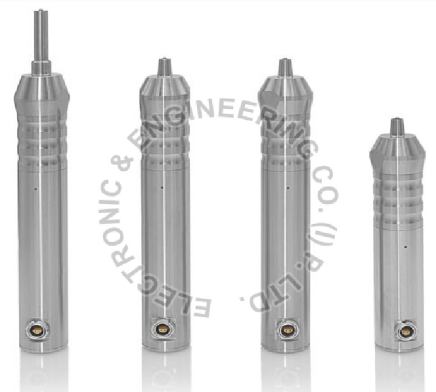
Probes Hardness Testing Machine