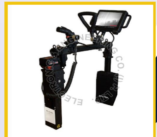
OV Security Testing Machine