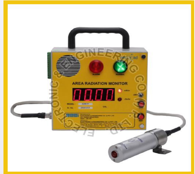
AGM-1/R1 Area Monitor