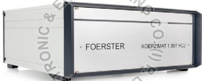
Component Testing Machine