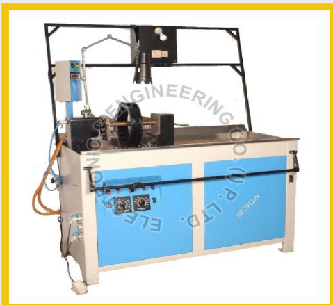
Horizontal Bench Unit