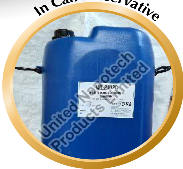
In Can Preservative