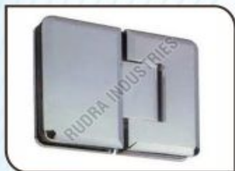
180 Degree Glass To Glass Door Hinge