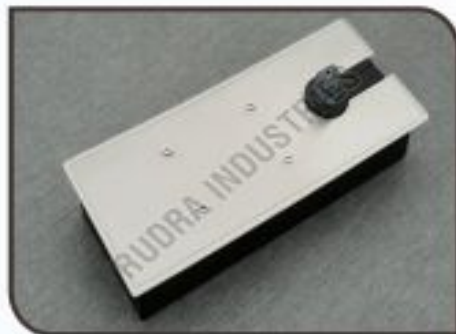
BFS-10 Floor Spring