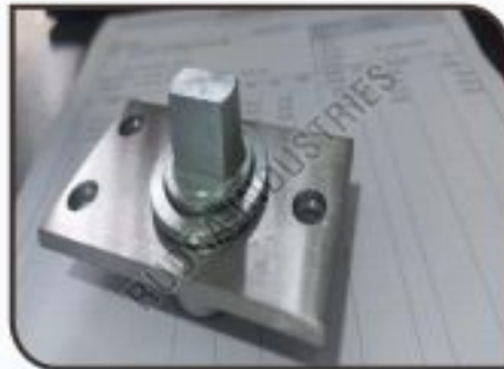
Bottom Bearing Pivot Hinges