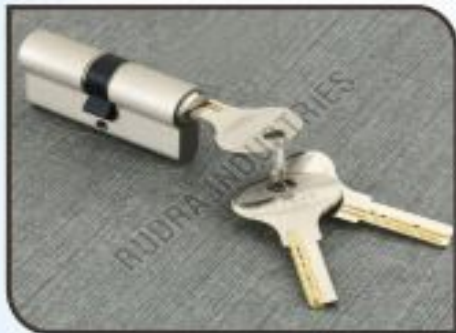
Cylinder Two Side Key