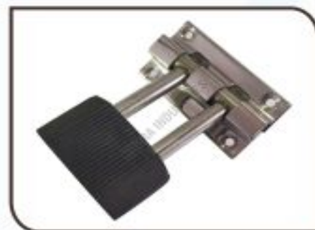
Stainless Steels Door Stopper