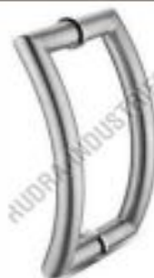
Furniture Glass Door Handle