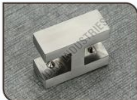
BKH-5 H Clamp Glass To Glass Connector