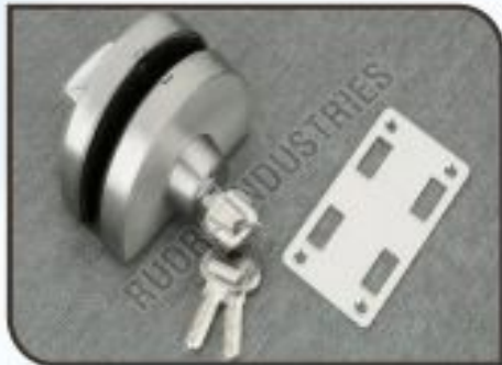
BGL-03 Wall To Glass Lock