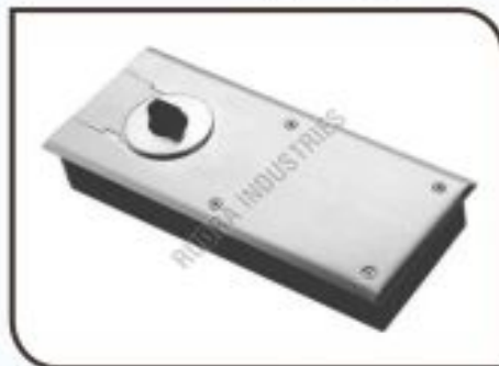
Double Cylinder Hyd- raulic Floor Spring