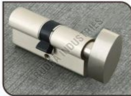
Cylinder One Side Knob Lock