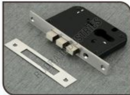
3 Bullet Lock Body