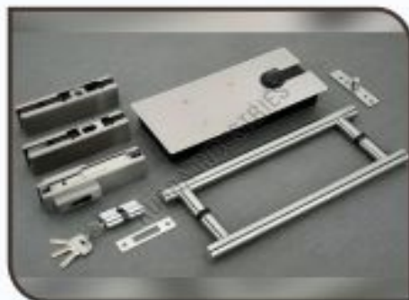
SS 304 Hydraulic Floor Spring