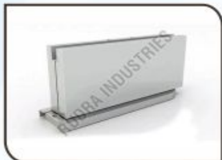
Industrial Hydraulic Floor Spring