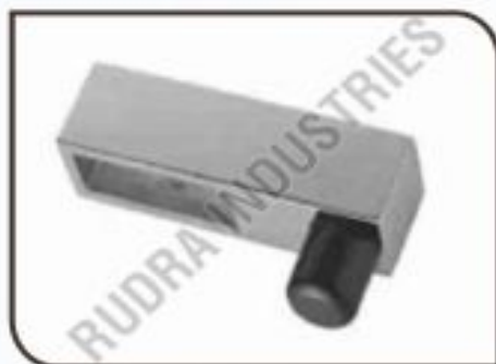
SS Sliding Door Stopper