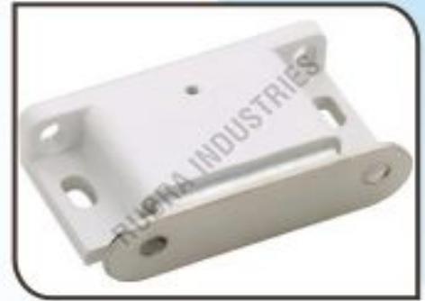
M2 PVC Door Magnet