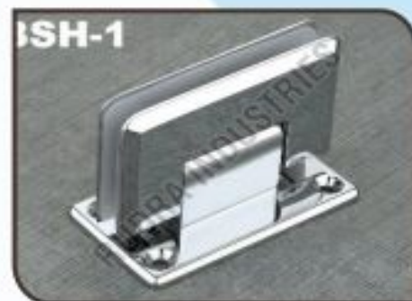
BSH-1 Wall To Glass Doors Hinge