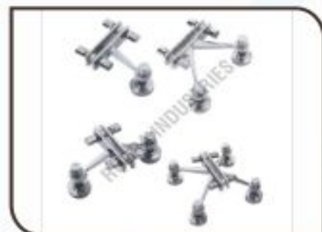
Architectural Spider Glass Fittings