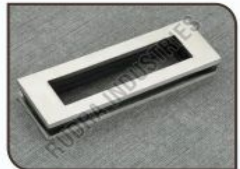
BDH-1 Rectangle Sliding Door Handle