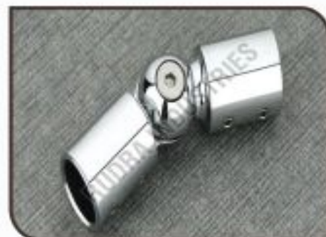
BKH-3 Pipe To Pipe Connector