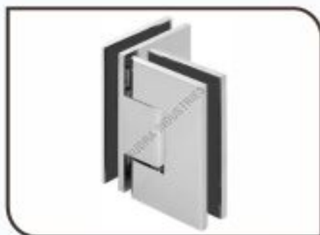
90 Degree Glass Door Hinge