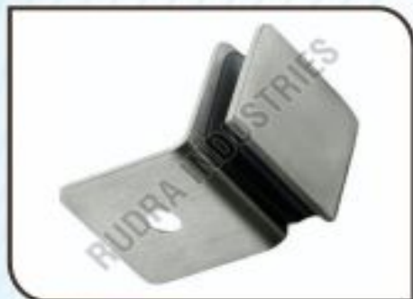
90 Degree Glass Wall Bracket