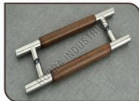
Designer Door Pull Handle