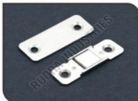
SS Slim Magnetic Door Catches