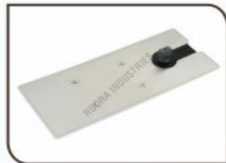
Bfs - 222 Hydraulic Floor Spring Set