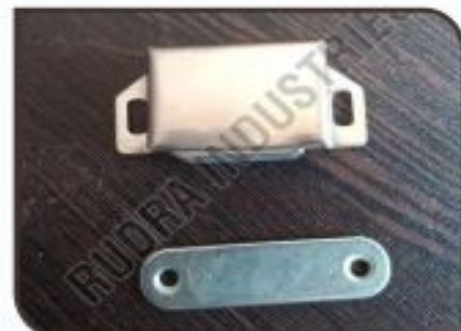
M2 Magnetic Door Catches