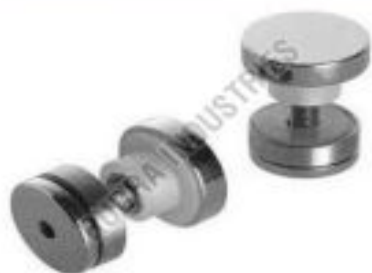
Wall Mount Sliding Door Rollers