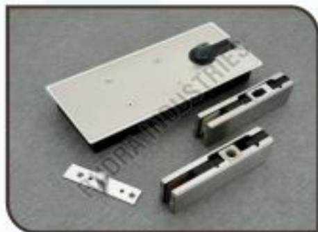
BFS-100 Hydraulic Floor Spring Set