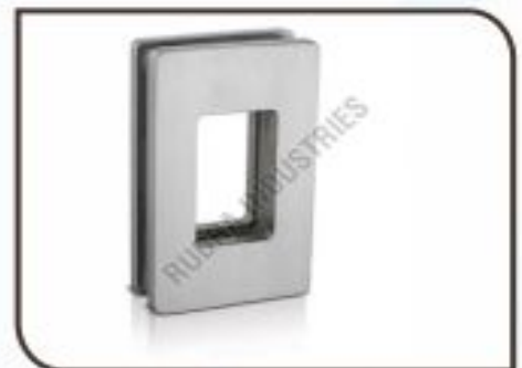
SS Rectangular Sliding Handle