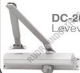
DC-2000 Levev Arm