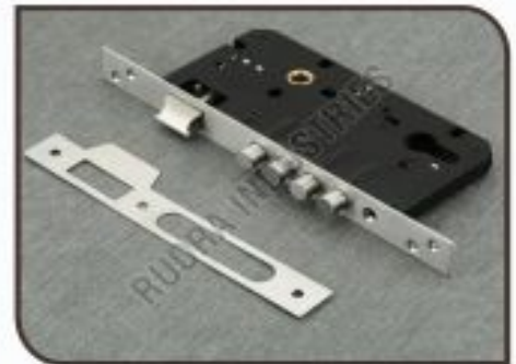
4 Bullet Lock Body