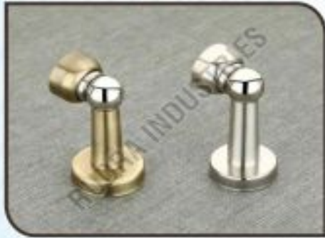
Antique Finish Steel Magnet