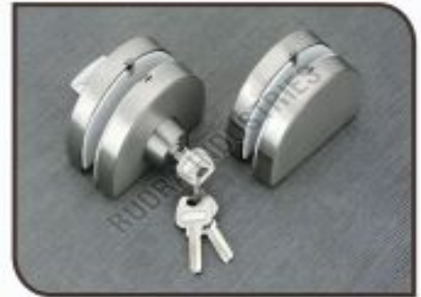
BGL-02 Glass To Glass Lock