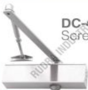
DC-4000 Screw Arm