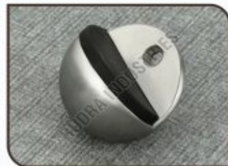
BKH-7 Half Round Door Stopper