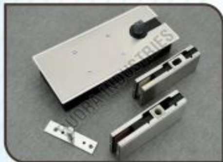
Heavy Duty Floor Spring