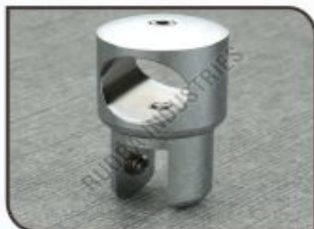
BKH-2 Pipe To Glass Connector