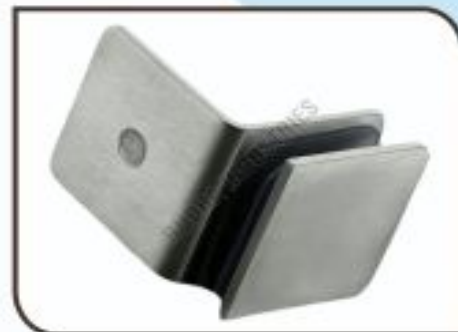
BGCS-2 Glass Wall Connector