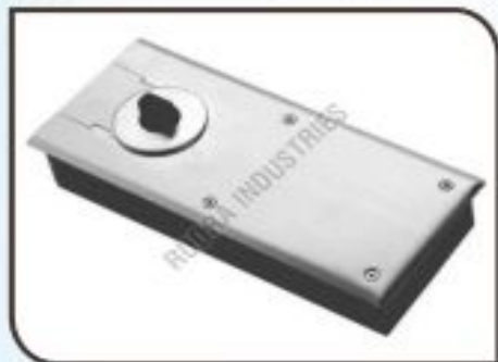
BFS- 22 Heavy Duty Hydraulic Floor Spring