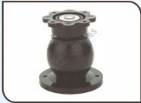
Round PVC Door Magnet