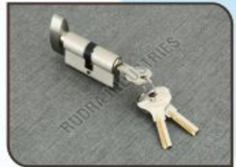
Cylinder One Side Knob One Side Key