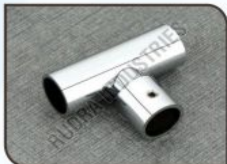
BKH-4 3 Way Pipe Connector