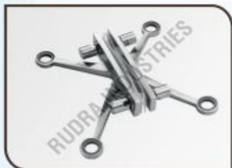
Glass Spider Fitting