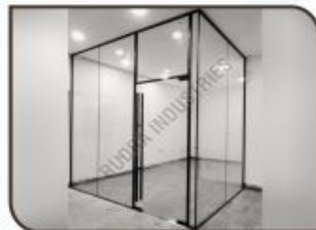
Aluminum Glass Partition