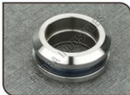
BDH-4 Round Door Hollow Handle