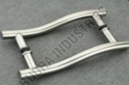
S Type Glass Door Handle