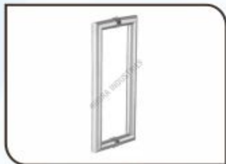
Glass Door Pull Handle