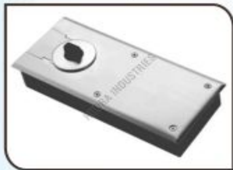
Double Floor Spring