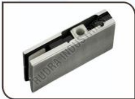
SS304 Glass Patch Fitting