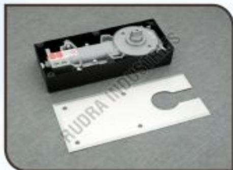
Single Cylinder Floor Spring