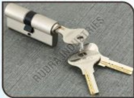
40mm Cylinder One Side Key