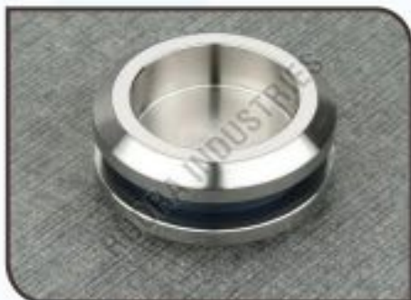
BDH-3 Round Door Handle