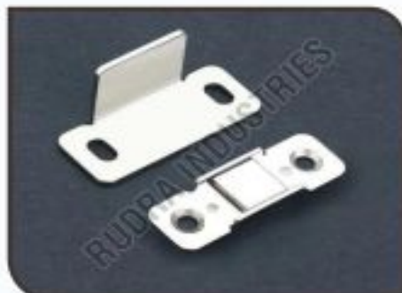
L Type Stainless Steel Door Magnet