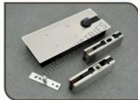
Silver Hydraulic Floor Spring