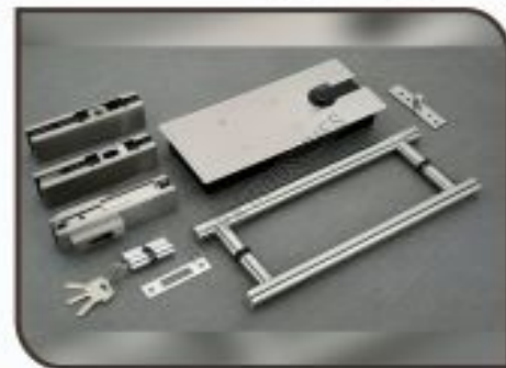
BFS-10 Hydraulic Floor Spring