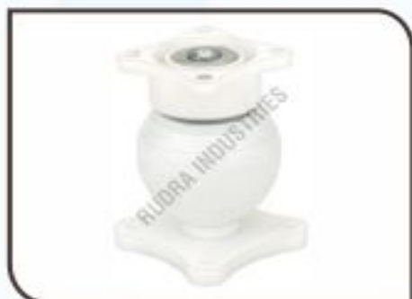
M5 Magnetic Door Catches