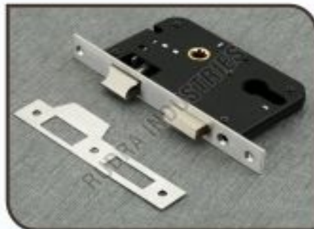
Regular Lock Body