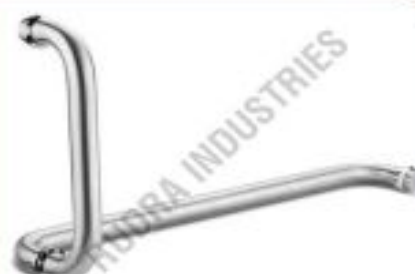
Shower Glass Door Handle