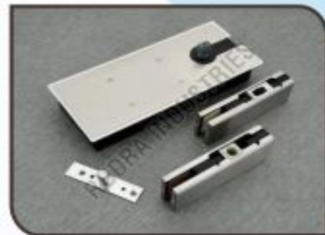
Bricon England Floor Spring