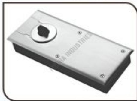
Bfs -22 Hydraulic Floor Spring