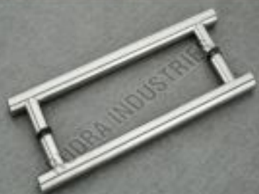
H Shape Glass Door Handles