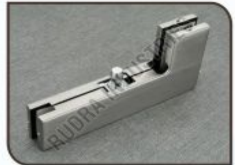
BPT-40 L Patch Fitting