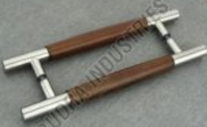
Antique Door Handle