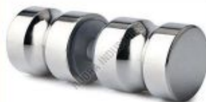
35mm Sliding Door Roller