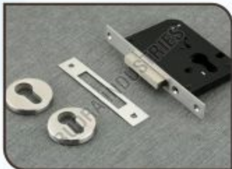
Regular Dead Lock With Key Hall