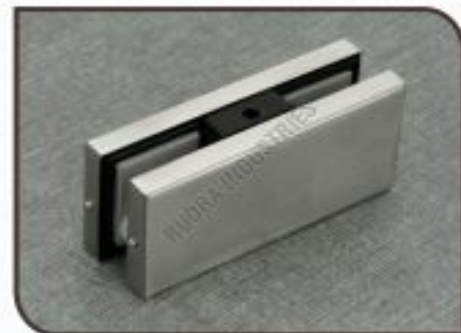
Glass Door Hydraul- lic Floor Spring