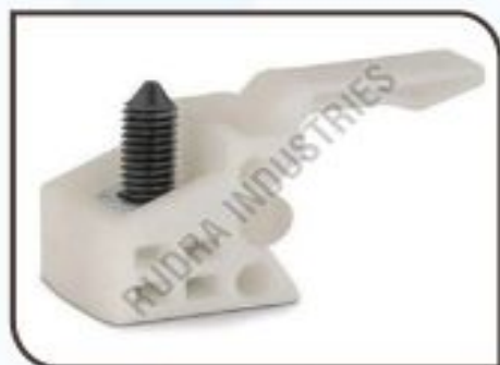
Door Sliding Stopper