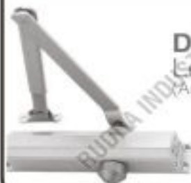
DC-2500 Levev Arm (Auto Lock)