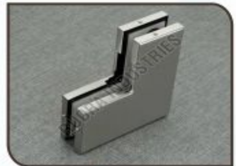
Stainless Steel Small L Patch Fitting