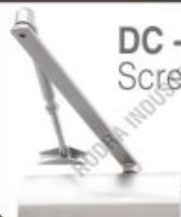
DC - 3000 Screw Arm