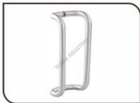
C Type Door Pull Handle