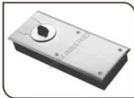
SS 304 Floor Spring