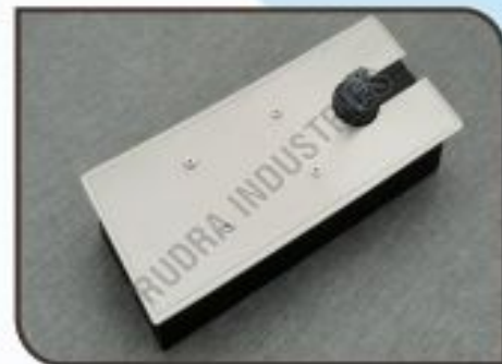
BFS-10 Single Cylin- der Floor Spring