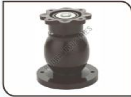
Door Magnetic Catcher