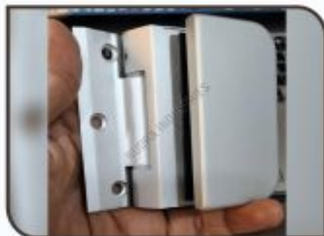
Aluminium Slime Partition Hinge