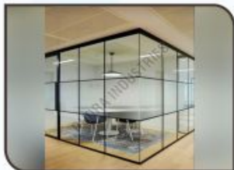
Aluminium Slim Profile Glass Partition