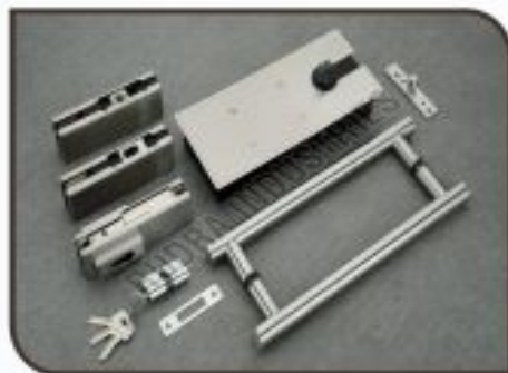
BFS-110 Hydraulic Floor Spring Set