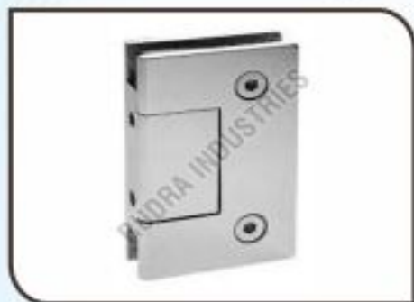
Wall to Glass Shower Hinges