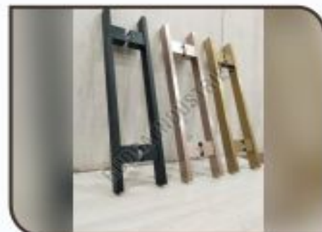
Aluminium Slim Profile Glass Handle