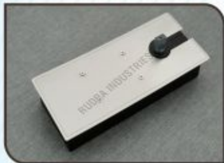
Bfs Hydraulic Floor Spring