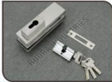
BGL-01 Bottom Patch Lock