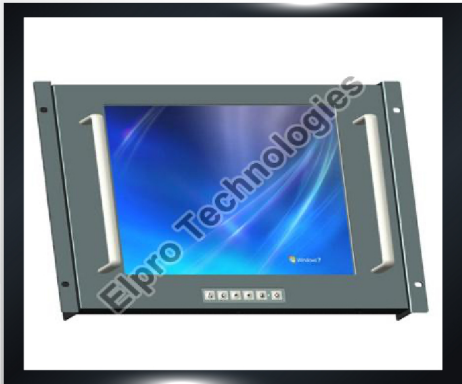
Rack Mount Touch Screen Monitor