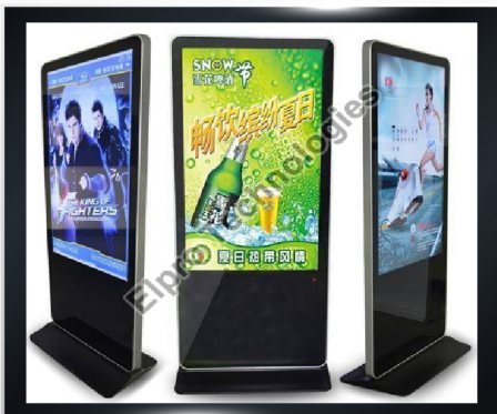
Standalone Digital Signage