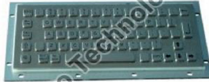
Industrial Grade Metal Keyboard