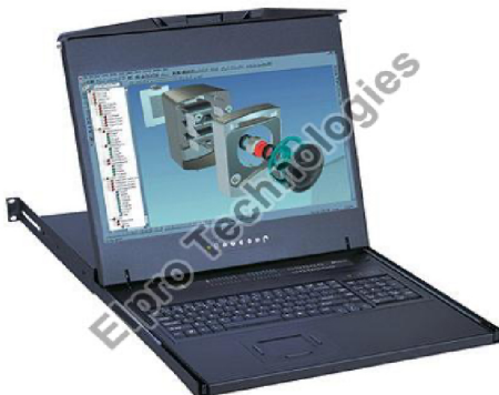
Lcd Kvm Switch