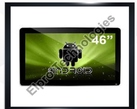
Wall Mounted Lcd digital signage