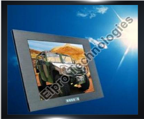
Sunlight Readable Monitor