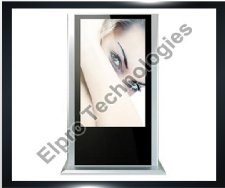
Floor stand digital signage