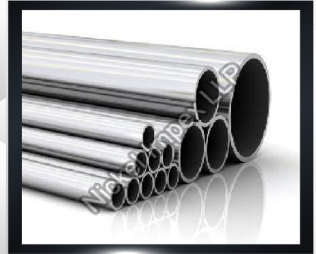
Stainless Steel Welded Tubes