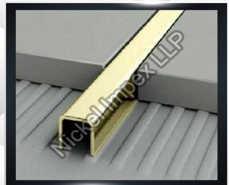
U Shaped Stainless Steel Profile