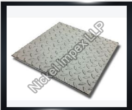
Stainless Steel Diamond Plates