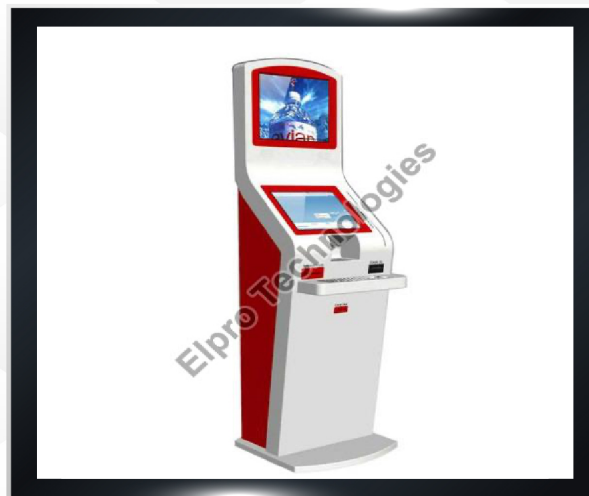
Dual Display Touch Screen Kiosk