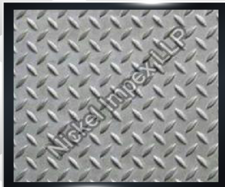
Stainless Steel Chequered Plates