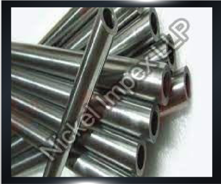
309 Stainless Steel Tubes