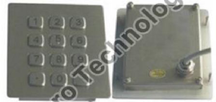
Stainless Steel Numeric Keypad