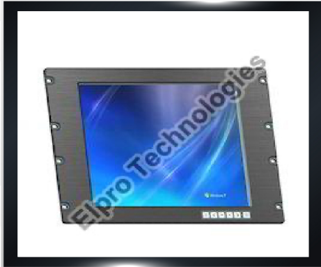
Industrial LCD Display