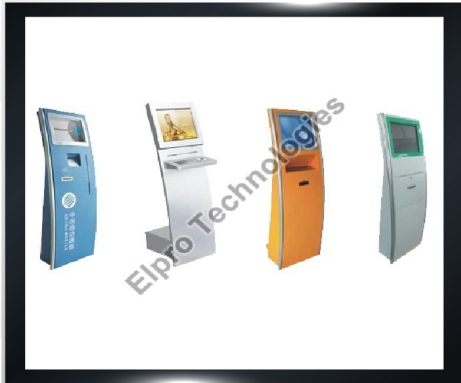
Self Service Terminal