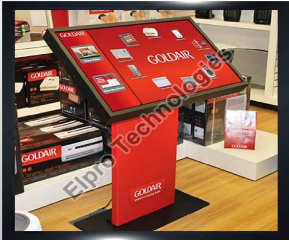
Android Touch Screen Kiosk