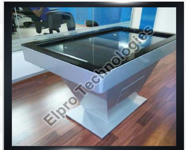
Interactive touch table