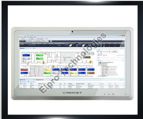
Medical Grade Panel Computer