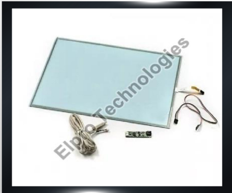
Touch Screen Panel