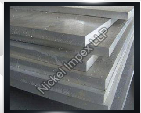
Stainless Steel Polished Plates