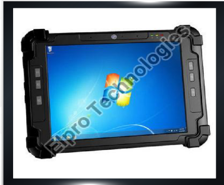
Rugged tablet pc