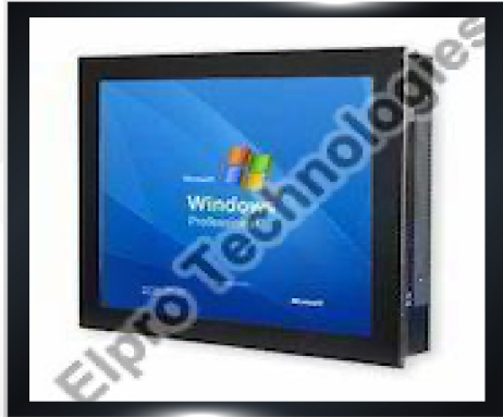
Industrial Panel PC