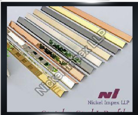
L Shaped Stainless Steel Profile