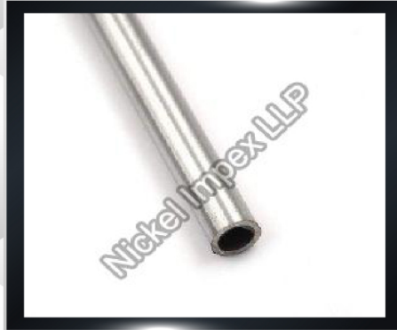
321 Stainless Steel Tubes