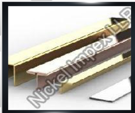
T Shaped Stainless Steel Profile