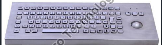
Stainless Steel Keyboard