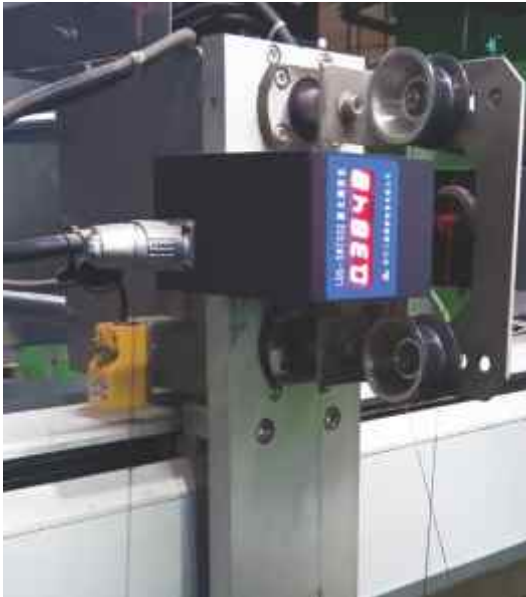
Inline Dimensional Tester