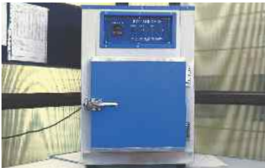
Hot Air Oven

Automatic in line Insulation pinholes testing.