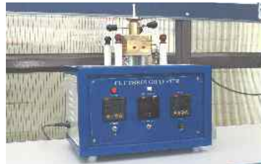
Cut through Tester