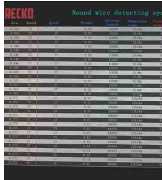
Inline Pin hole Tester

Automatic in line Insulation pinholes testing.