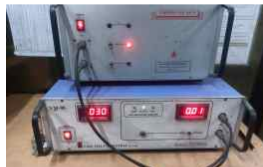
Tan Delta Tester

Temperature class of Insulation testing.