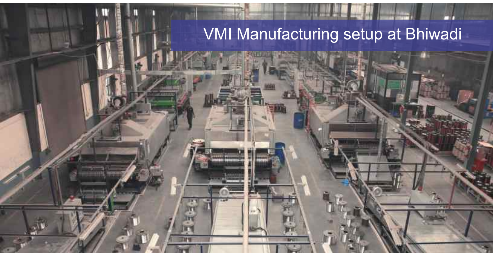
VMI Manufacturing setup at Bhiwadi

Alliance Copper Concepts Pvt. Ltd. (An ISO 9001:2015 Co) is an association of vast experience accompanied by young zeal & enthusiasm. Our organization is very well equipped to deliver its customers the best quality products at the most reasonable prices, being our works situated at one of the most economically strategic locations of India, Jammu. We manufacture ACC Enamelled Winding Wires made of C.C. Copper, range between 8-SWG to 40-SWG. These wires are insulated with variety of Wire Enamels, like Polyester, Modified Polyester, Polyesterimide (Hermetic) and Dual Coat (Lmide-Amide).