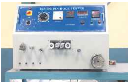
3 Kv DC Pin hole Tester