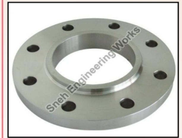
CNC Machine Flange