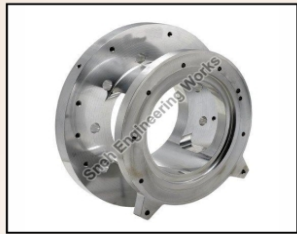
Steel CNC Turning Fixture