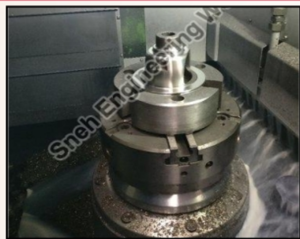
Hydraulic Soft Jaws