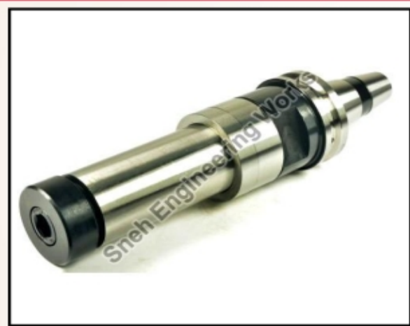
Mild Steel Face Mill Arbor