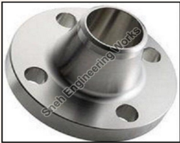
Cylindrical Grinding Job Work