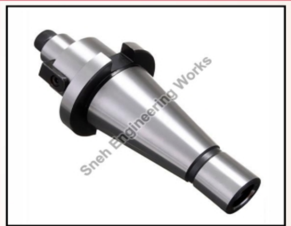
Stainless Steel Face Mill Arbor