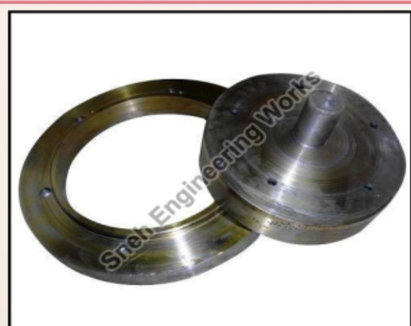
Stainless Steel Punching Dies