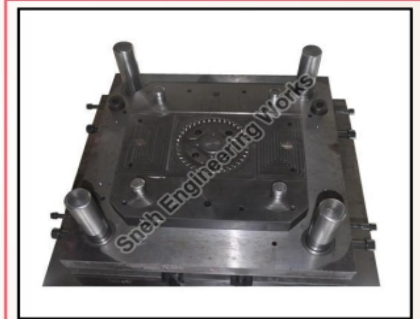
Punch Press Die