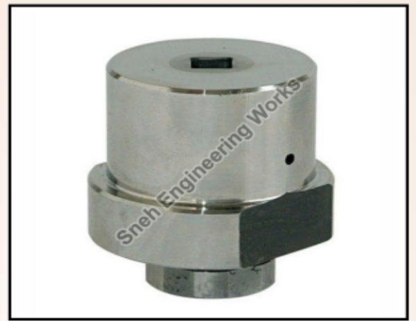
Nut Forging Die