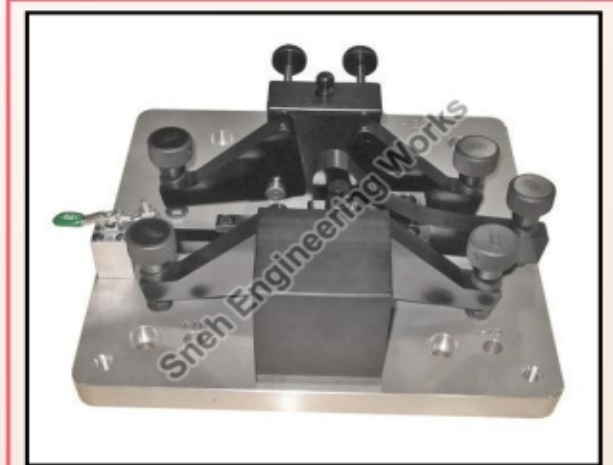
Hydraulic Clamping Fixture