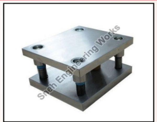
Pillar Die Set