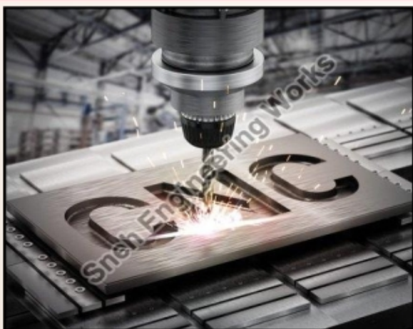
Aluminum CNC Turning Machining Services