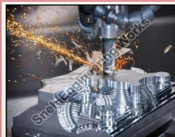
Stainless Steel CNC Turning Machining Services