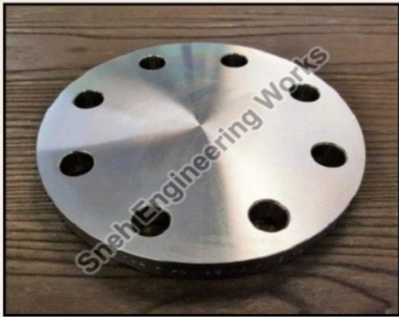
Milling Job Work