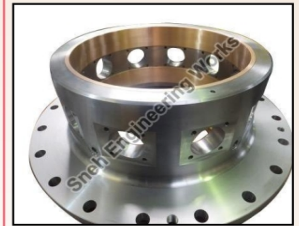
CNC Turning Fixture