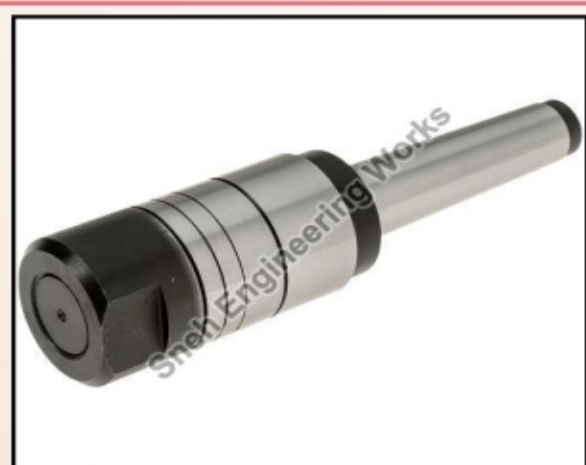
Stub Milling Arbor