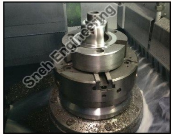
Hydraulic Soft Jaws