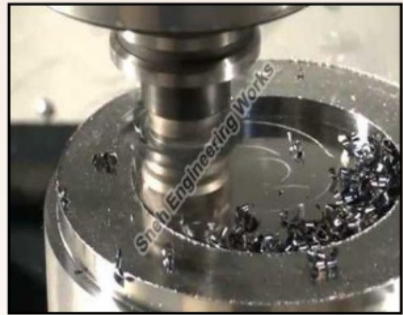
CNC Machining Job Work