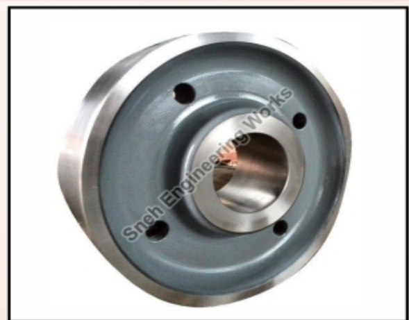
Mild Steel CNC Turning Machining Services