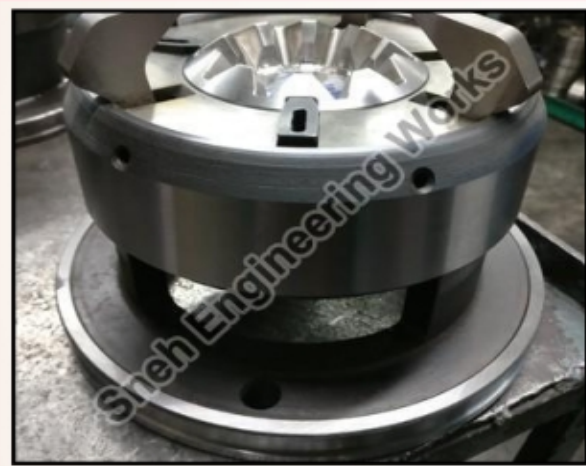
Mild Steel Jig Fixture