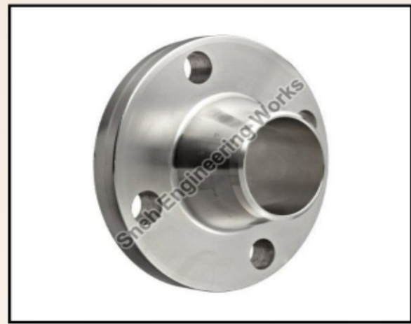
Weld Neck Raised Face Flange