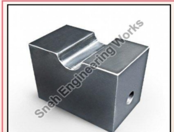
Stainless Steel Die