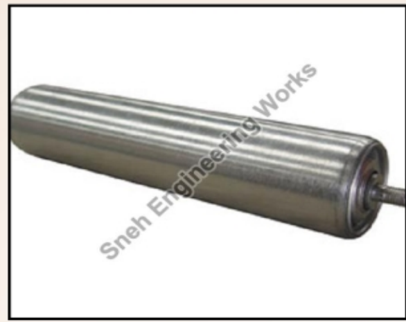
Stainless Steel Conveyor Roller