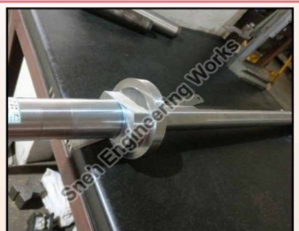
Long Milling Arbor