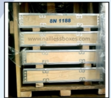
Wooden Pallet With Boxes