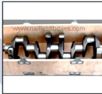
Crank Shaft Boxes