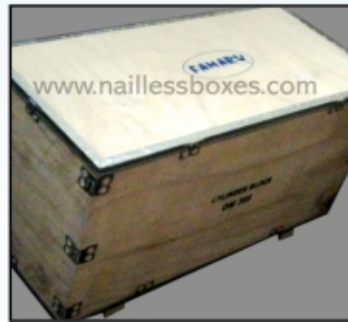
Cylinder Block Boxes