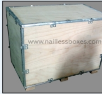
Boxes For Engines