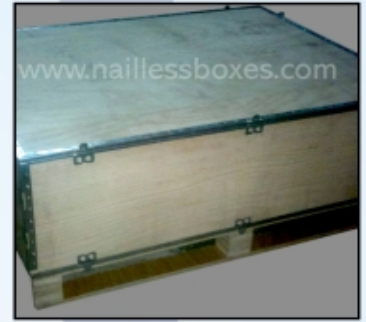
Boxes With 4 Way Lifting