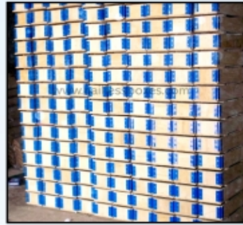
Boxes With Nails