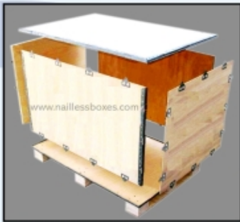
Collapsible, Reusable, S ...