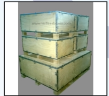
Boxes For Heavy Castings/...