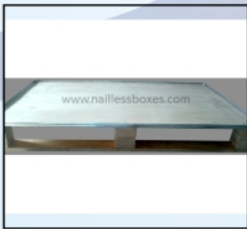
Plywood Pallet With Metal Premium Grade Laminated B...