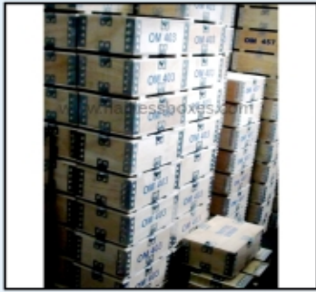
Cylinder Head Boxes