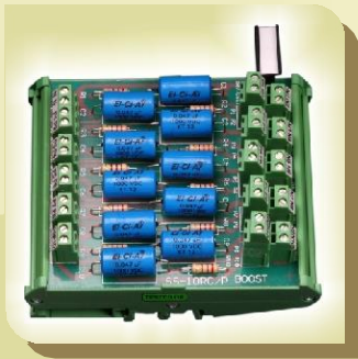
RC Snubber Card