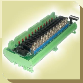
Power Distribution Board