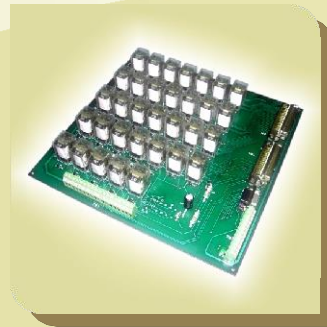
Custom Built Relay Module