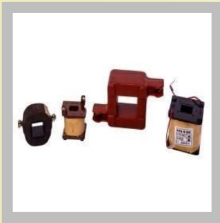
Magnetic Contactor Coils