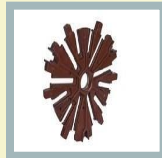
SMC and DMC Components