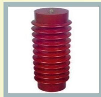
33kV Support Insulator