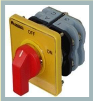
16A Off-On Selector Switch 2Pole 250V AC