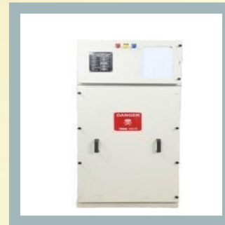
Voltage Metering Panel