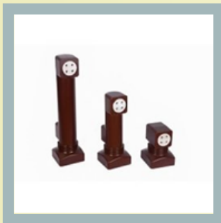
RYB and Spout Bushing