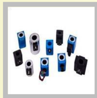
Directional Control Coils