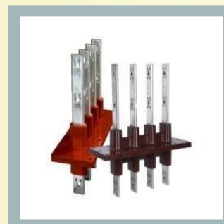
LV Transformer Bushing