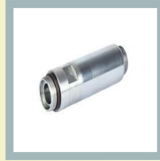
Directional Control Pull Tube