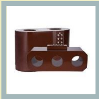
Block CT Low Voltage Instrument Transformer