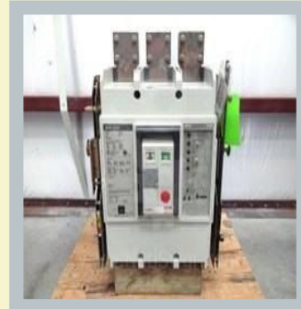
Breaker Retrofitting Service