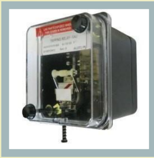
Master Trip Relay VAJH VAJSVAJHM Tripping Relays