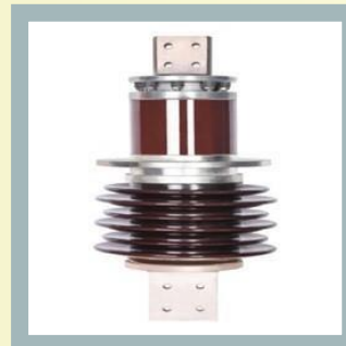
High Current Bushing