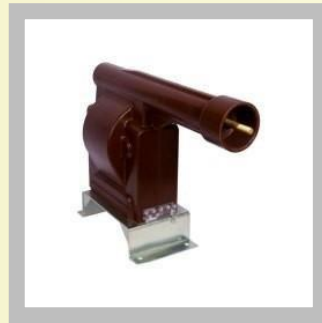
Gun Type VT Medium Voltage Instrument Transformer