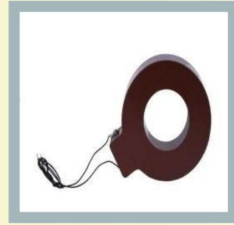
Ring Window CT Low Voltage Instrument Transformer