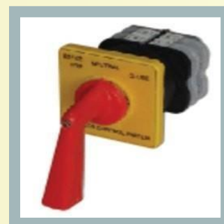
32 A Breaker Control Switches