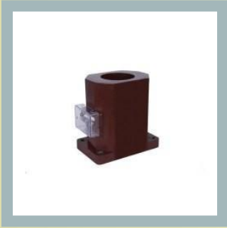
RMU CT Low Voltage Instrument Transformer