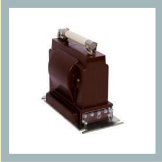
Fixed Type VT Medium Voltage Instrument Transformer