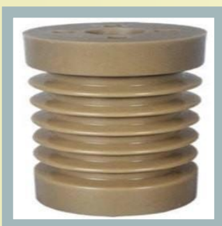
11kV Support Insulator