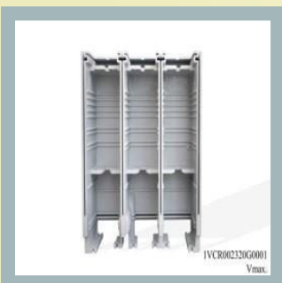
ABB VD4 Monobloc (PanelBody Spout )