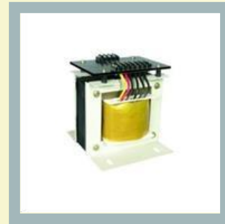
Control Low Voltage Instrument Transformer