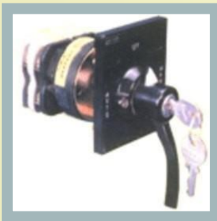
50 AMP. Breaker Control Switch