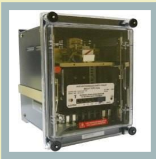
Alstom cag Relay