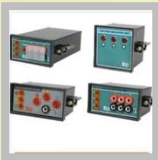
Voltage Indicator Unit