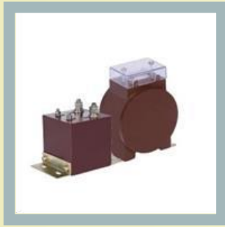
Wound CT Low Voltage Instrument Transformer