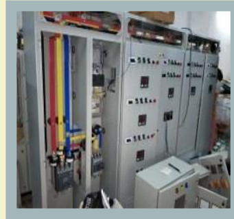
Protection Panel Testing Service