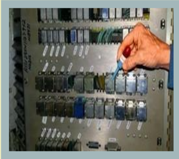
Relay Testing Services