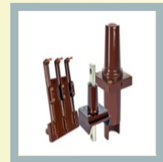
RMU Transformer Bushing