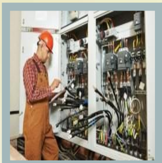
Relay Programming Service