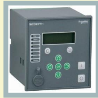
MiCOM P111 Model L Numeric Relays