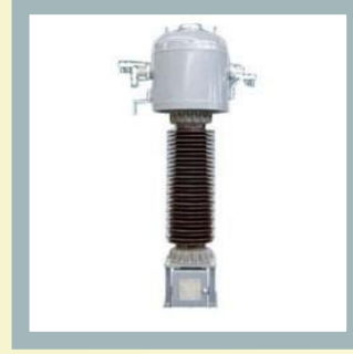
High Voltage Potential Transformer