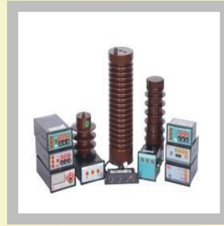
Voltage Detecting System