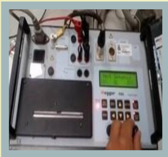
Circuit Breaker Testing Service