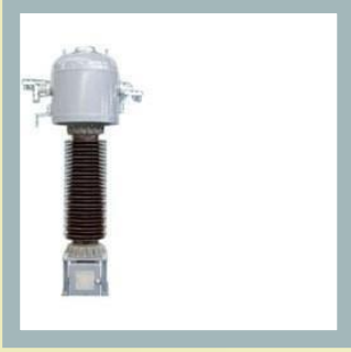
High Voltage Current Transformer