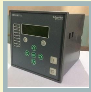
Micom P111 Model E Numeric Relay