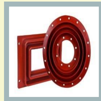
Seal Off Bushing