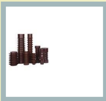
Transformer Support Insulator