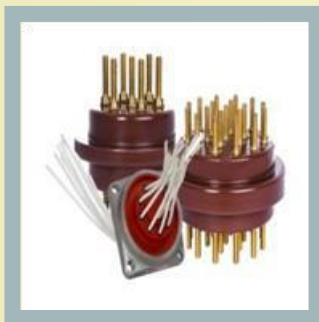
Terminal Plates Transformer Bushing