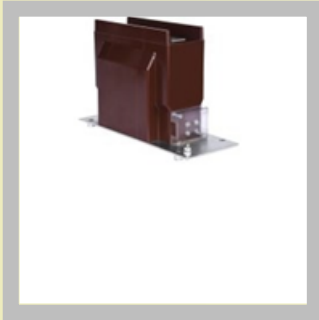
Wound CT Medium Voltage Instrument Transformer