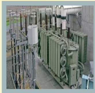
Transformer Testing Service