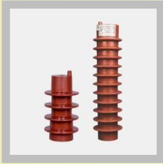
Voltage Detection Insulator