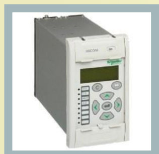
MiCOM P120 Numeric Protection Relay