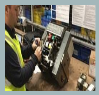
Breaker Maintenance and Servicing