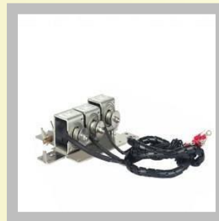
Circuit Breaker Coils