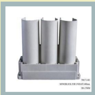
ABB Vmax EN'Bloc Housing