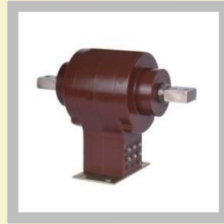
Bar CT Medium Voltage Instrument Transformer