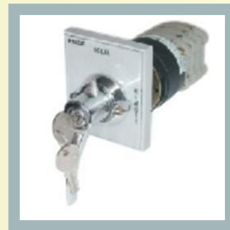
25 AMP. Breaker Control Switches