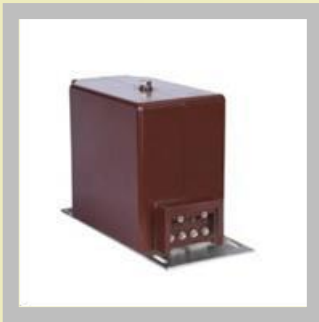
Earthing Trunk VT Medium Voltage Instrument Transformer