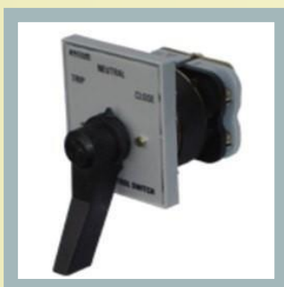
32-40A Breaker Control with Ee Type Handle