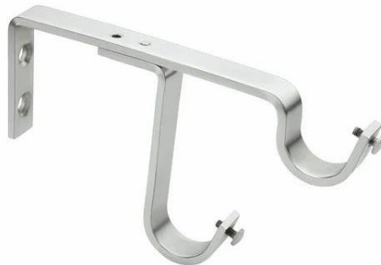
S.S DOUBLE SUPPORT (C.P) (19MM)