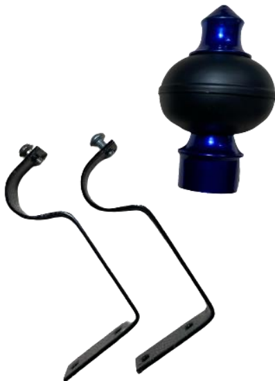
BLUE/BLACK WITH M.S COLOR SUPPORT