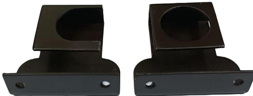
M.S UNIVERSAL BRACKET (P.C.O) (20MM/25MM)