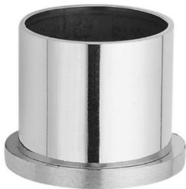
S.S CONCEALED (CASTING BASE)