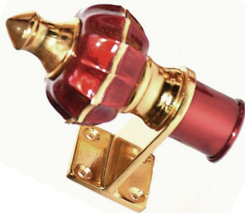
CHERRY/GOLD (12 P EHL)