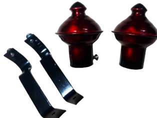
HALF BRACKET (WITH SUPPORT)