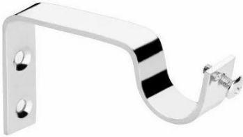
S.S SUPPORT (C.P) (12MM)