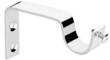
S.S SUPPORT (C.P) (19MM)