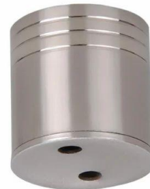
S.S CONCEALED (PLAIN)