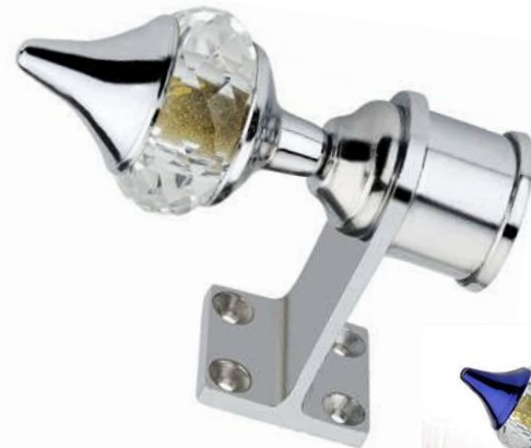
C.P. ( ALU. T BASE )