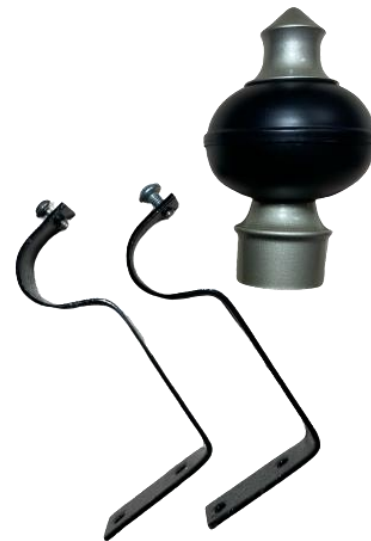
BLACK/SILVER WITH M.S COLOR SUPPORT