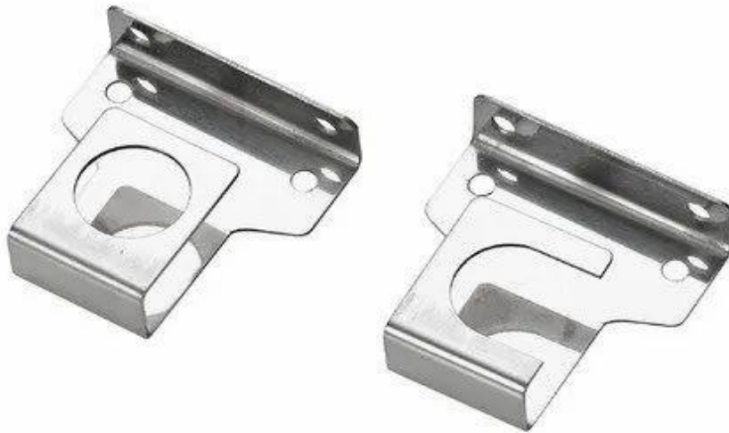
S.S UNIVERSAL BRACKET (S.S.F) (20MM/25MM)