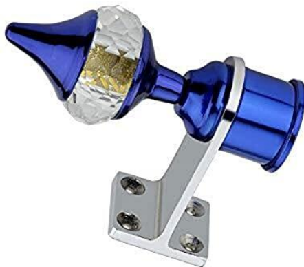
BLUE ( ALU. T BASE )