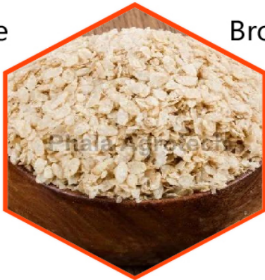
Brown Rice Flakes