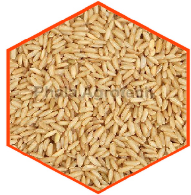
Brown Hand Pound Rice