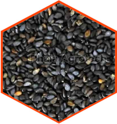
Black Sesame Seeds