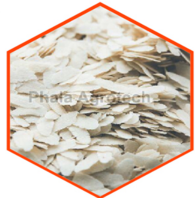
White Beaten Rice