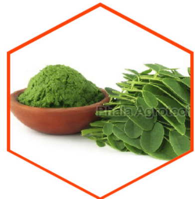
Moringa Leaf Powder