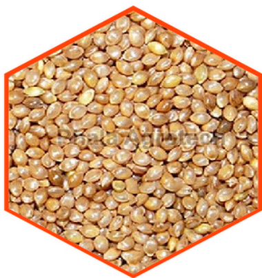
Brown Barnyard Millet