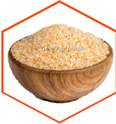
Brown Barley Dalia