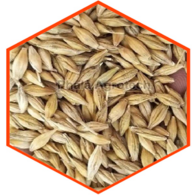
Dry Brown Whole Barley Grain