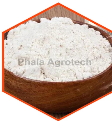
Barnyard Millet Flour