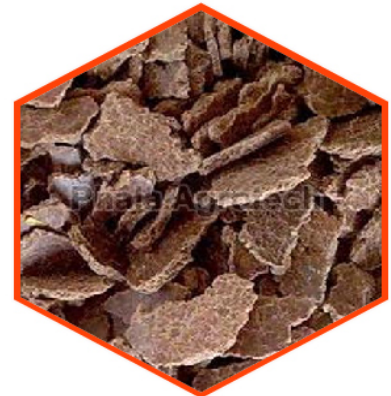
Coconut Oil Cake