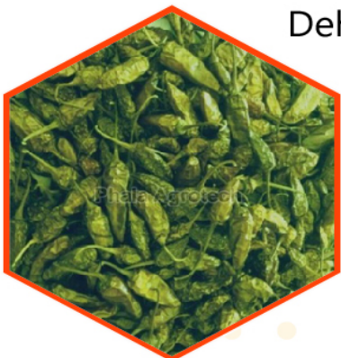
Dried Green Chilli