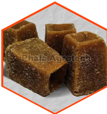
Natural Jaggery Cubes