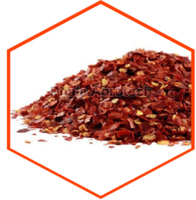
Red Chilli Flakes