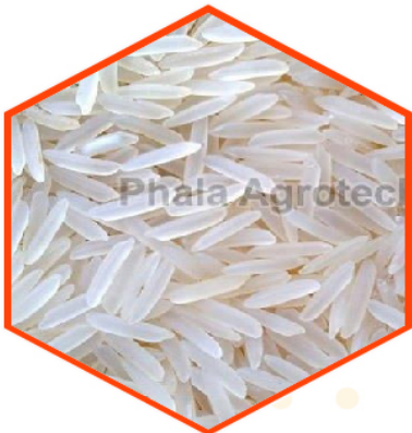
Indian Basmati Rice