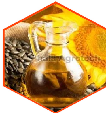
Sun Flower Oil