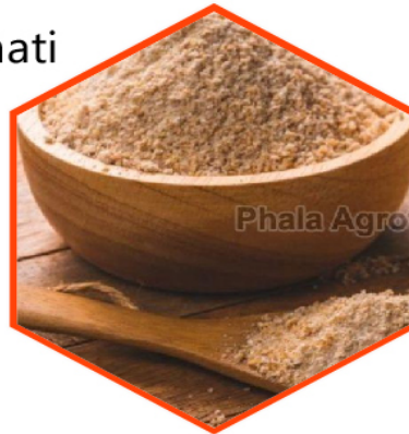
Brown Rice Flour