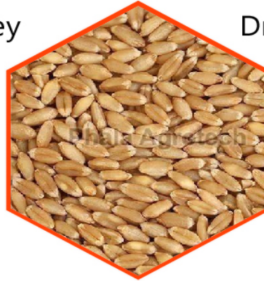
Whole Wheat Grain