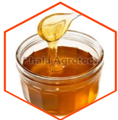
Natural Liquid Jaggery