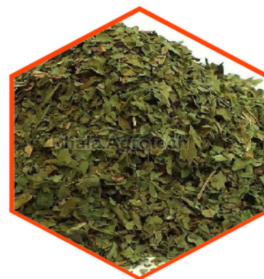
Dehydrated Coriander Leaves