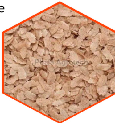
Red Rice Poha