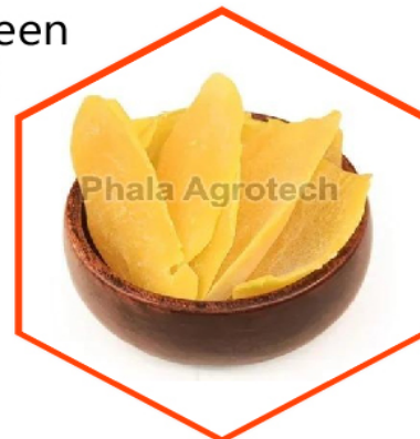
Natural Dehydrated Mango