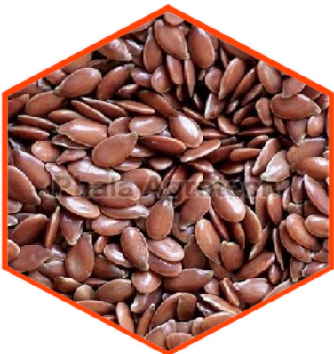
Brown Natural Flax Seeds