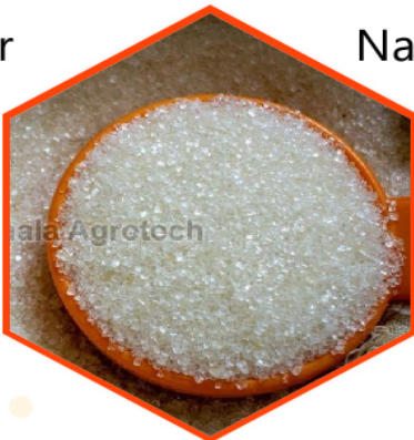
Indian White Khandsari Sugar