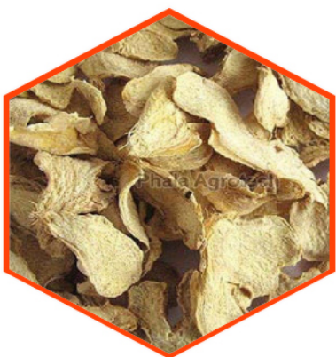
Brown Dry Ginger Flakes