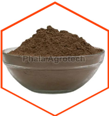
Amlaki Rasayan Powder