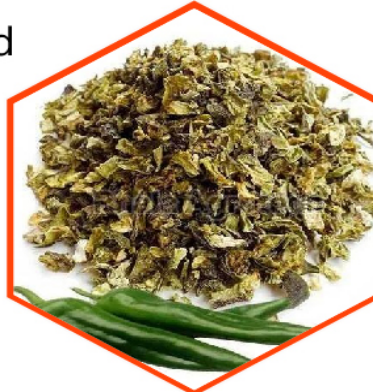
Dehydrated Green Chilli Flakes