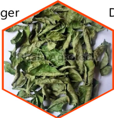
Dehydrated Curry Leaves