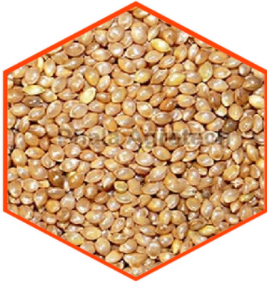
Brown Barnyard Millet