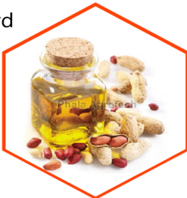
Crude Peanut Oil