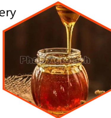
Natural Raw Wild Honey