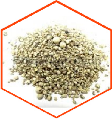
Crushed White Pepper