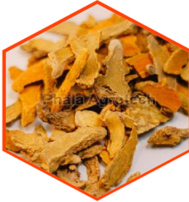
Dry Turmeric Slices