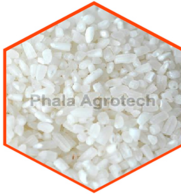
Broken Basmati Rice