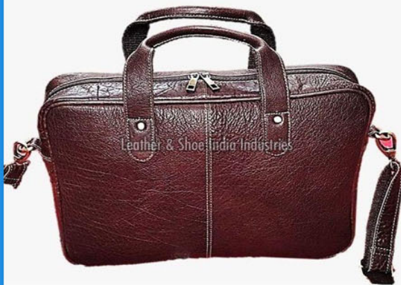
Genuine Leather Laptop Bags