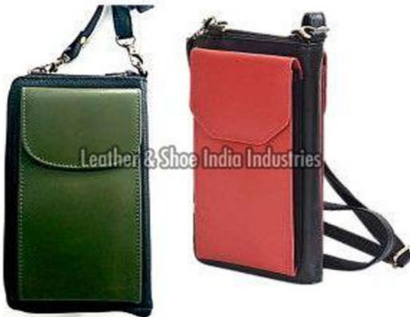
Leather Mobile Sling Bag