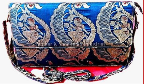
Swarnachari Sling Bags