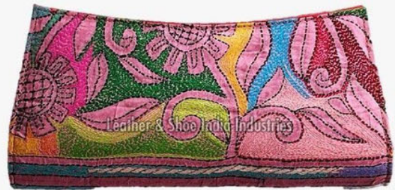
Kantha Stich Clutch Bags