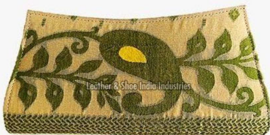
Jamdani Clutch Bag