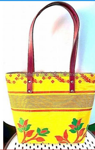
Jamadagnis Premium Canvas Hand Embroidered Tote Bag