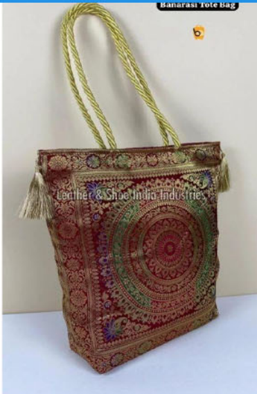
Printed Silk Banarasi Tote Bag