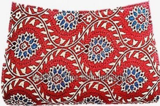
Ajrakh Printed Clutch Bag