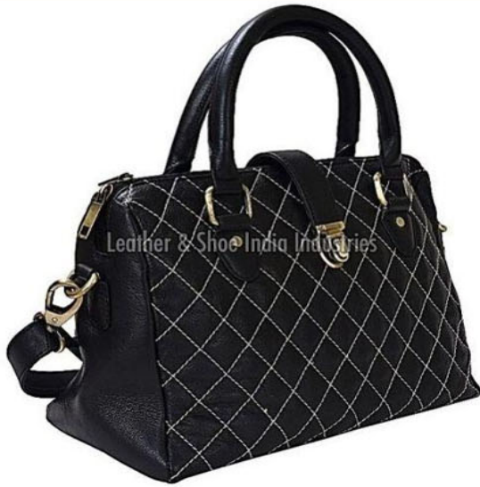
Diamond Embroidery Leather Sling Bags