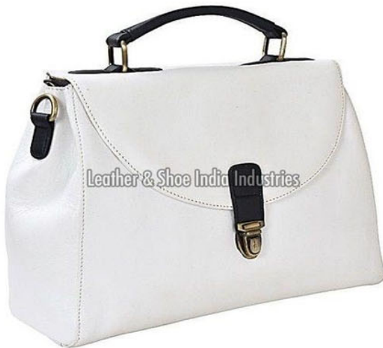
White Genuine Leather Sling Bags