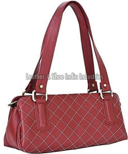
Genuine Ladies Leather Handbags