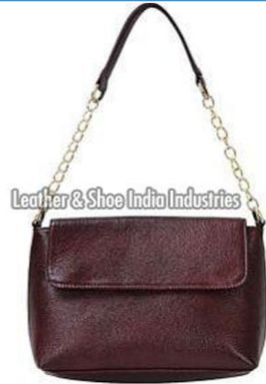
Brown Ladies Leather Sling Bag