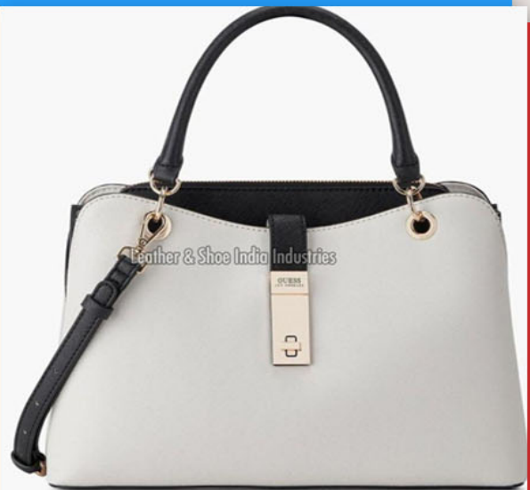
Leather Sling Bags