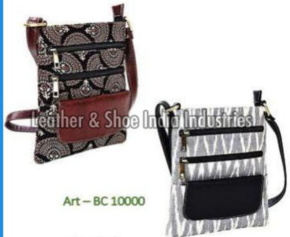
Cotton Mobile Sling Bag