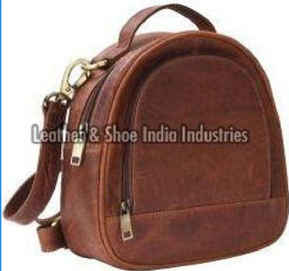
Casual Leather Backpack