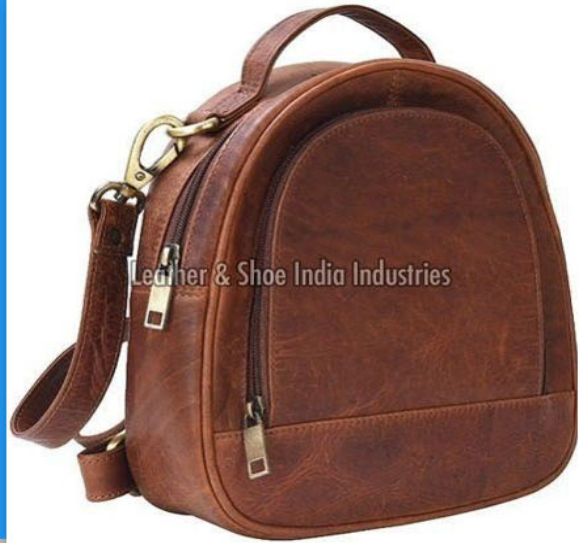
Ladies Genuine Leather Backpack