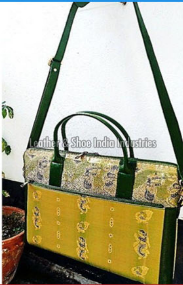
Handwoven Italian Leather Bag