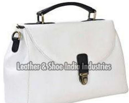
White Ladies Leather Sling Bag