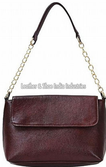
Genuine Leather Shoulder Bag