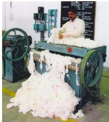
Figure Single Roller Gin

The principle of working of single roller gin is popularly known as McCarthy principle named after its proponent and shown in Figure.