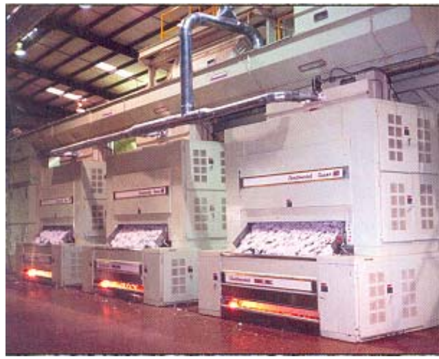
Fig. Saw Gin

box or seed conveyor. The lint is whipped off the teeth of the saws by high-speed brushes or an air blast.