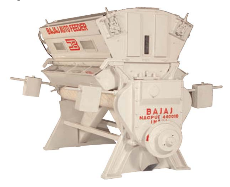
Fig. Double Roller Gin machine with auto-feeder

Double Roller is the improved version of McCarthy Single Roller Gins. In a double roller (DR) gin, two spirally grooved leather rollers, pressed against two stationary knives with the help of adjustable dead loads, are made to rotate in opposite directions at a definite speed.