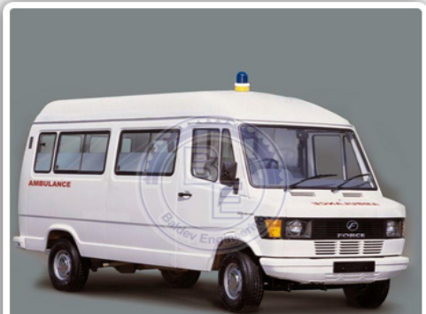
Force Motors Traveller Ambulance