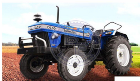
Sonalika DI 50 Sikander Tractor