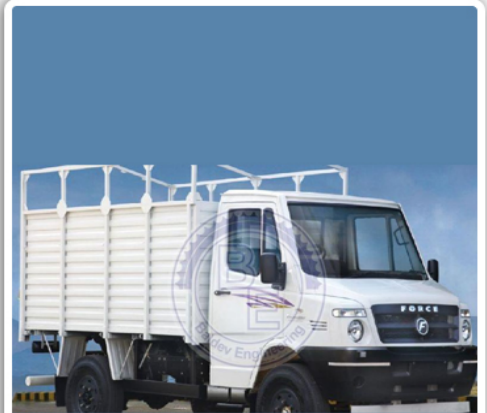
Force Motors Shaktiman Mini Truck