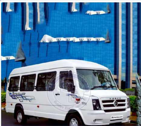
Force Motors Traveller Delivery Van