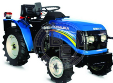
Sonalika GT 20 Tractor