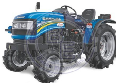
Sonalika DI 750 III Sikander Tractor