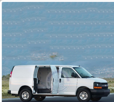
Force Motors Trax Delivery Van