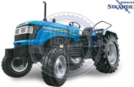
Sonalika DI 745 III Sikander Tractor