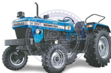
DI 730 II HDM Sonalika Tractors