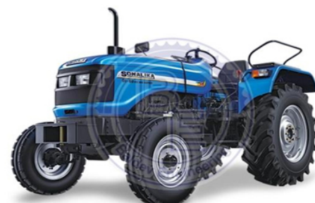
Sonalika DI 30 Baagban Super Tractor