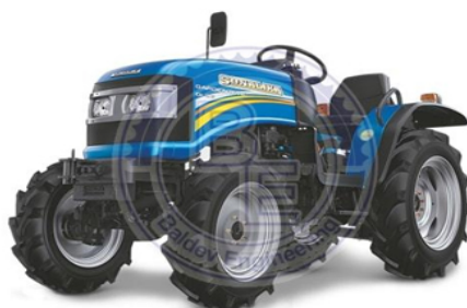
Sonalika GT 26 Tractor