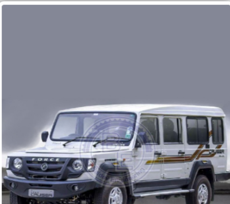
Force Motors Trax Cruiser