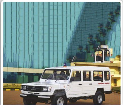
Force Motors Trax Ambulance