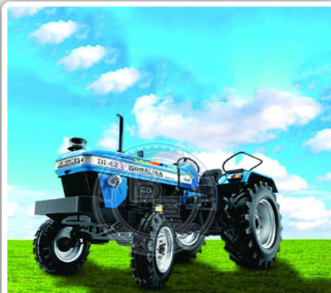
Sonalika DI 42 Sikander Tractor