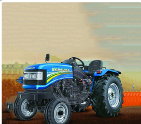
Sonalika DI 30 Baagban Tractor