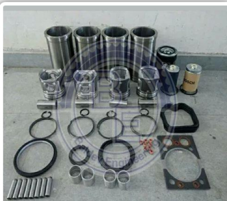
Sonalika Tractor Spare Parts