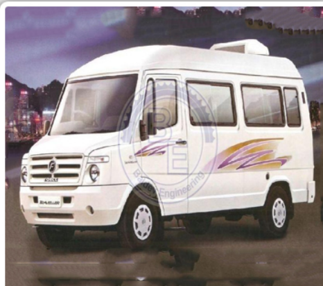
Force Motors Traveller