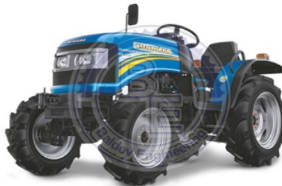
Sonalika WT 75 Tractor