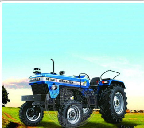
Sonalika DI 740 III Tractor