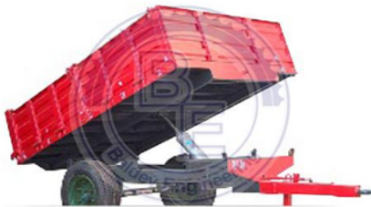
Agriculture Tractor Trolley