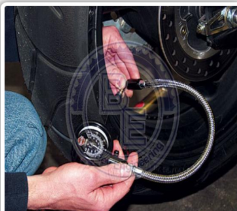
Tire Pressure Gauge