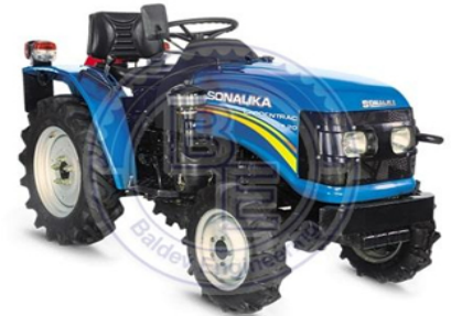
Sonalika DI 60 Sikander Tractor