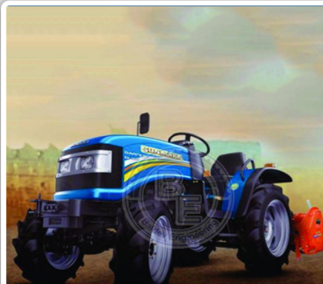
Sonalika GT 22 Tractor