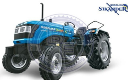
Sonalika DI 47 Sikander Tractor