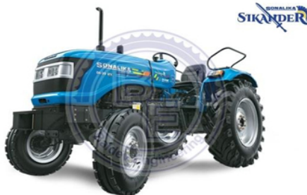
Sonalika DI 35 Sikander Tractor