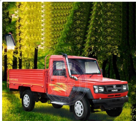
Force Motors Kargo King Truck