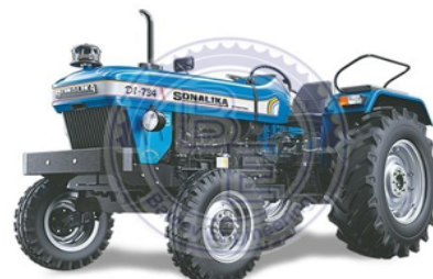
DI 734 Sonalika Tractors