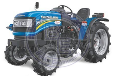
Sonalika WT 90 Tractor