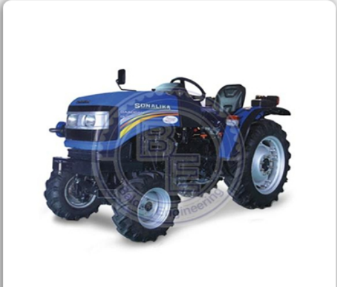
Sonalika DI 30 Baagban Super Tractor