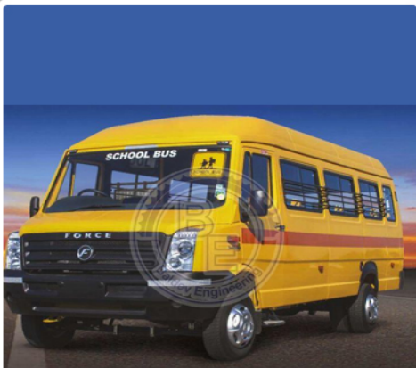
Force Motors Traveller School Bus