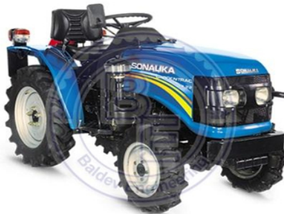
Sonalika WT 60 Sikander