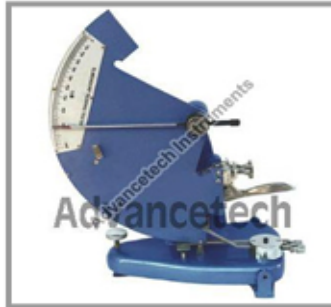
Elmendorf Tearing Resistance Tester