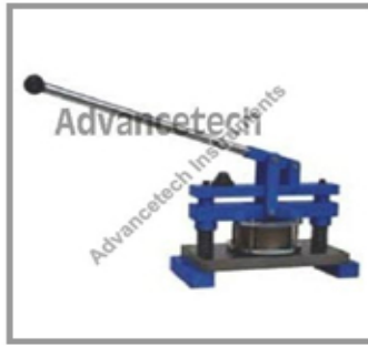
Paper Punch & Die Cutter