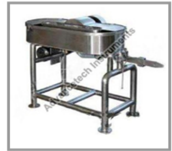
Lab Valley Beater