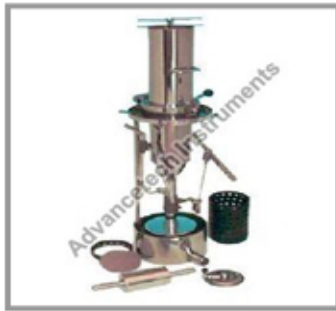
Hand Sheet Former