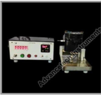
Oil Penetration Tester