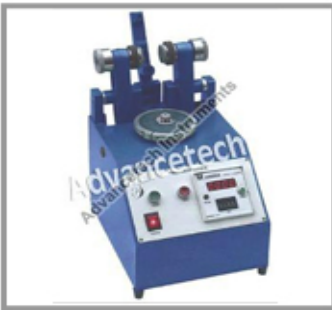
Martindale Abrasion Tester