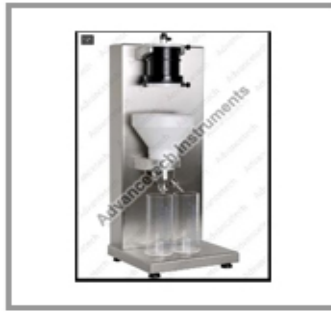
Canadian Freeness Tester