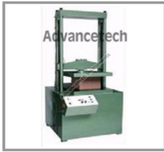
Box Compression Tester