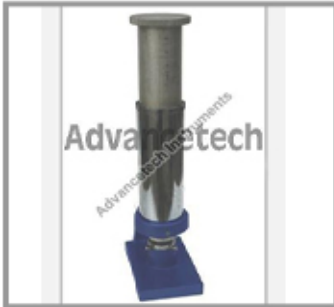
Gurley Type Smoothness & Porosity Tester