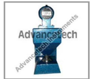
Digital Thickness Micrometer