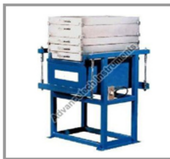
Wood Chip Classifier