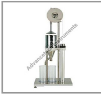
Consistency Determination Apparatus