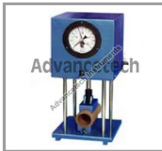
Digital Core Crusher