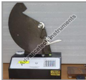
Digital Tearing Resistance Tester