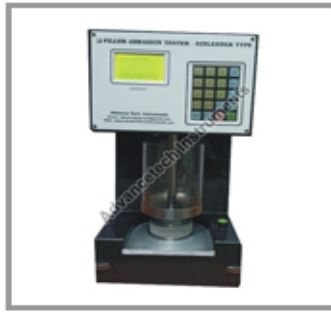
Filler Abrasion Tester