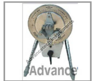
Taber Stiffness Tester