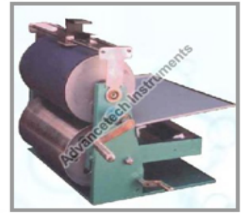
Patra Type Fluff Tester