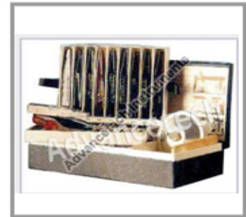
Surface Wax Stick