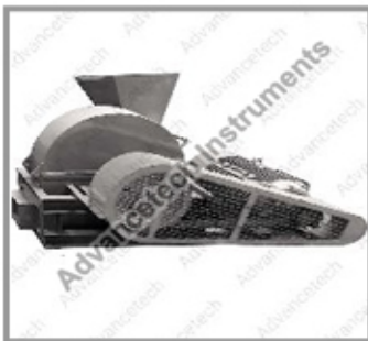
Wood Chipper Machine