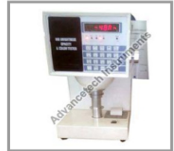
Digital Brightness Tester