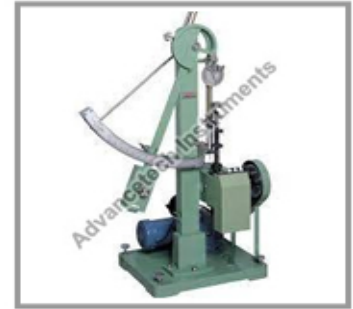
Schopper Type Tensile Tester