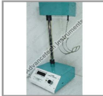
Digital GSM Tester