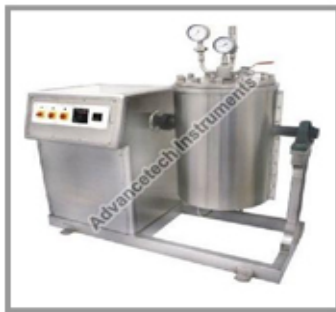
Laboratory Rotary Digester