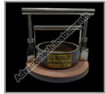
Cobb Sizing Tester