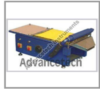
Air Knife Coater