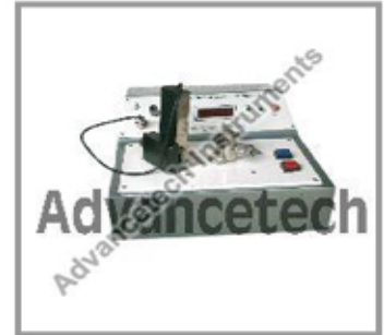
Digital Stiffness Tester