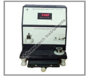
Digital Smoothness & Porosity Tester