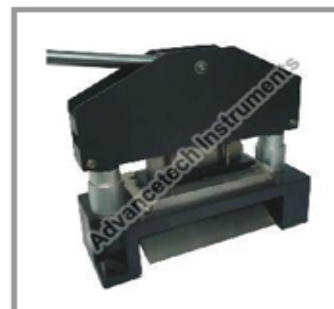
Manual Circular Cutter