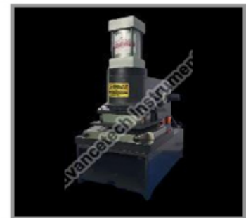
Pneumatic Square Cutter