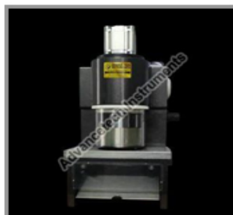
Pneumatic Circular Cutter