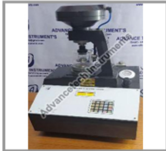
Digital Bursting Strength Tester