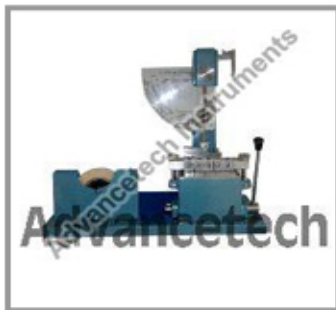
Ply Bond Tester