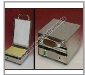
Rapid Sheet Dryer