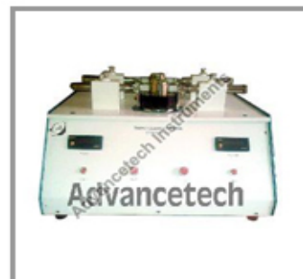
Folding Endurance Tester