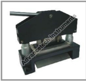
RCT Sample Cutter