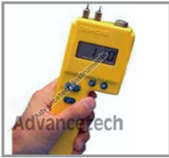
Hand Held Moisture Meter