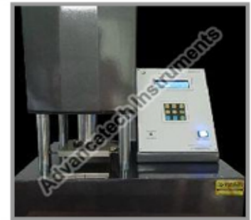
Digital Ring Crush Tester