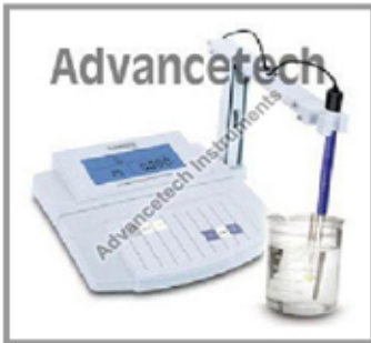
Digital PH Meter