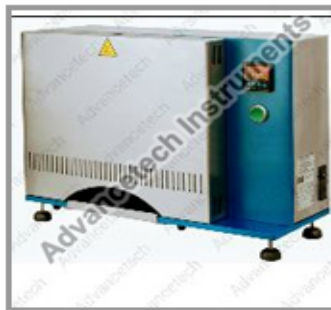
Concora Medium Fluter