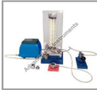
Bendtsen Smoothness Tester