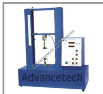
Vertical Tensile Tester