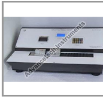
Horizontal Tensile Tester