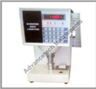
Photo Brightness Tester