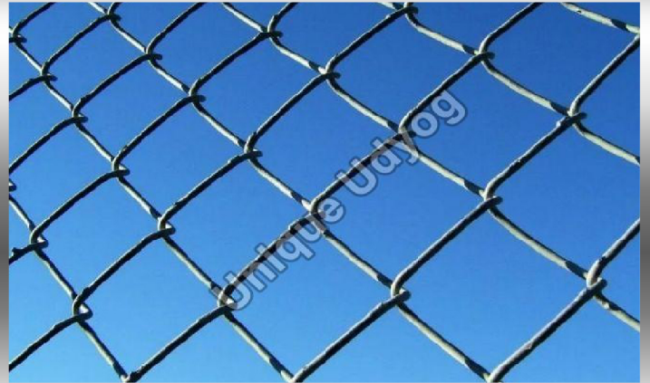
110 X 110MM CHAIN LINK FENCING