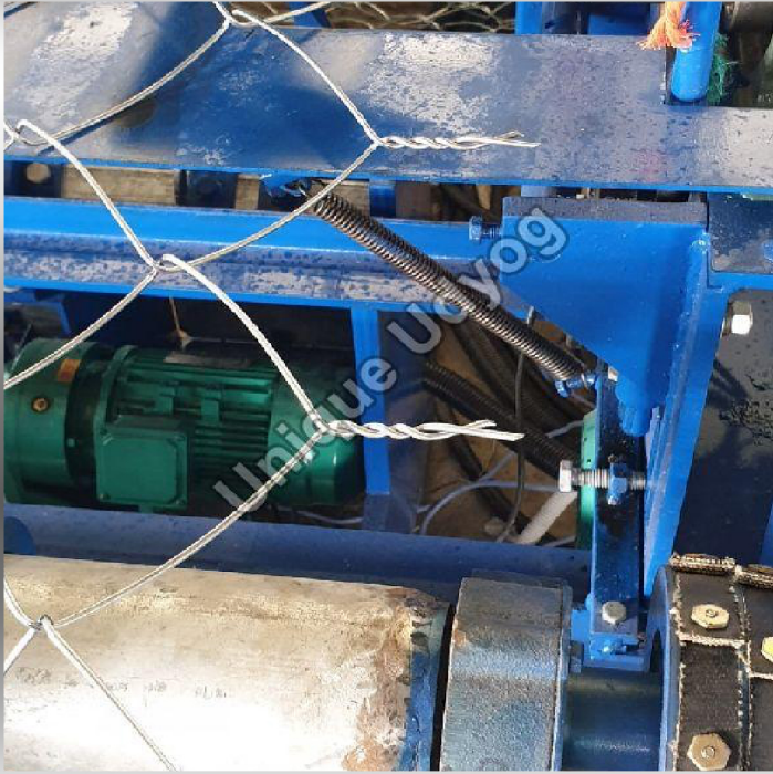
100 X 100MM GALVANIZED CHAIN LINK FENCING