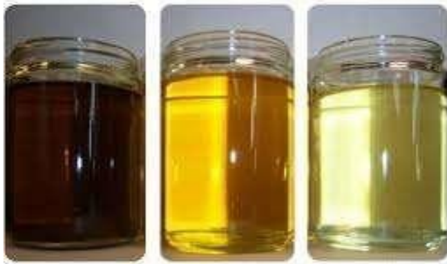
CRUDE → REFINED