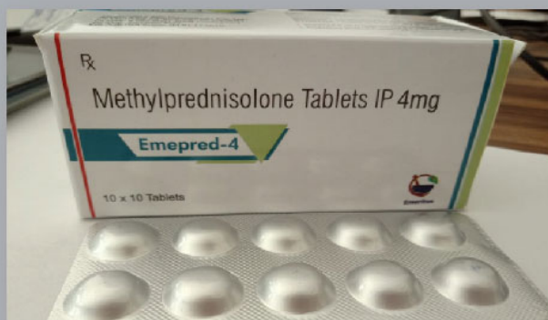
Emepred 4 Tablets