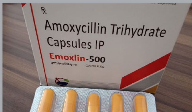
Emoxlin -500 Capsules

As Per Requirement 10X10 Alu Alu Anti-inflammatory /analgesic Tablets Allopathic