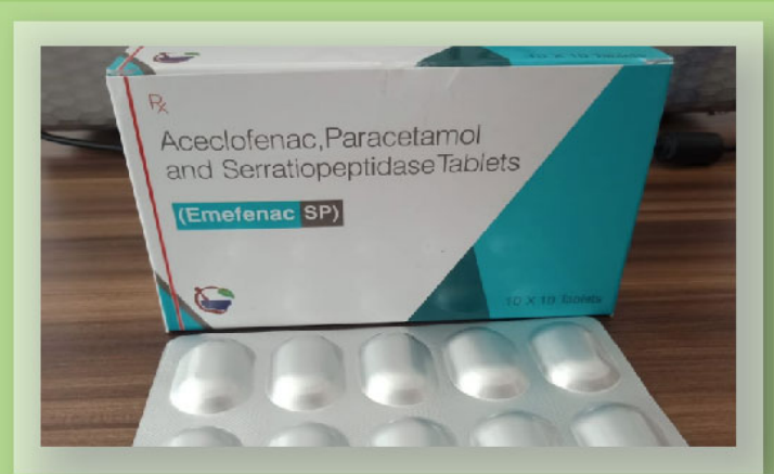
Emefenac SP Tablets

It is prescribed for fever, various kinds of pain and arthritis .