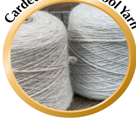
Carded Merino Wool Yarn