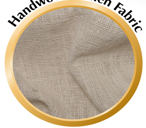
Handwoven Linen Fabric