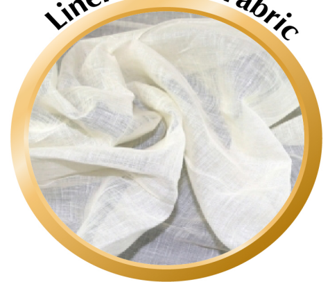
Linen Gauze Fabric