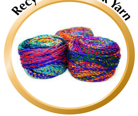
Recycled Sari Silk Yarn