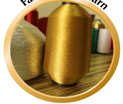
Fancy Textile Yarn