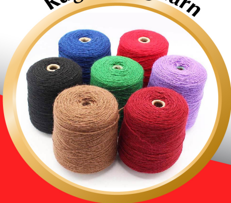
Rug Tufting Yarn