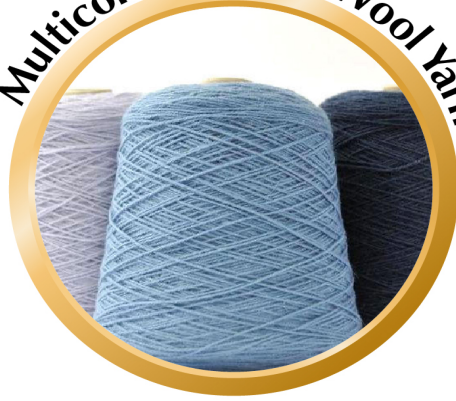
Multicolor Merino Wool Yarn