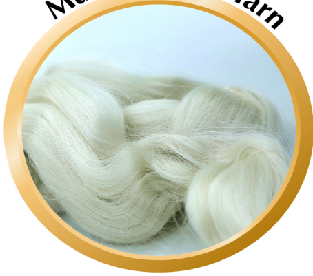
Mulberry Silk Yarn