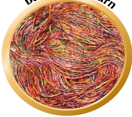
Banana Silk Yarn