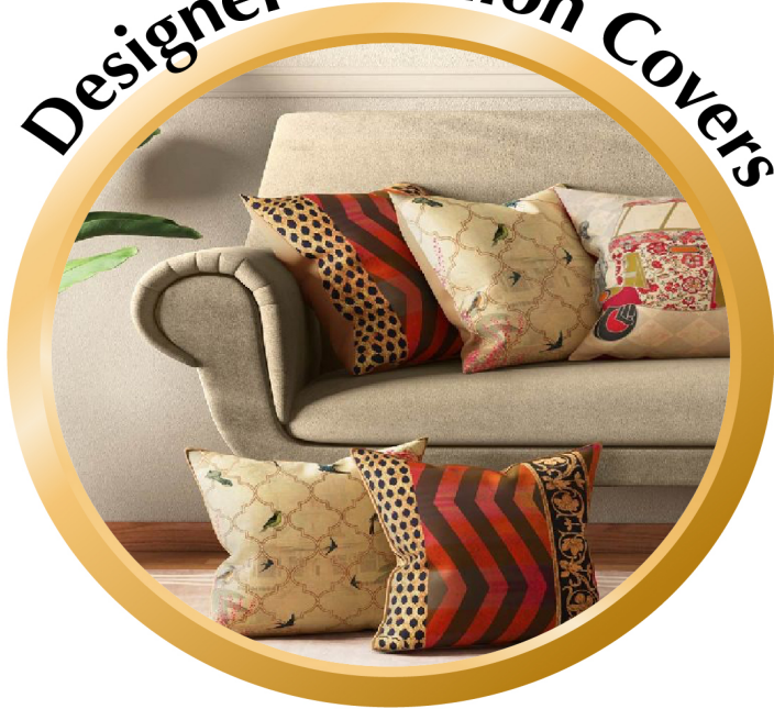
Designer Cushion Covers