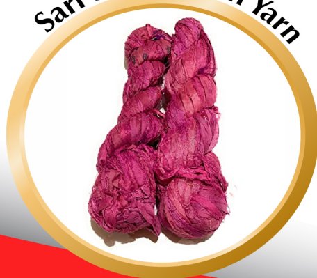
Sari Silk Ribbon Yarn