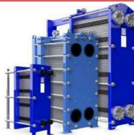
Plate Heat Exchanger - PES