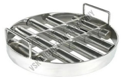
Round Hopper Magnet