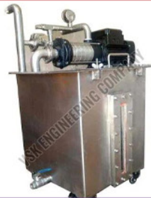
Stainless Steel Descaling Pump