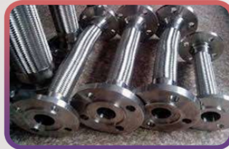
Rubber & SS wire braided hose Applications