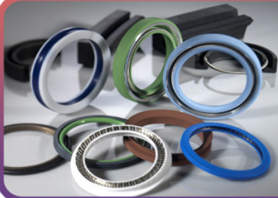
Mechanical seal and Lip seal