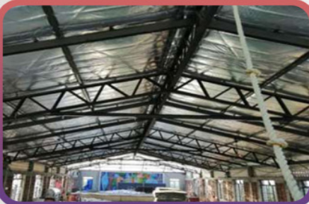
fabrication Aluminium shed