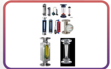
flow and rotameters