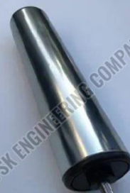
Mild Steel Conveyor Roller