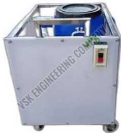
Single Phase Descaling Machine