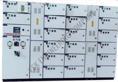
Power Distribution Panel Box