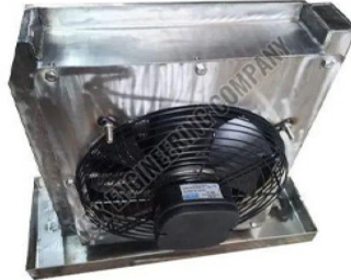
Hydraulic Oil Cooler