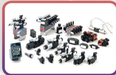
Supply Hydraulic Valve All Type With Fitting