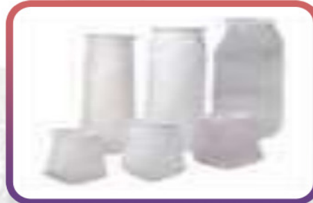
Dust Collector (Bag Houses)