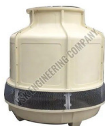
Water Cooling Tower