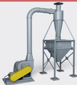
Cyclone Separator and dust collector system