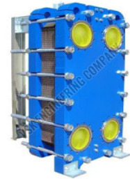
Mild Steel Plate Heat Exchanger