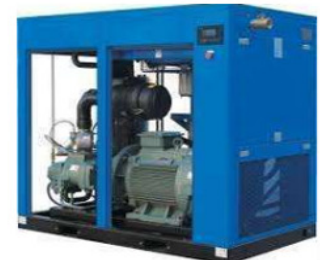
Reciprocating and screw compressor