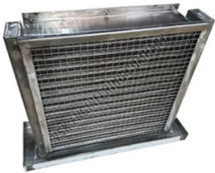
Stainless Steel Oil Cooler