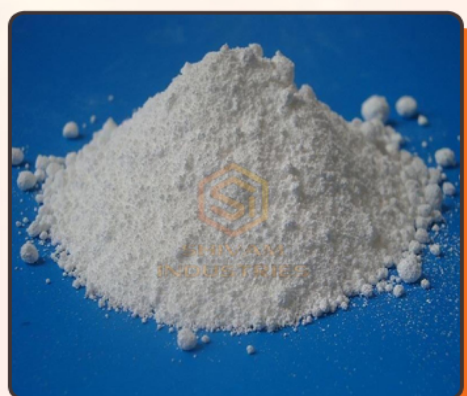
Zinc Chloride Powder