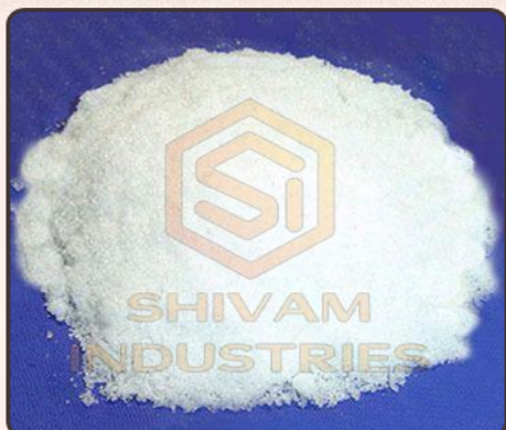
Aluminium Sulphate Powder