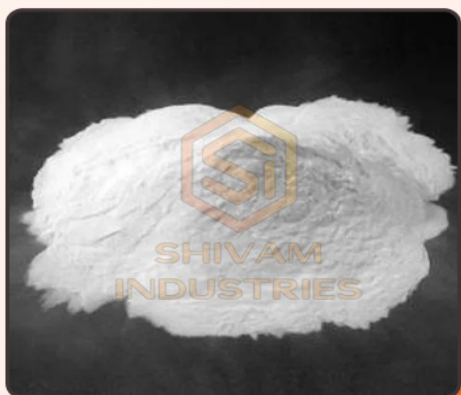
Potassium Acetate Powder