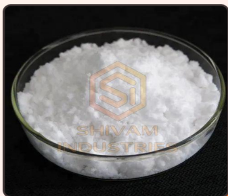
Sodium Formate Chemical Powder