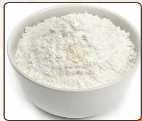
Magnesium Stearate Powder