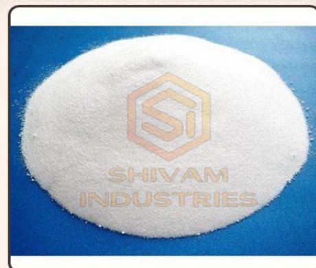
Zinc Sulphate Heptahydrate Powder