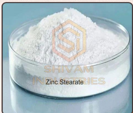
Zinc Stearate Powder