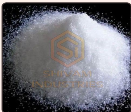
Ammonium Formate Powder