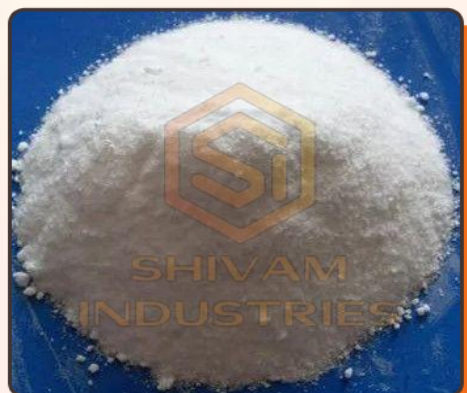
Sodium Thiosulfate Anhydrous Powder