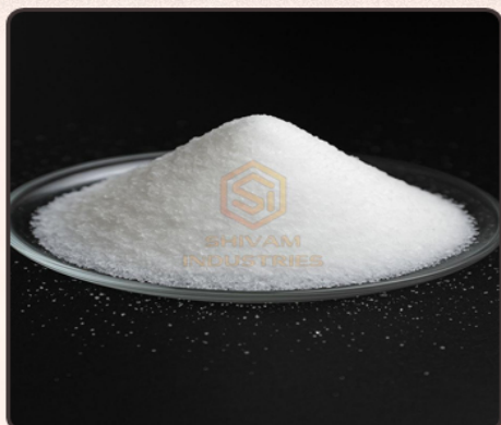
Mono Sodium Phosphate Powder