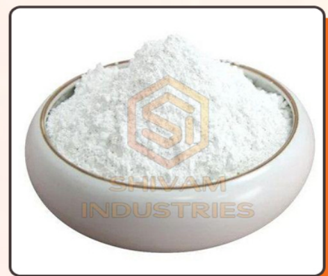
Calcium Carbonate Powder