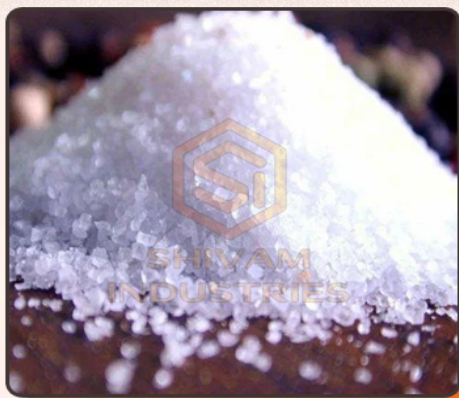
Sodium Thiosulfate Powder