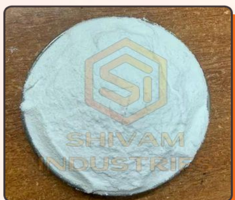
Zinc Carbonate Powder