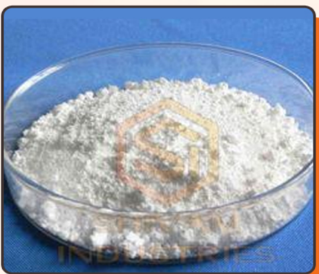
Barium Sulphate Powder