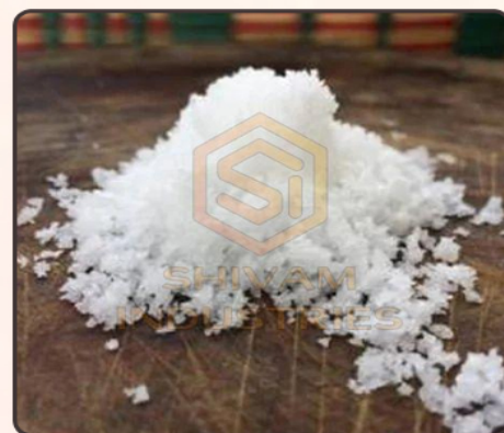
Potassium Bromide Crystal