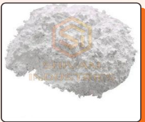
Barium Chloride Powder