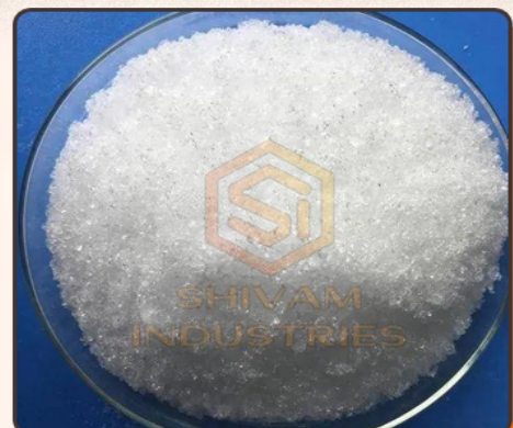
Sodium Acetate Crystal