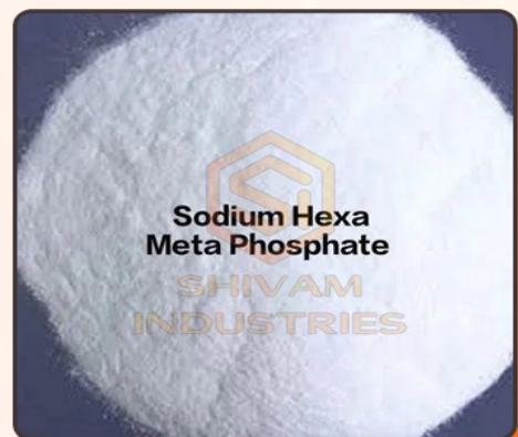
Sodium Hexametaphosphate Powder