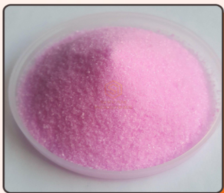
Manganese Chloride Powder