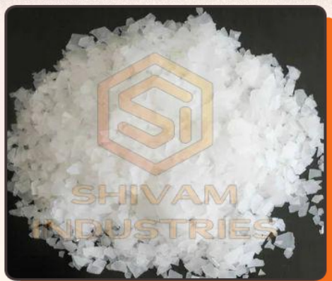
Magnesium Chloride Hexahydrate Crystal