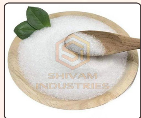
Ammonium Persulfate Crystel