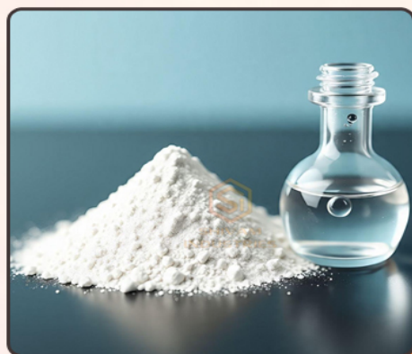
Laboratory Grade Potassium Hydroxide Powder