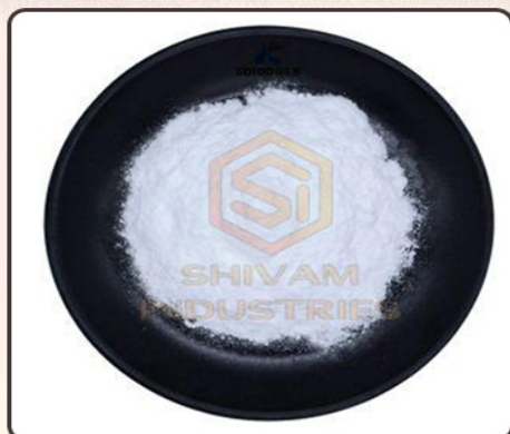
DI Sodium Phosphate Powder