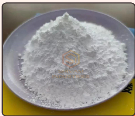
Calcium Acetate Powder