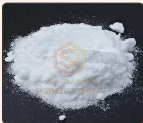
Sodium Formaldehyde Bisulfite Chemical Powder