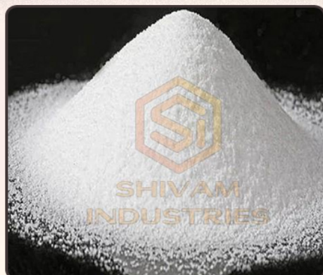
Zinc Oxide Powder