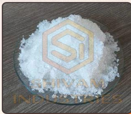
Sodium Thiosulfate Pentahydrate Chemical Powder