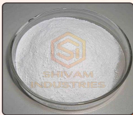
Trisodium Phosphate Powder