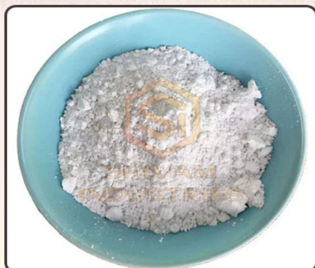
Calcium Stearate Powder