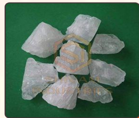
Potash Alum Crystal