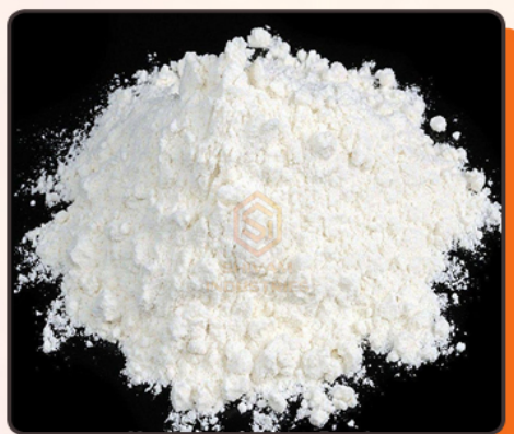
Magnesium Sulphate Powder