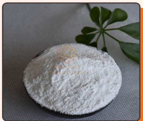
Calcium Chloride Powder