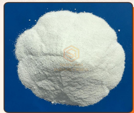
Sodium Thiosulphate Pentahydrate Powder