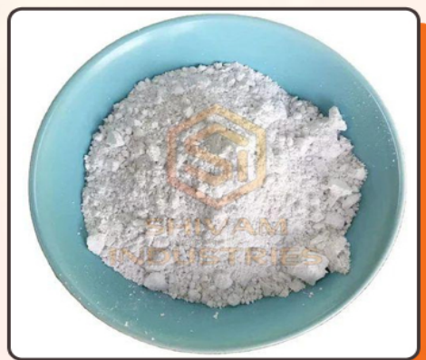
Calcium Hydroxide Powder