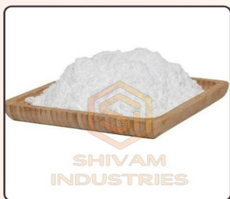
Potassium Iodate Powder