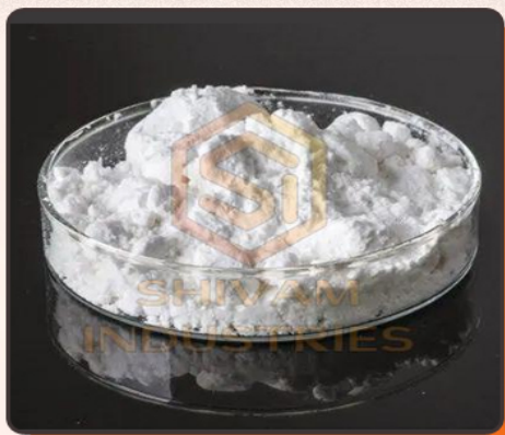
Magnesium Oxide Powder