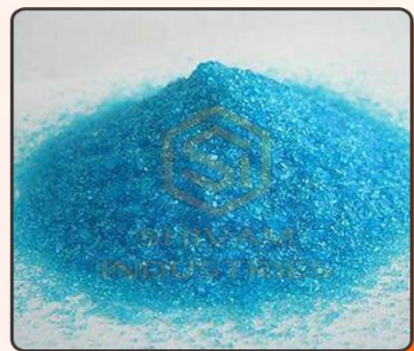
Cupric Chloride Powder