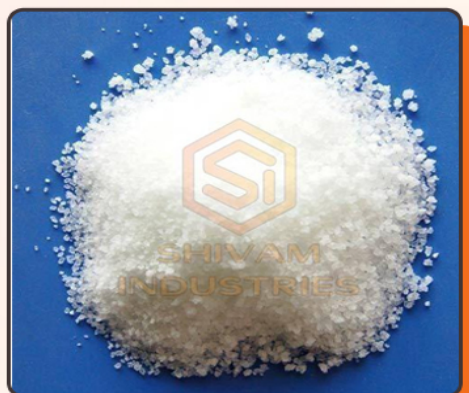
Sodium Per Sulphate Powder