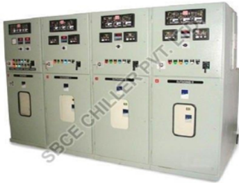
DG SET CONTROL PANEL