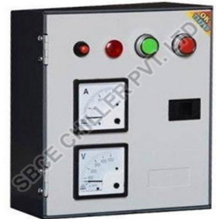
SINGLE PHASE MOTOR CONTROL PANEL