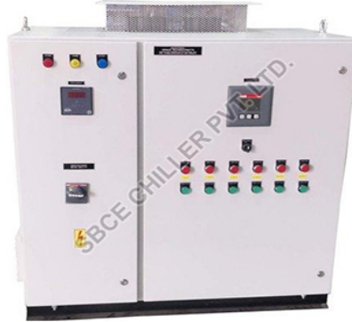
PLC CONTROL PANEL