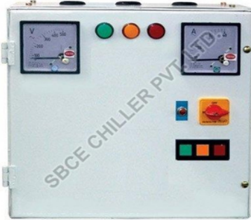
MOTOR STARTER CONTROL PANEL