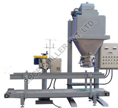
BAG FILLING MACHINE