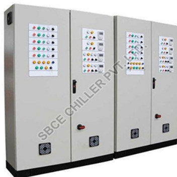
FRP MDI CONTROL PANEL