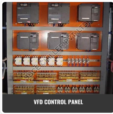
VFD CONTROL PANEL