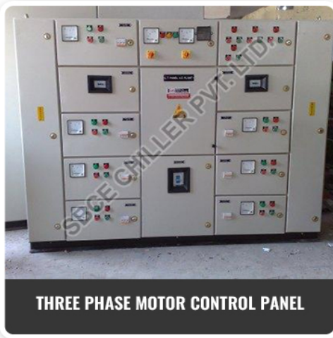
THREE PHASE MOTOR CONTROL PANEL