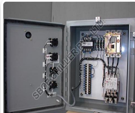
SUBMERSIBLE PUMP CONTROL PANEL