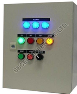
DOL STARTER CONTROL PANEL