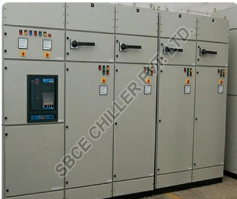
POWER FACTOR CONTROL PANEL