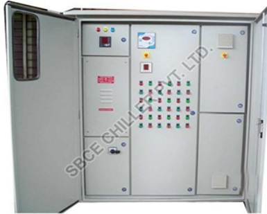
AUTOMATIC POWER FACTOR CONTROL PANEL