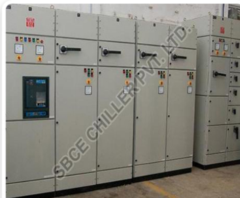
MAIN LT CONTROL PANEL