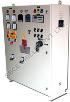
AMF CONTROL PANEL