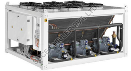
COLD STORAGE SYSTEM