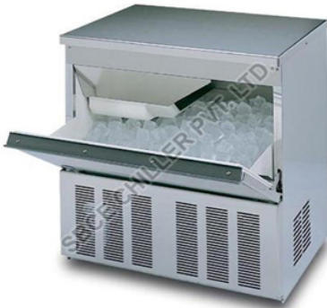
ICE MAKING MACHINE