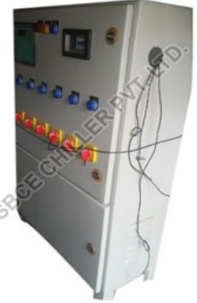
POWER DISTRIBUTION CONTROL PANEL