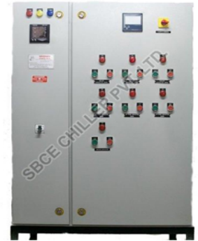
CAPACITOR CONTROL PANEL