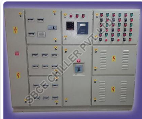
POWER FACTOR CORRECTION CONTROL PANEL