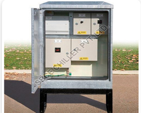
FEEDER PILLAR CONTROL PANEL