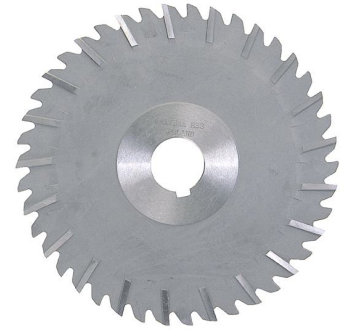
Staggered Teeth SCCS