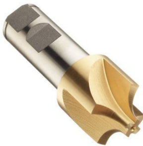
Corner Rounding Cutter