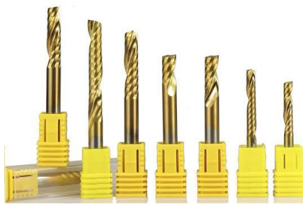
Single Flute Endmill