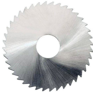
Slitting Saw Ground Teeth