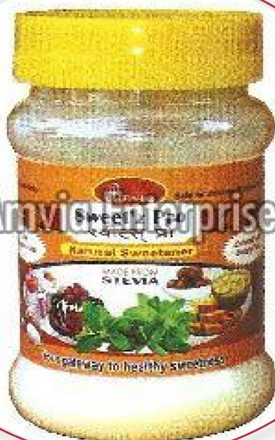
AMVIA NATURAL SWEETENER