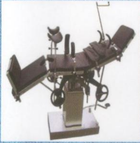
O T TABLE