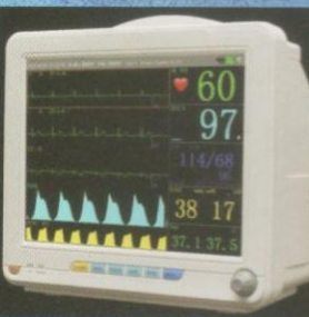
MULTI PARA MONITOR