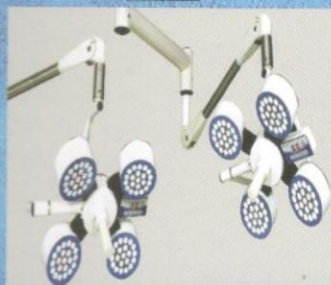
O T LIGHTS