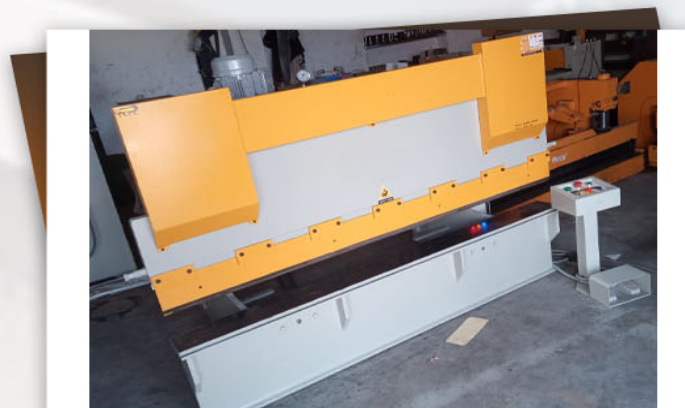
MINI HYDRAULIC PRESS BRAKE MACHINE