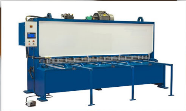
HYDRAULIC SHEARING MACHINE