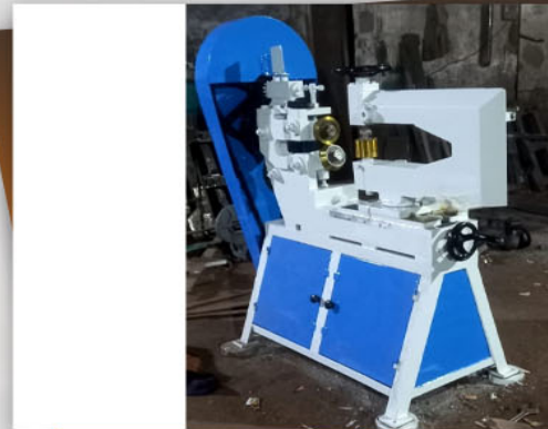
CIRCEL CUTTING MACHINE