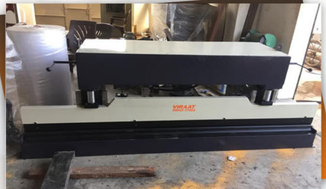
HYD HAND LIVER PRESS BRAKE