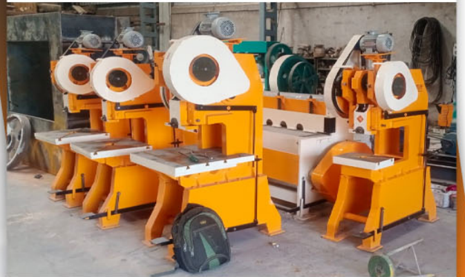
POWER PRESS MACHINE