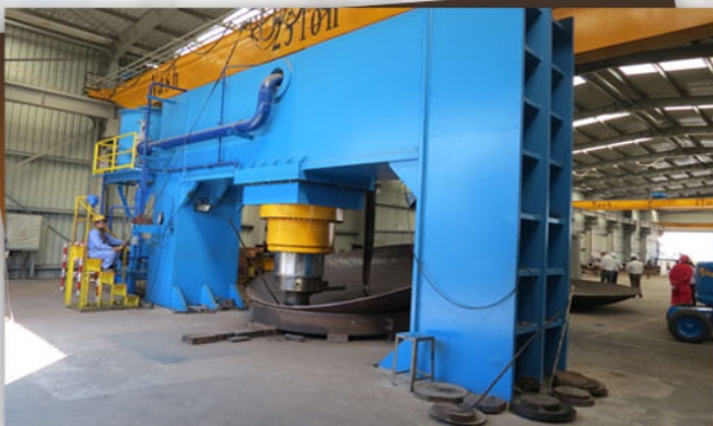
DISH END PRESS