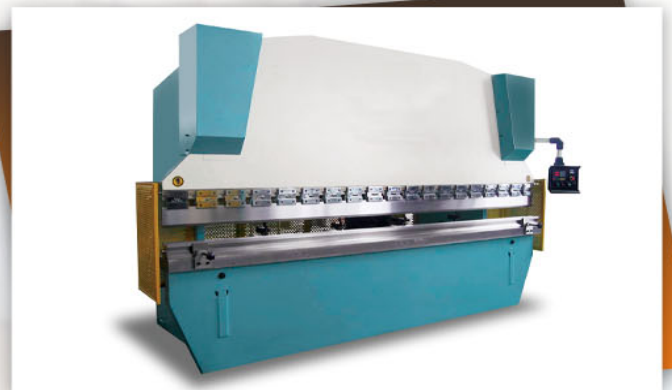
HYDRAULIC PRESS BRAKE MACHINE