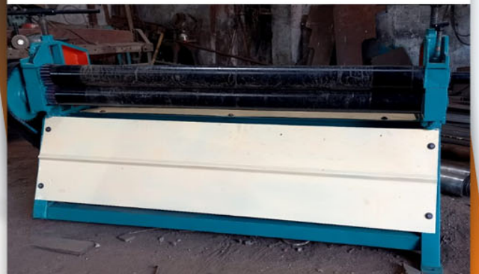
SPLIT TYPE PLATE ROLLING MACHINE