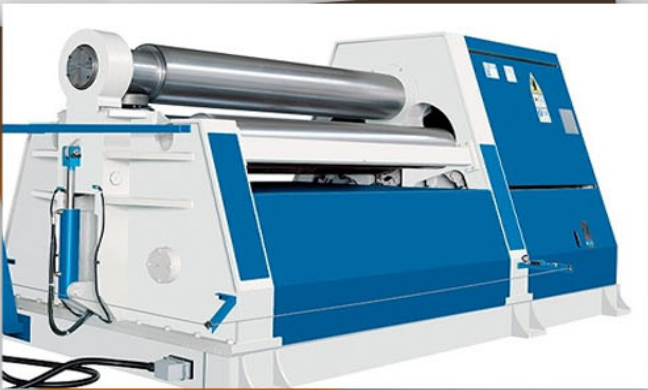
HYDRAULIC 3 ROLLS PLATE BENDING MACHINE