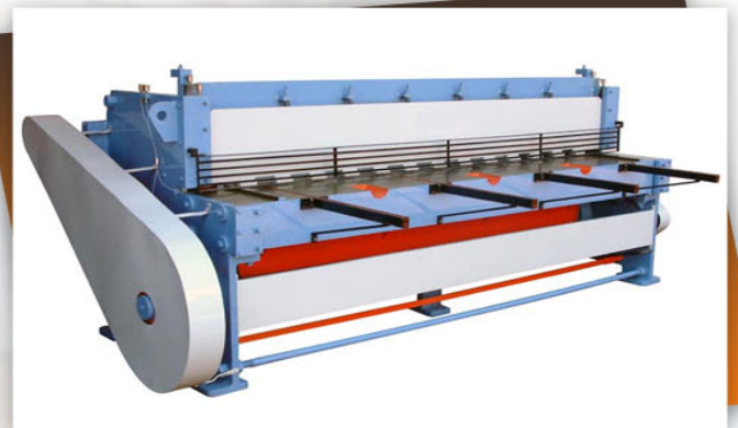
MECHANICAL SHEARING MACHINE