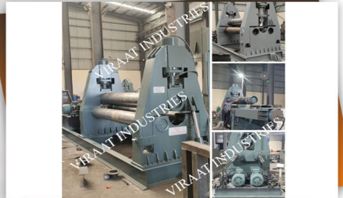
HYDRO-MECHANICAL TYPE PLATE ROLLING MACHINE