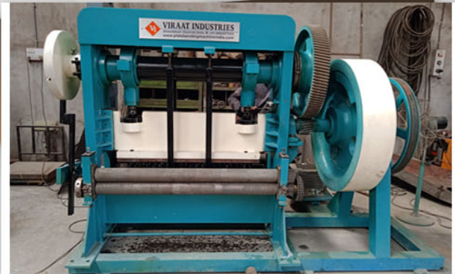
CABLE TRAY PUNCHING MACHINE