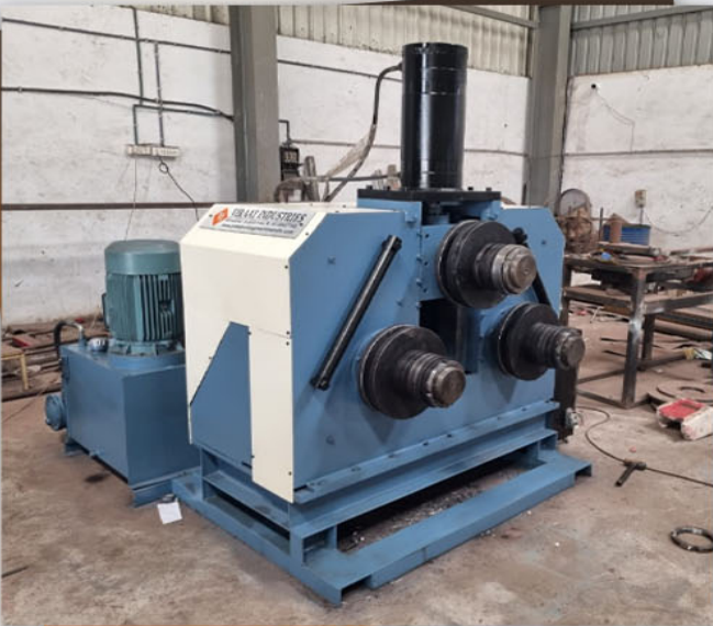
SECTION (PIPE) BENDING MACHINE