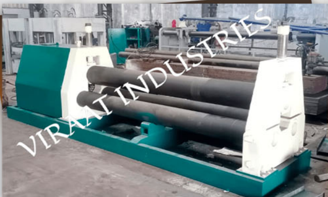
MECHANICAL PLATE ROLLING MACHINE