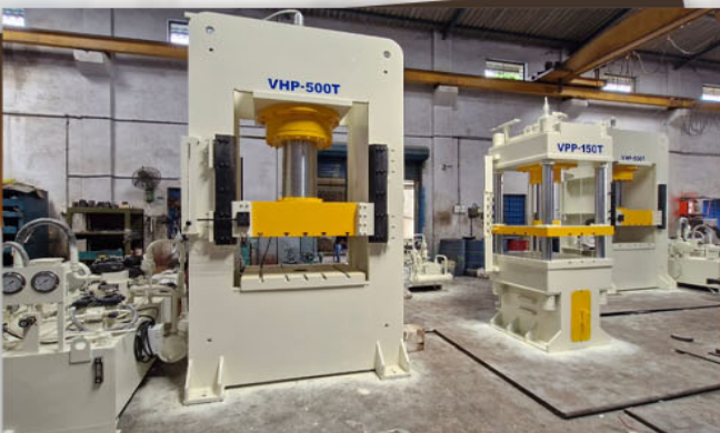
HYDRAULIC H TYPE PRESS MACHINE