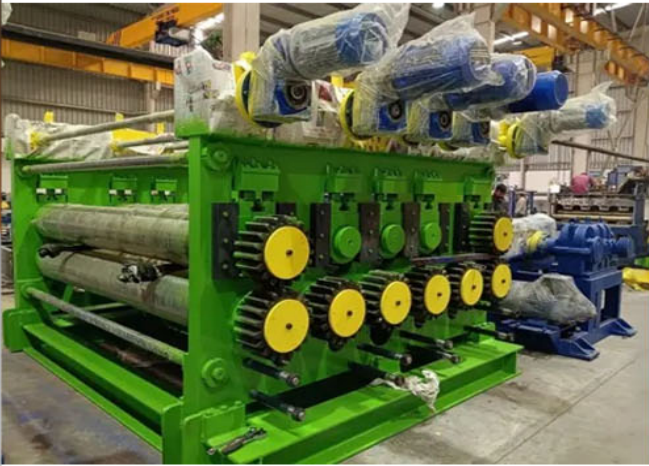
PLATE STRAIGHTENING MACHINE