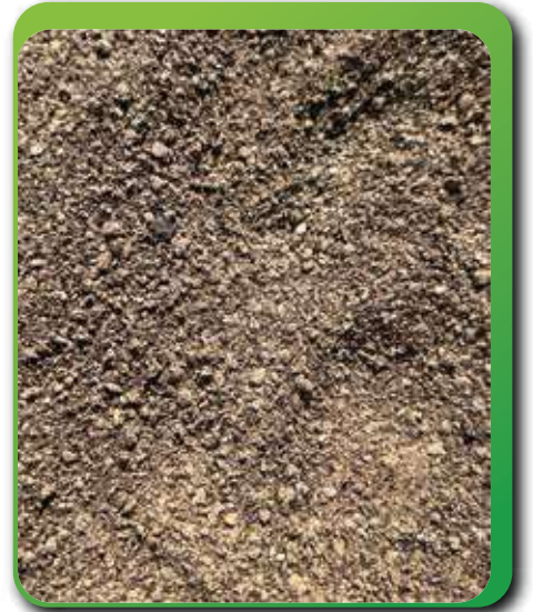
CASTOR OIL CAKE