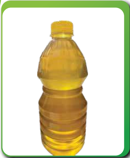
CASTOR OIL COMMERICAL