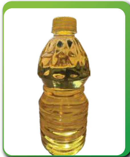
CASTOR OIL FSG

Castor oil is indispensable in the production of organic derivatives and is widely used in paints, industrial agents, and dispersing agents. Shree Ambika Global excels in producing industrial-grade castor oil, characterized by its high concentration of ricinoleic acid (approximately 87%). Our proprietary extraction technique—featuring advanced methods and precise control of temperature and steam—ensures the highest quality oil. The resulting castor oil cakes are valuable byproducts of our process, forming an essential part of our product line. Our unique processing approach guarantees a consistent, high-quality output with minimal residue.