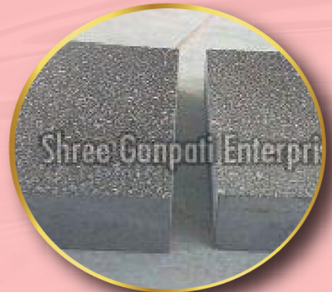
Polishing Basalt Bush Kota Stone Tiles