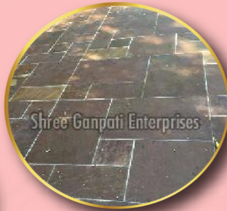
Red Mandana Kota Stone Tiles