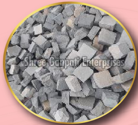
Basalt Cobbles Kota Stone