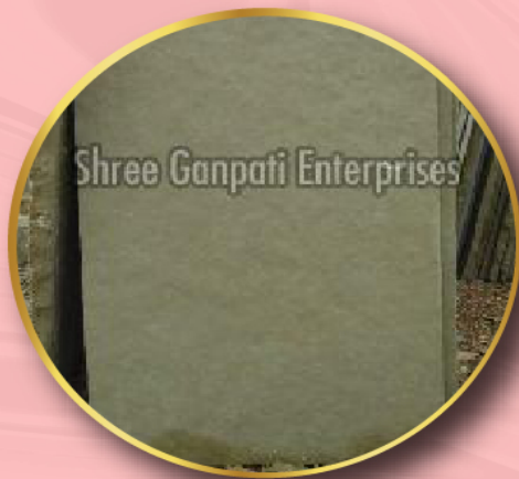
Natural Brown Kota Stone Tiles