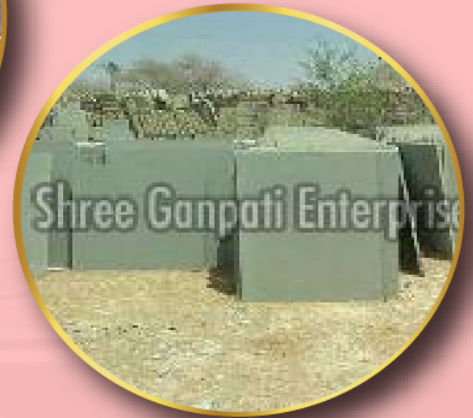
Natural Grey Kota Stone Tiles