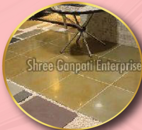
Brown Kota Stone Tiles