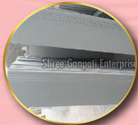
Grey Polished Kota Stone Tiles