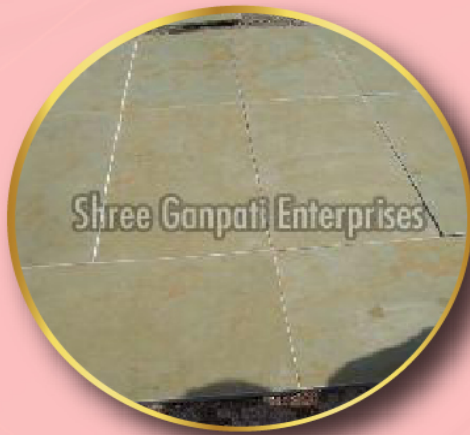
Brown Kota Stone