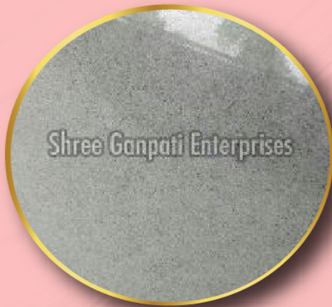
Blue Kota Stone Tiles