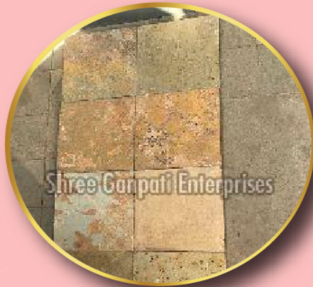
Brown Honey Kota Stone Tiles