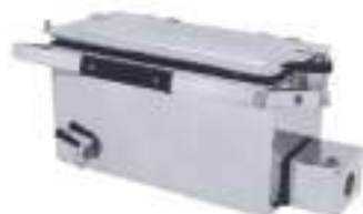
LI - 7640 INSTRUMENT STERILIZER ELECTRIC (S.S)

Hospital standard foot pedal operated, waste bin in stainless steel. Bin shall be cylinder shape -250-350mm diameter, height 400 - 550mm, Inner bucket (Bin) stainless steel to have - fold out handle.