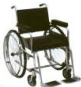
LI - 7805 WHEEL CHAIR NON- FOLDING

Frame made of CRCA steel tubes Fixed Arm - rest and Foot-rest 18" Seat and Back -rest. Seat belt On 125 mm front casters On 650 mm rear wheel with brakes Dimension: 1050 L x 650 W x 900 H mm approx Pre-treated and Epoxy Powder Coated