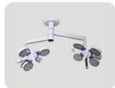
LI - 8030 LED 4 + 3