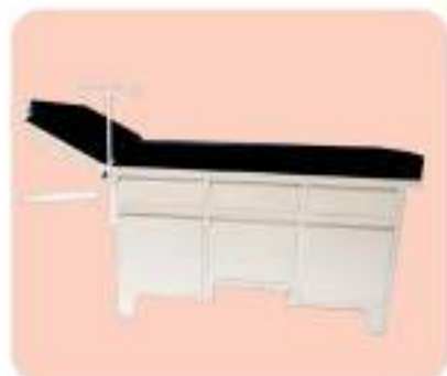
LI - 7855 EXAMINATION CUM GYNAE TABLE

Made of CRCA pipes/ sheets, adjustable back rest by a pneumatic pump with Head side a dimension of 45L x 51W cms, Main frame dimension of 138L x 51w cms, upholstered / padded with foam top in high quality washable revere, provided with two/three drawers right under the top section with cabinet with doors under the drawers for storage, fold-able BP apparatus tray on the Head side along with foot stand, Pre-treated powder coated. Dimension: 187Lx 51Wx 81H cms.