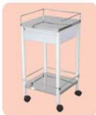
LI- 7235 Intrament Trolley (SS)

Made of CRCA 16SWG pipes/ flats, on 5cms castors, with laminated height adjustable wooden-top with a dimension of 30"x16". Pre-treated powder coated. Dimension: 42" L x 16" W x 39" H.