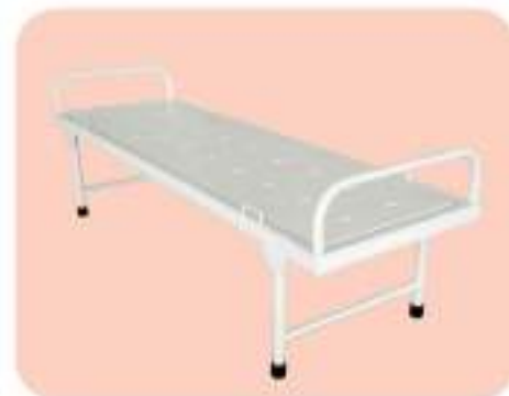
ATTENDANT'S BED - 6520

Frame made of rectangular CRCA pipes CRCA perforated sheet top head and foot bows made of CRCA pipes with vertical supports bed mounted on rubber stumps swing/drop down side railing pre - treated powder coated Dimension: 137 L x 76 W x 60 H cms (Approx).