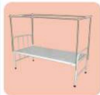
LI - 7915 MOSQUITO NET POLES