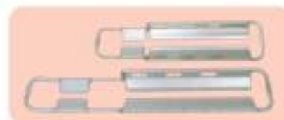
LI - 7435 SCOOP STRETCHER