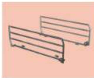
LI - 7910 COLLAPSIBLE SIDE RAILINGS