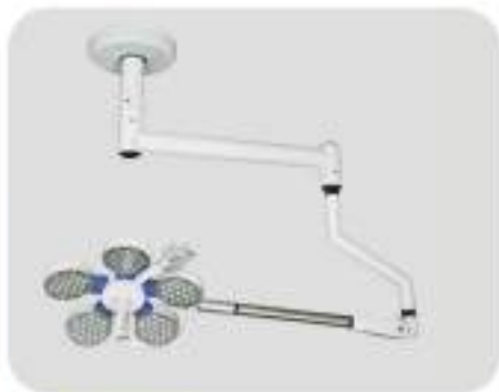
LI - 8025 LED 5