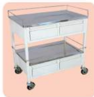
LI - 7240 MEDICINE TROLLEY

Stainless Steel frame Two S/S shelves guard rail at top shelf 4 castors Overall dimensions of 455mm x 455mm x 860mm (L x W x H)