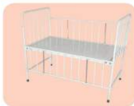
PEDIATRIC BED - LI - 6510

Frame made of rectangular CRCA pipes CRCA perforated sheet top head and foot bows made of CRCA pipes with vertical supports bed mounted on rubber stumps swing/drop down side railing pre - treated powder coated Dimension: 137 L x 76 W x 60 H cms (Approx).