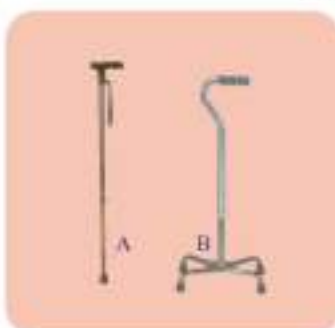
LI - 7935 INVALID'S STICKS