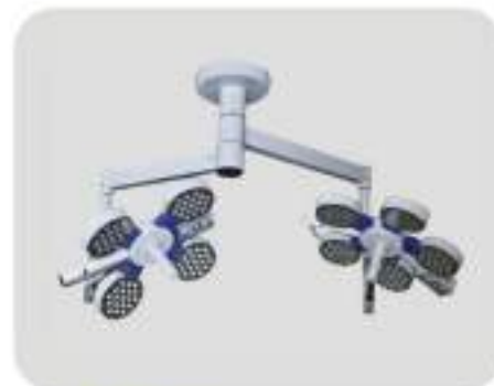
LI - 8025 LED 5 + 4

Frame made of CRCA rectangular pipes, ABS Platform with back-rest, knee-rest, Trendelen - burg's and reverse Trendelen-burg's position, Hi-Lu(high-low) height adjustable positions can be adjustable by actuator operated by hand-held remote control system along with ACP/CPR function, Length adjustable imported ABS panel / head and leg bows , imported side railing, provided with one number IV/ saline rod with provision for fixing IV/ saline stand at four corners of the bed frame , provided with rubber buffers on four corners , bed mounted On 15cms diameter castors which two with brakes. The bed pre-treated and powder coated. Dimension: Size 203 L x 90 W x 55-75 H cms (Approx).