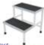
LI - 7165 FOOT STEP (DOUBLE) Made from CRCA pipes/sheets, Rubber matted top On PVC/rubber stamps Pre-treated powder coated. Dimension: 18" Lx18"W x 18"H.