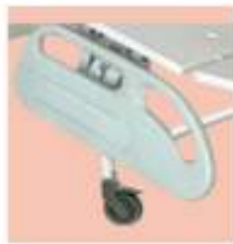
LI - 7905 ABS RAILING