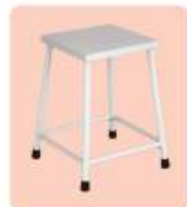
LI - 7430 VISITOR'S STOOL

Made from CRCA pipes/sheets, on PVC/rubber stamps. Pre-treated powder coated. Dimension: 18" L x 18" W x 18" H.