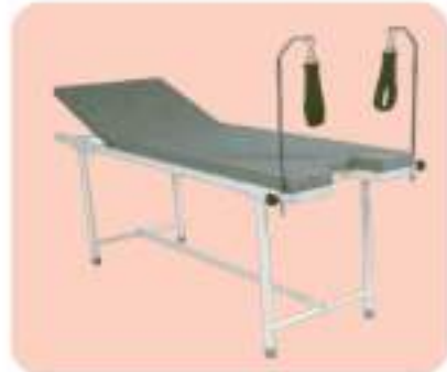
LI - 7860 EXAMINATION TABLE (TWO SECTION)

Made of CRCA 16 SWG pipes/18SWG sheets, two section top, head section adjustable on ratchet, on rubber/PVC stamps. Provided with suitable mattress. Dimension: 1830Lx 600Wx 700H cms.