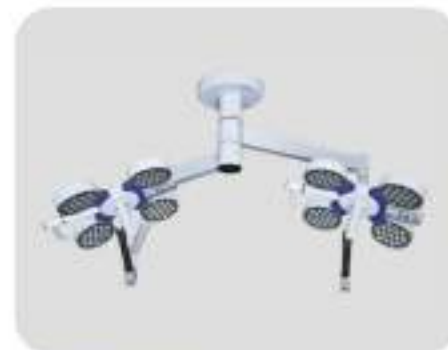
LI - 8035 LED 4 + 4