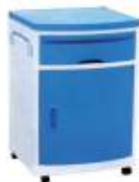
LI - 7470 BED SIDE LOCKER (ABS)

Made of CRCA pipes/sheets closed on three sides provided with one storage box SS/ laminated top on PVC/ rubber stamps. Pre - treated powder coated finish. Dimension: 16"Lx 16"Wx 32"H.