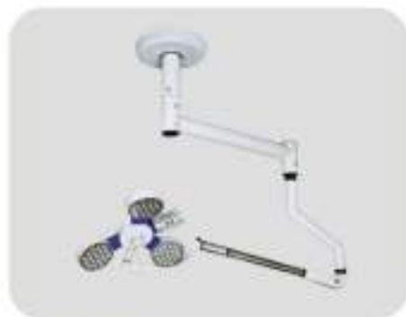
LI - 8035 LED 3