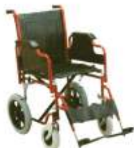
LI - 7815 WHEEL CHAIR (FOLDING)