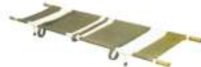
LI - 7515 FOLDING STRETCHER (CANVAS) Double Fold aluminium Tube along with Carry Bag. Size: 213L x 56W x 15H cms