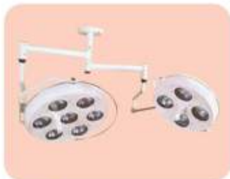
LI - 8001 SURGICAL LIGHT RILLIANCE - 7+4 - C