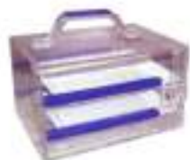
LI - 7970 FORMALIN CHMBER TWO TRAYS

A - 12"x7"x6" (TWO TRAYS) B- 14"x8"x6" (TWO TRAYS)