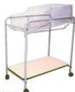
LI - 7680 BOX BIRTHING

Prepex transparent crib with mattress Trendlenburg / Reverse trendlenburg. 5 cms castors I.V. rod Pretreated & epoxy powder coated