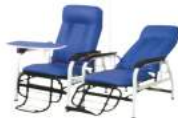
LI - 7505 DIALYSES CHAIR (STD) • Open size: 70 x 77 x 108 cms • Frame work made of MS tubes • The fabric is pressed PVC artificial leather • Three angles adjustable with rotatable Arm • One side basket and one IV Rod will be provided • Finish: Epoxy Powder Coated Optional: The chair with stainless steel frame work