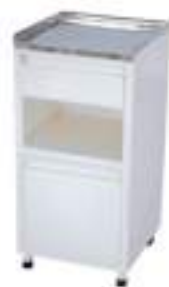
LI - 7460 BED SIDE LOCKER (DELUXE)

Made of CRCA pipes/ sheets closed on three sides. One storage box and one draw. Provided with SS/ laminated top, on two 5 cms dia swiveling castors two PVC/ rubber stamps. Pre - treated powder coated finish. Dimension: 16"Lx 16"Wx 32"H.