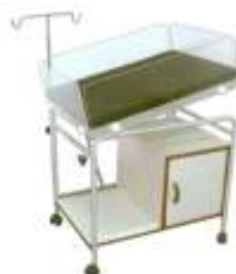
LI - 7675 BOX BIRTHING (with Utility Box)

Fast cycle time, 19 litre capacity. (Electric ) Automatic shut off at the end of both the sterilization and dry cycles Long life electro polished chamber and door. Double safety locking device prevents door from opening while chamber is pressurized. Drain valve for quick and easy draining of water reservoir Self action thermostat