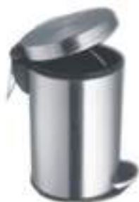
LI - 7635 WASTE BIN

Hospital standard foot pedal operated, waste bin in stainless steel. Bin shall be cylinder shape -250-350mm diameter, height 400 - 550mm, Inner bucket (Bin) stainless steel to have - fold out handle.