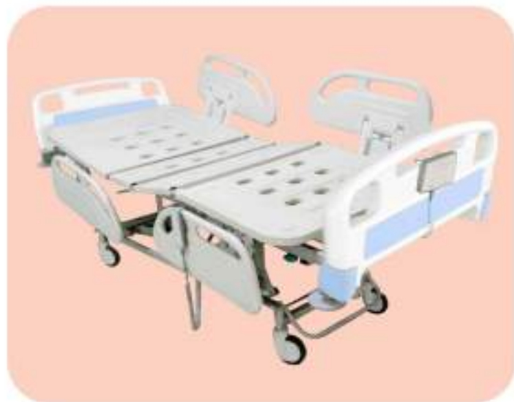
ICU BED ELECTRIC WITH MOLDED ABS PANEL , MOLDED ABS RAILING, MOLDED PLATFORM, ACP/CPR MANUAL AND CENTRAL /DIAMENTIONAL LOCKING CASTOR LI - 6201

Frame made of CRCA rectangular pipes, ABS Platform with back-rest, knee-rest, Trendelen - burg's and reverse Trendelen-burg's position, Hi-Lu(high-low) height adjustable positions can be adjustable by actuator operated by hand-held remote control system along with ACP/CPR function, Length adjustable imported ABS panel / head and leg bows , imported side railing, provided with one number IV/ saline rod with provision for fixing IV/ saline stand at four corners of the bed frame , provided with rubber buffers on four corners , bed mounted On 15cms diameter castors which two with brakes. The bed pre-treated and powder coated. Dimension: Size 203 L x 90 W x 55-75 H cms (Approx).