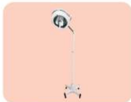
LI - 8010 SURGICAL LIGHT BRILLIANCE - 20 - M