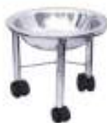
LI - 7170 KICK BUCKET (SS) Made of SS pipes on 5cms castors, provided with 35 cms dia SS basin. Dimension : 12"Dx 14"H.