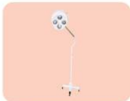
LI - 8020 SURGICAL LIGHT BRILLIANCE - 4 - M