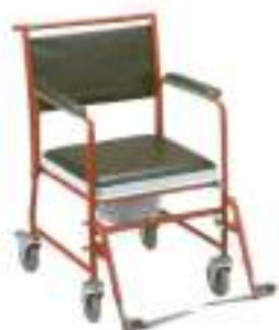
LI - 7810 WHEEL CHAIR (FOLDING)

Frame made of steel Foldable, seat/ back rest made of Leatherette / Fabric Rear wheel 610 mm, front caster 220 mm Seat dimensions 430 W x 400 D mm Fixed arm -rest Aluminium Foot rest etc