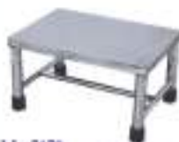
LI - 7179 FOOT STEP (SINGLE) Made from SS pipes/sheets, Rubber matted top, On PVC/rubber stamps Stainless Steel frame Dimension: 18" Lx 9"W x 9"H.