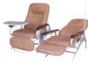
LI - 7500 DIALYSES CHAIR (DLX) • Open size: 75 x 84 x 105 cms • Frame work made of MS tubes • The fabric is pressed PVC artificial leather • Three angles pre-adjustable with rotatable Arm • One side basket and one IV Rod will be provided • Finish: Epoxy Powder Coated Optional: The chair's angle adjustable by electrically