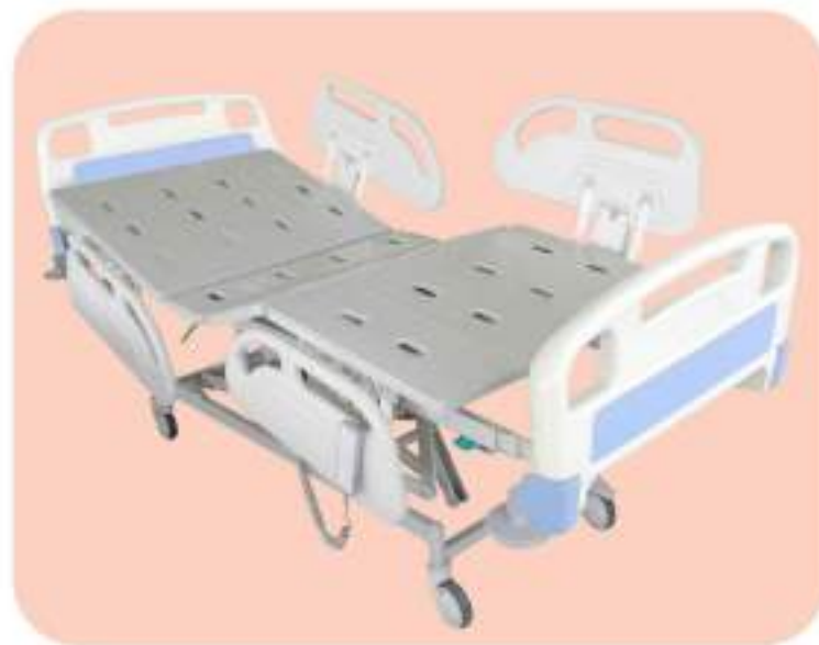
ICU BED ELECTRIC WITH MOLDED ABS PANEL, MOLDED ABS RAILING, MOLDED PLATFORM AND CPR MANUAL