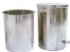
LI - 7625 WASTE RECEPTACLE (S.S)