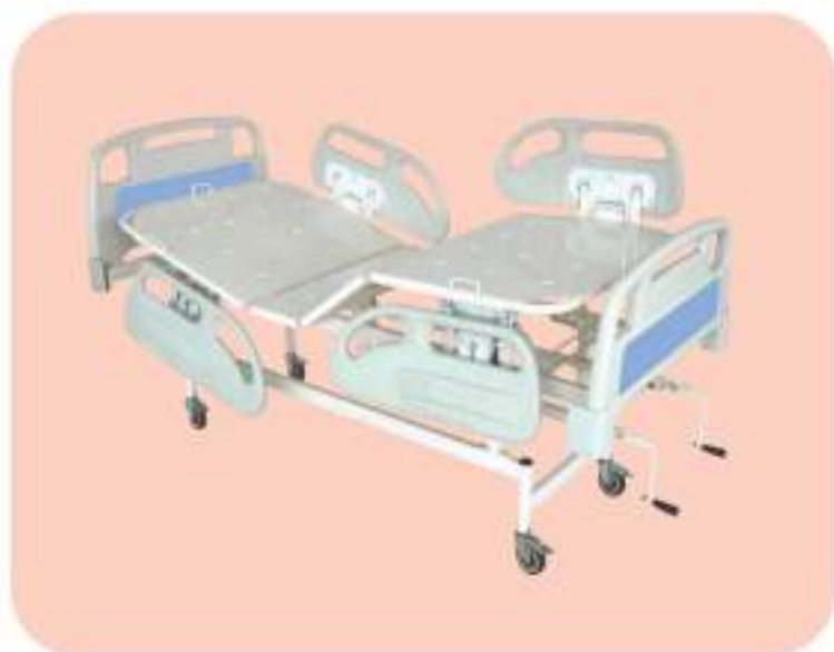
ICU BED (MECHANICAL/ABSPR) LI- 6210

Frame made of 16 SWG CRCA rectangular pipes, four section perforated CRCA sheet top made of 18SWG, suitable adjustable back rest, knee rest, Trendelenburg's, Reverse Trendelenburg's height adjustable (High - Low) from foot end by separate screw mechanisms, ABS molded head and foot bows, ABS molded side railing. Bed mounted on 15cms swiveling castors (two with brakes), provided with one number SS I V Rod, provision for engaging IV Rod on the frame. Pre treated and powder coated. Dimension: 203 L x 90 W x 60 H cms ( Approx).