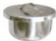
LI - 7615 LOTION BOWL (S.S)