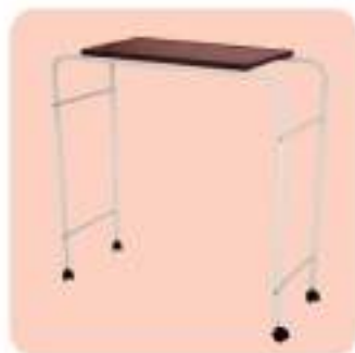
LI - 7225 OVER BED TABLE

Made of CRCA 16SWG pipes/ flats, On 5 cms castors, Fixed / Twin Stand Laminated wooden-top with a dimension of 30"x16", Pre-treated powder coated. Dimension: 42" L x 16" W x 39" H.