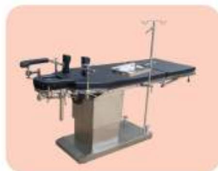
LI - 8050 MOTORISED OPHTHALMIC OPERATING TABLE

Frame made of 16 SWG CRCA rectangular pipes, four section perforated CRCA sheet top made of 18SWG, suitable adjustable back rest, knee rest, Trendelenburg's, Reverse Trendelenburg's height adjustable (High - Low) from foot end by separate screw mechanisms, ABS molded head and foot bows, ABS molded side railing. Bed mounted on 15cms swiveling castors (two with brakes), provided with one number SS I V Rod, provision for engaging IV Rod on the frame. Pre treated and powder coated. Dimension: 203 L x 90 W x 60 H cms ( Approx).