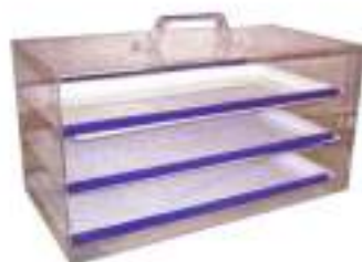
LI - 7975 FORMALIN CHMBER(THREE TRAYS)

A - 12"x7"x6" (TWO TRAYS) B- 14"x8"x6" (TWO TRAYS)