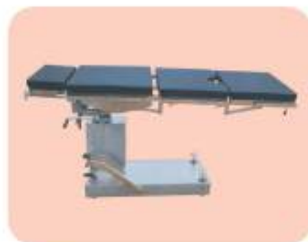
LI - 8060 HYDRAULIC OPERATING TABLE (C-ARM COMPATIBLE)