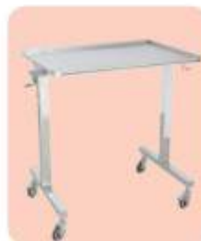
LI - 7210 INSTRUMENT TROLLEY MAYO'S S.S. WITH GEAR SYSTEM

Made of CRCA 16 SWG pipes. Height adjustable by gear system on either-side stands, On 10cms castors provided with SS tray. Dimension: 91L x 50W cms. Stainless Steel.