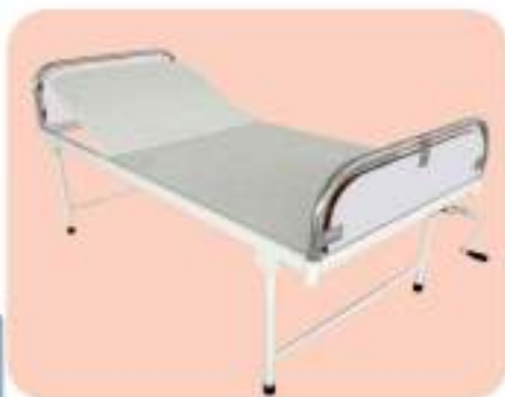
SEMI FOWLER BED (DELUXE) LI - 6420

Frame made of CRCA rectangular pipes, CRCA sheet two section perforated top with back - rest maneuverable foot - end by screw, SS detachable head and foot bows fitted with laminated wooden board, bed mounted on rubber stamps. The bed pre-treated and powder coated. Dimension : 203 L x 90 W x 60 H cms (Approx).