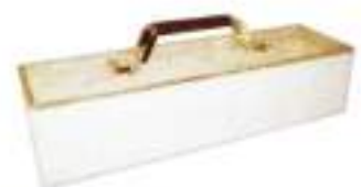
LI - 7980 CIDEX TRAY

BURN THE NEEDLE ELECTRICALLY AND CUT THE SYRINGE TIP WEIGHT APPROX:2.5KG MOTION TOLERNT