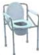
LI - 7820 INVALIDS COMMODE STOOL