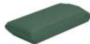
LI - 7965 PILLO