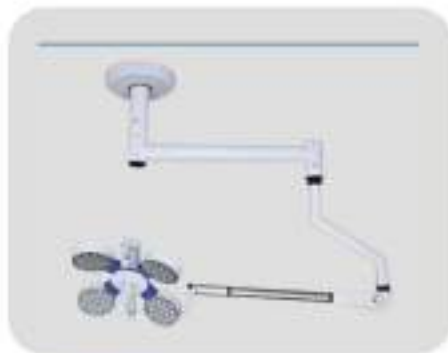
LI - 8030 LED 4