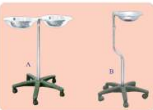
LI - 7185 WASH BASIN STAND Made from CRCA pipes on 5 cms castors provided with 35cms SS basin. Pre-treated powder coated.