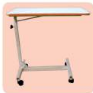
LI - 7230 OVER BED TABLE

Made of CRCA 16SWG pipes/ flats, On 5 cms castors, Fixed / Twin Stand Laminated wooden-top with a dimension of 30"x16", Pre-treated powder coated. Dimension: 42" L x 16" W x 39" H.