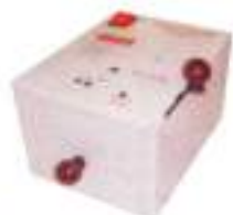
LI - 7975 NEEDLE AND SYRINGE DESTROYER

A - 20"x8"x8" (THREE TRAYS) B- 23"x8"x6"(THREE TRAYS) C- 26"x8"x6"(THREE TRAYS) D- 23"x12"x12"(THREE TRAYS)