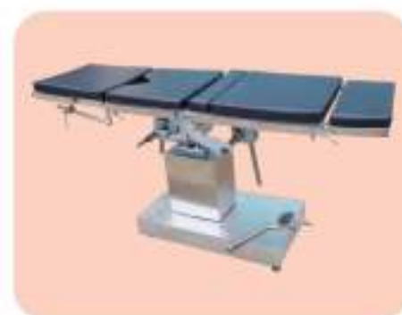
LI - 8055 UNIVERSAL HYDRAULIC OPERATING TABLE