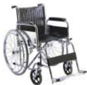
LI - 7801 WHEEL CHAIR (FOLDING)

Frame made of CRCA steel tubes Fixed Arm - rest and Foot-rest 18" Seat and Back -rest. Seat belt On 125 mm front casters On 650 mm rear wheel with brakes Dimension: 1050 L x 650 W x 900 H mm approx Pre-treated and Epoxy Powder Coated