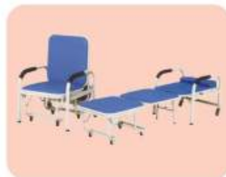
ATTENDANT'S BED - LI - 6530

Frame made of rectangular CRCA pipes CRCA perforated sheet top CRCA head and foot bowsPre-treated powder coated Dimension : 187 L x 60 W x 45 H cms ( App )