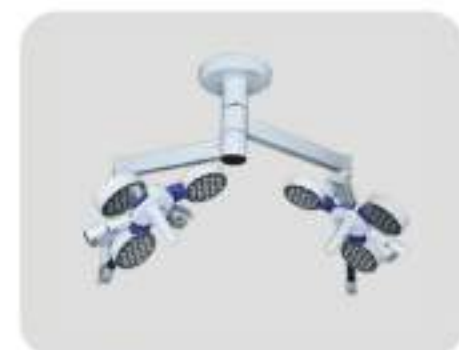
LI - 8040 LED 3 + 3