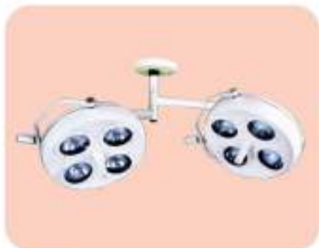
LI - 8015 SURGICAL LIGHT BRILLIANCE - 4+4 - C