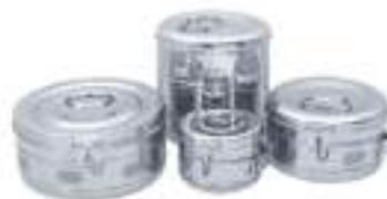
LI - 7670 DRESSING DRUM (S.S)ex