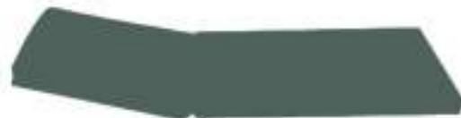
LI - 7955 MATTRESS FOR SEMI FOWLER BED