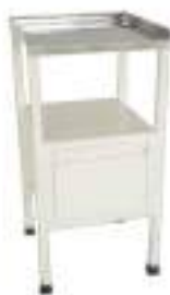
LI - 7465 BED SIDE LOCKER (GENERAL)

Made of CRCA pipes/ sheets closed on three sides. One storage box and one draw. Provided with SS/ laminated top, on two 5 cms dia swiveling castors two PVC/ rubber stamps. Pre - treated powder coated finish. Dimension: 16"Lx 16"Wx 32"H.