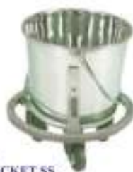
LI - 7180 KICK BUCKET SS Bucket with stainless steel frame castors Capacity 12L bucket Dimension: 35cm D x 35cm H