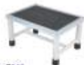
LI - 7169 FOOT STEP (SINGLE) Made from CRCA pipes/sheets, Rubber matted top, On PVC/rubber stamps Pre-treated powder coated. Dimension: 18" Lx 9"W x 9"H.