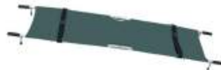
LI - 7510 FOLDING STRETCHER Stainless Steel /non corrosive or heavy duty aluminium. Poles must have proper non -slip Grip on Handle Size : (open) L-2070mm W-550mm x H-150 mm