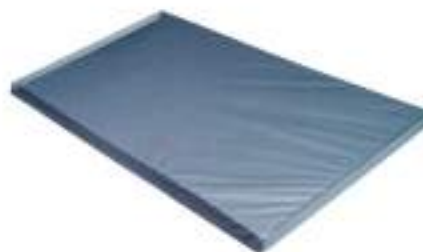
LI - 7960 MATTRESS FOR PLAIN BED