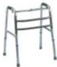
LI - 7825 INVALIDS WALKER