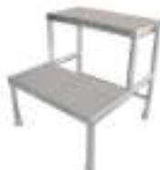
LI - 7175 FOOT STEP (DOUBLE) Made from SS pipes/sheets, Rubber matted top On PVC/rubber stamps Stainless Steel frame Dimension: 18" Lx18"W x 18"H.