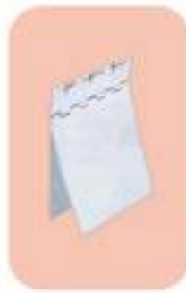
LI - 7925 PATIENT CASE SHEET HOLDER Made from Aluminium/ABS sheet Single with chrome plated clip double (file type)