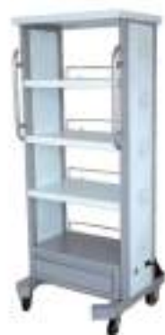
LI - 7475 MONITOR TROLLEY / ENDOSCOPE / VIDEO

One Drawer, One Towel rail. Four 50mm castors. Overall Size: 450L x 450W x 760H