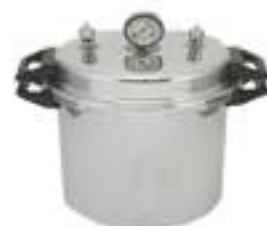
LI - 7665 AUTO CLAVE

Fast cycle time, 19 litre capacity. (Electric ) Automatic shut off at the end of both the sterilization and dry cycles Long life electro polished chamber and door. Double safety locking device prevents door from opening while chamber is pressurized. Drain valve for quick and easy draining of water reservoir Self action thermostat