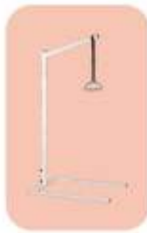
LI - 7920 LIFTING POLE