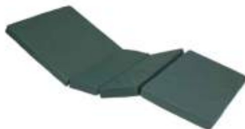
LI - 7950 MATTRESS FOR SEMI FOWLER/ ICU BED