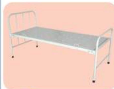
PLANE BED LI - 6500

Frame made of rectangular CRCA pipes CRCA perforated sheet top CRCA head and foot bows provided with mattress guard provision for fixing IV/Saline rod Pre-treated powder coated Dimension : 203 L x 90 W x 60 H cms (Approx).