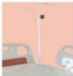
LI - 7901 IV. ROD FOR HOSPITAL BED