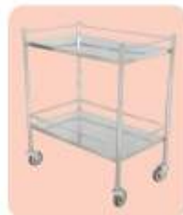
LI - 7101 INSTRUMENT TROLLEY SS

Made of SS 16 SWG pipes/ 20 SWG two shelves, provided with three-side side railing on top, having four side-railing on bottom self, on 7.5 cms castors.