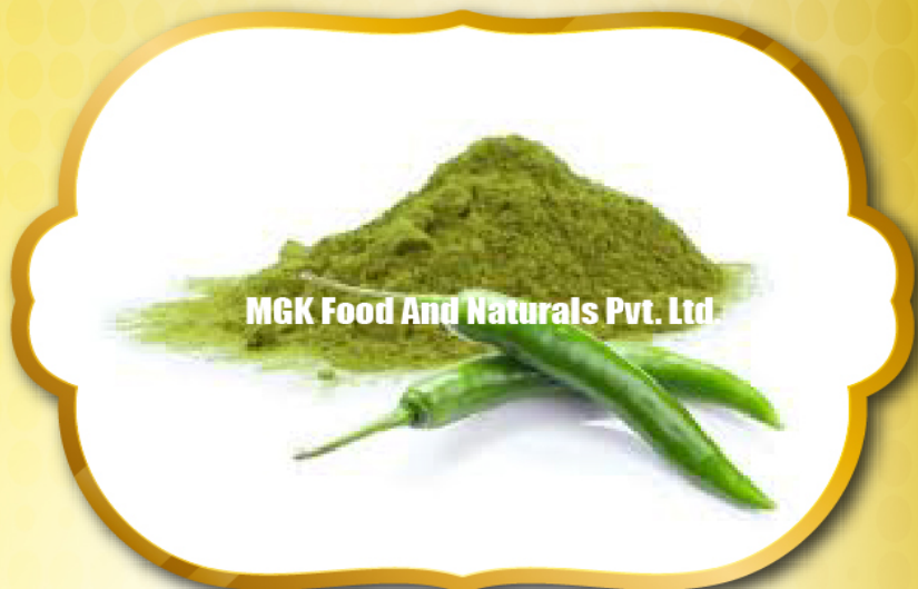
Green Chilli Powder