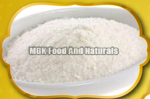
Calcium Caseinate Powder