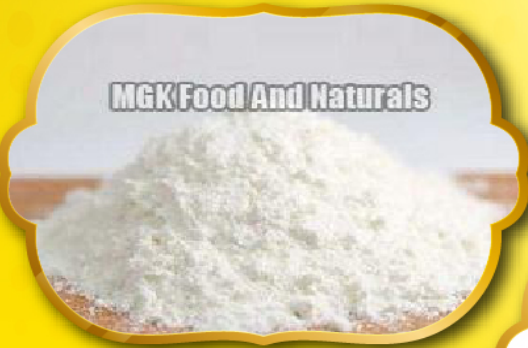
Sodium Caseinate Powder