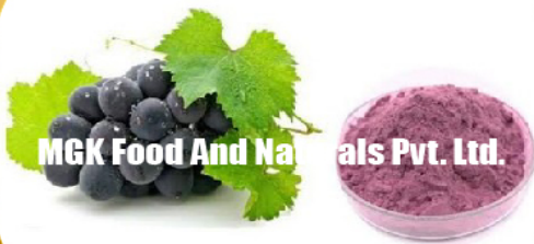
Black Grapes Powder