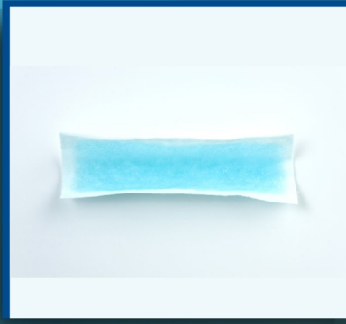
Fever Cool- ing Patches