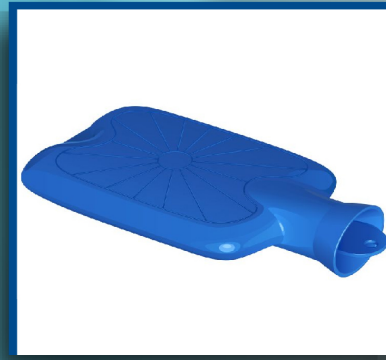
Hot Water Bag