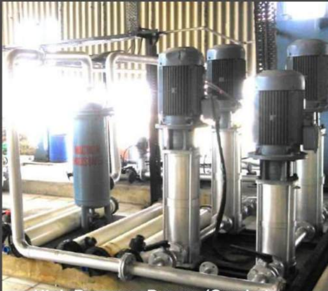
High Pressure Pumps.(Combo) Pressure: 60 Bar. Flow: 90 M 3 /Hr

Boiler Feeding Systems Fire Fighting Systems Industrial Plants Reverse Osmosis Systems Ultra filtration Systems