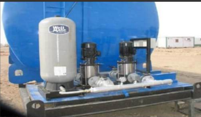
Hydropneumatic Pressure Booster Pumps