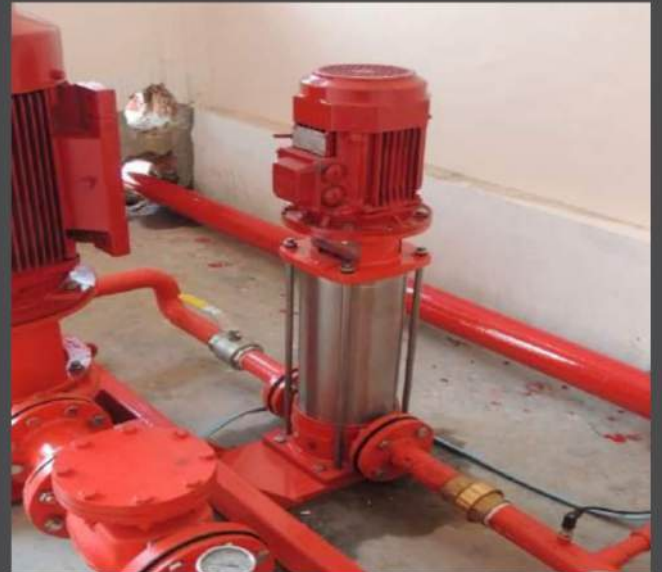
Jockey Pump fitted in Fire Fighting System.