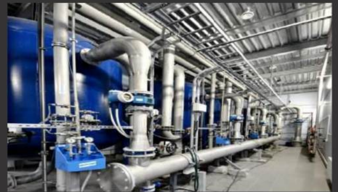
Boiler Feed Pumps