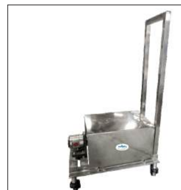
SSEG GEAR BAREPUMP WITH MOTOR & S.S TROLLY

Video Link : https://www.youtube.com/watch?v=vGUhU-yVKss