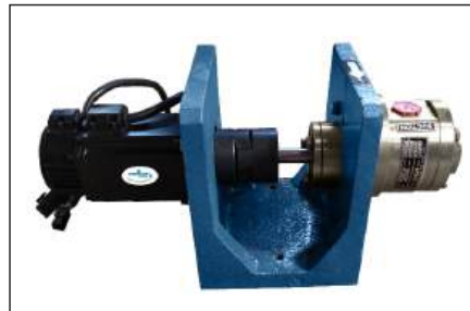
SSEG GEAR BARE PUMP WITH BLDC MOTOR