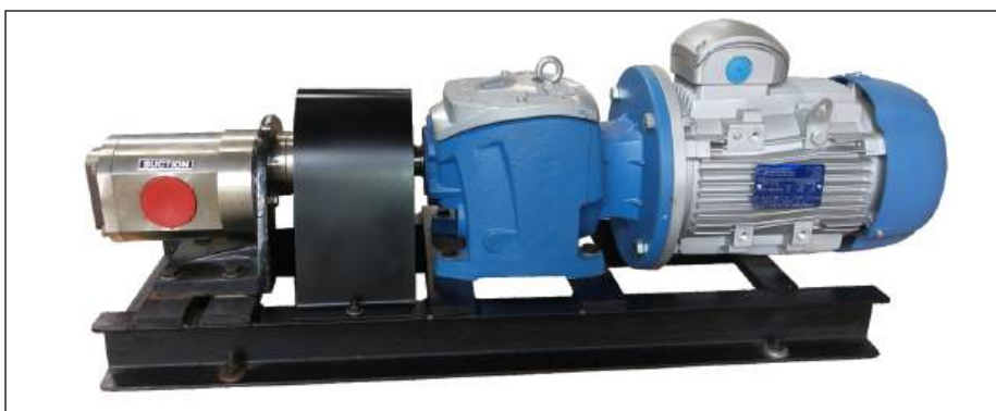
SSEG GEAR BARE PUMP WITH ROTO MOTIVE GEAR MOTOR