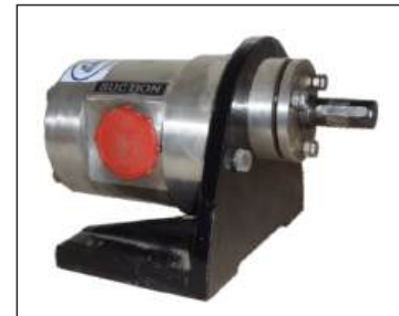
SSEG GEAR BARE PUMP