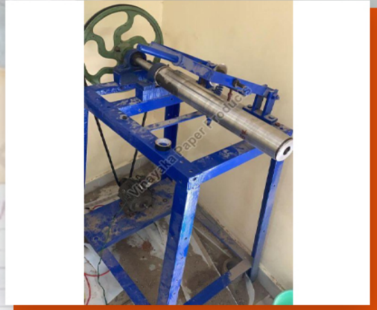
Paper Core Cutting Machine