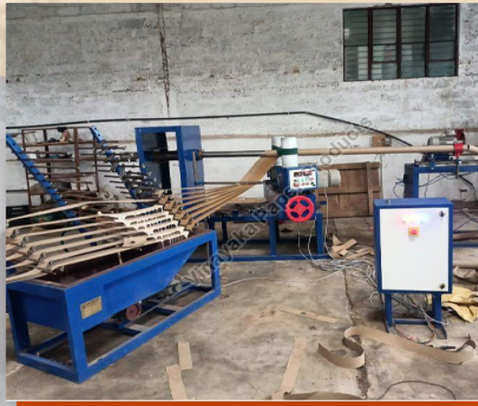
Fully Automatic Spiral Paper Core Making Machine