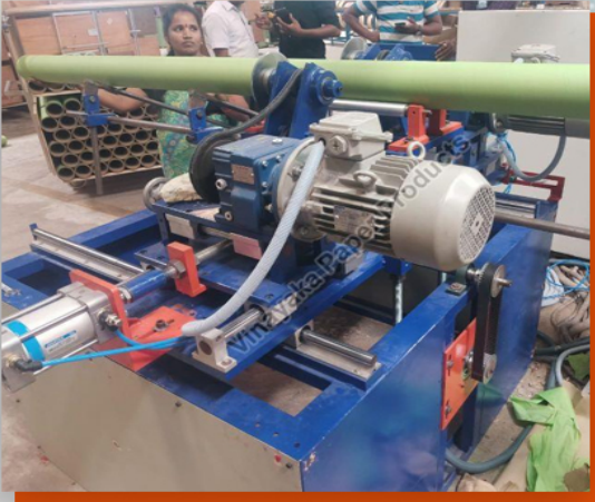
Fully Automatic Paper Core Cutting Machine