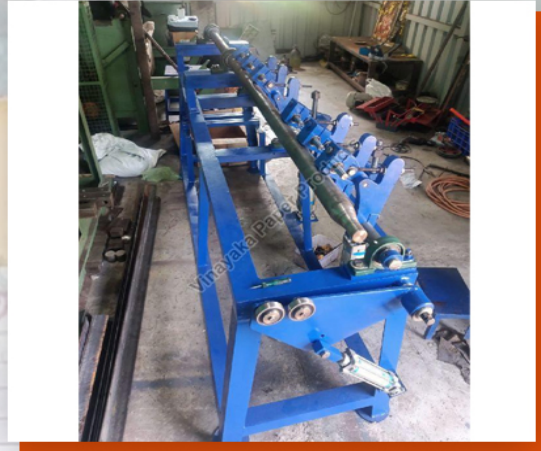
Semi Automatic Paper Core Cutting Machine