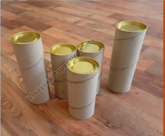
Paper Tube Containers