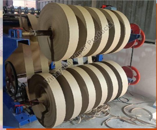
Paper Slitting Rewinding Machine