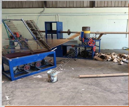
spiral paper core making machine