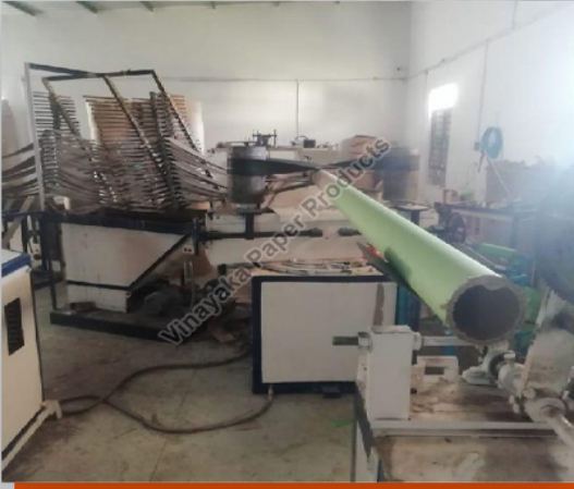
Semi Automatic Spiral Paper Core Making Machine