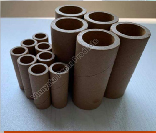
Paper Core Tubes