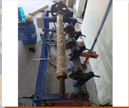
paper tube cutting machine