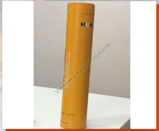
Paper Packaging Tubes