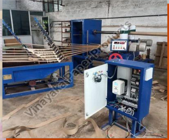
Spiral Core Making Machine