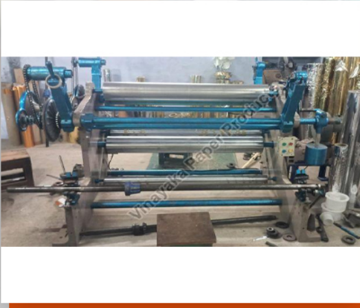
Automatic Paper Slitting Machine