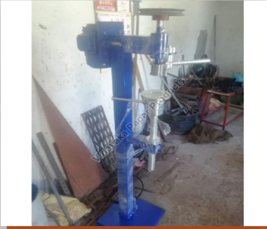
Paper Tube Seaming Machine