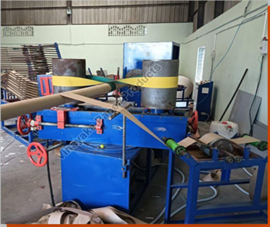
paper tube winding machine