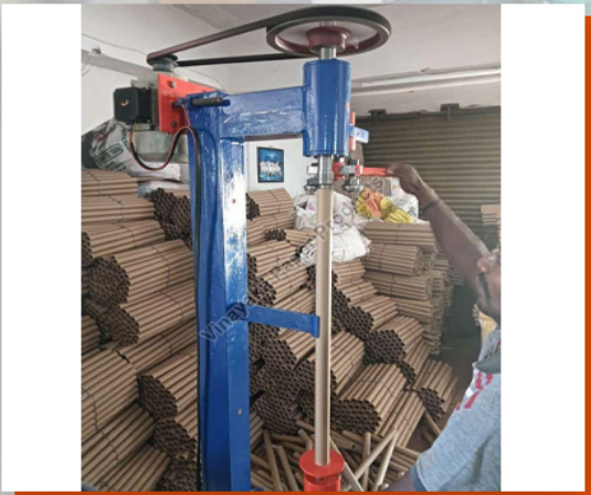
Seaming Machine Finer Working