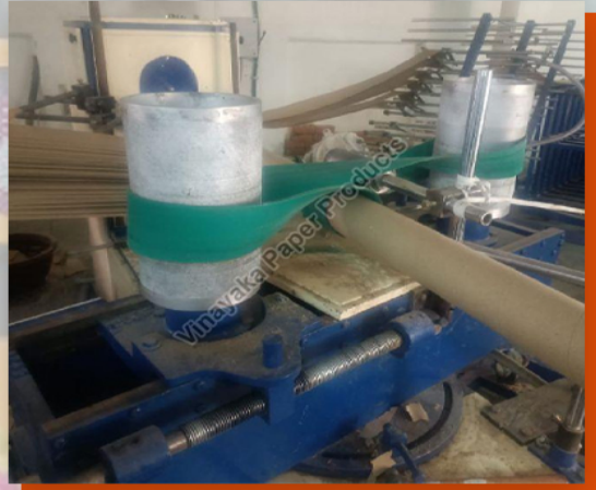
Fully Automatic Spiral Paper Tube Making Machine