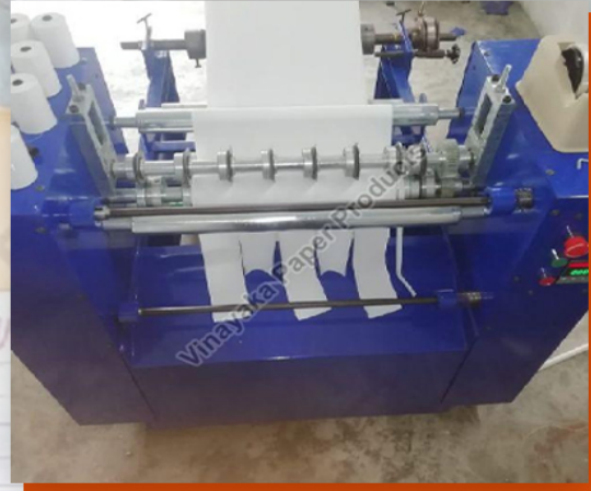
Thermal Paper Slitting Machine