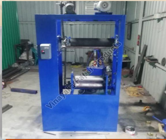
Paper Tube Labeling Machine