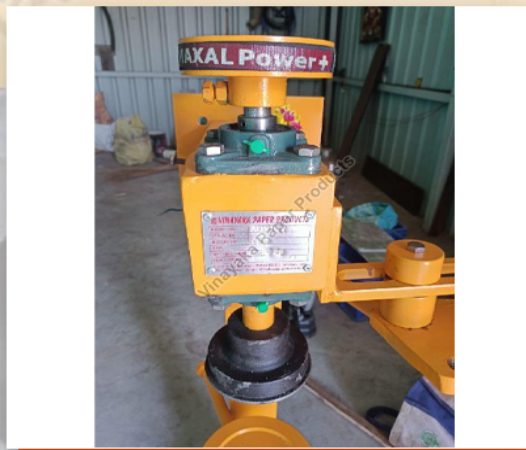
Can Seaming Machine