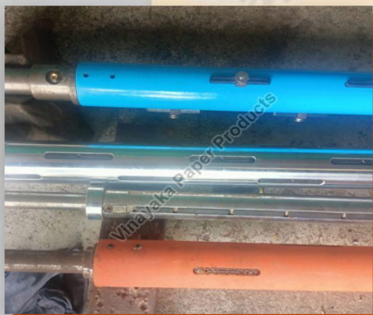
Air Expanding Shafts