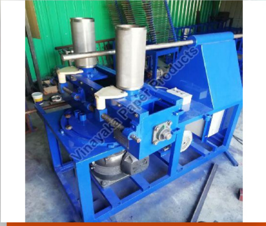
Semi Automatic Spiral Paper Tube Making Machine