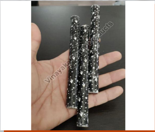
Candle Paper Tube