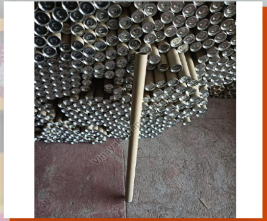
Finer Work Paper Tube